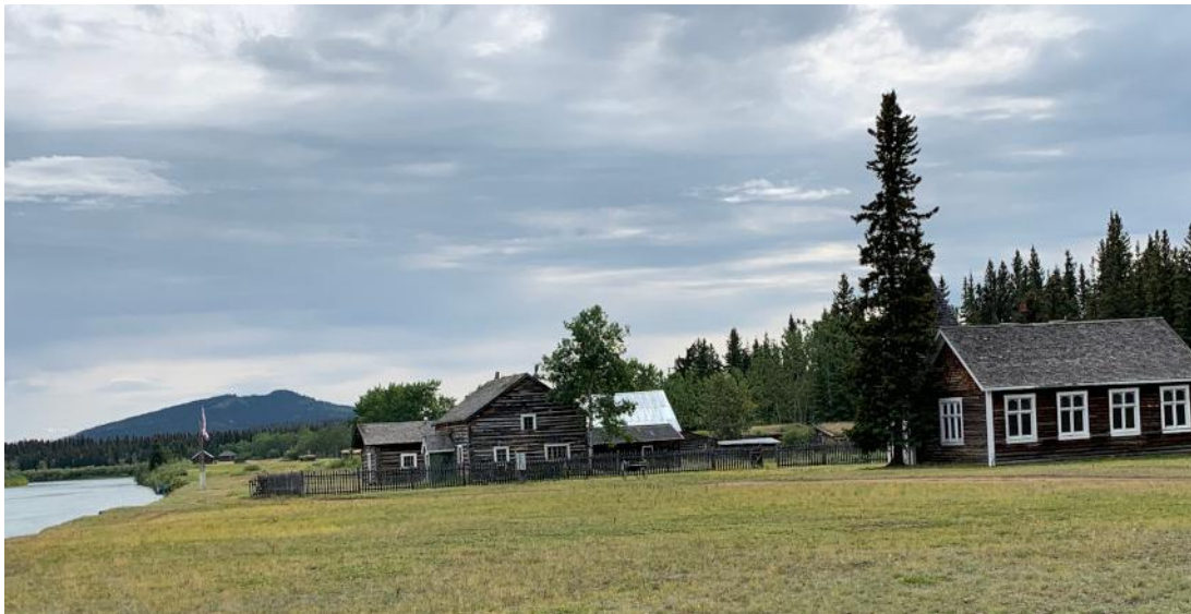
Figure 3. Fort Selkirk, L-R: school, Mission House and St. Andrew's Church, 20 August 2021.