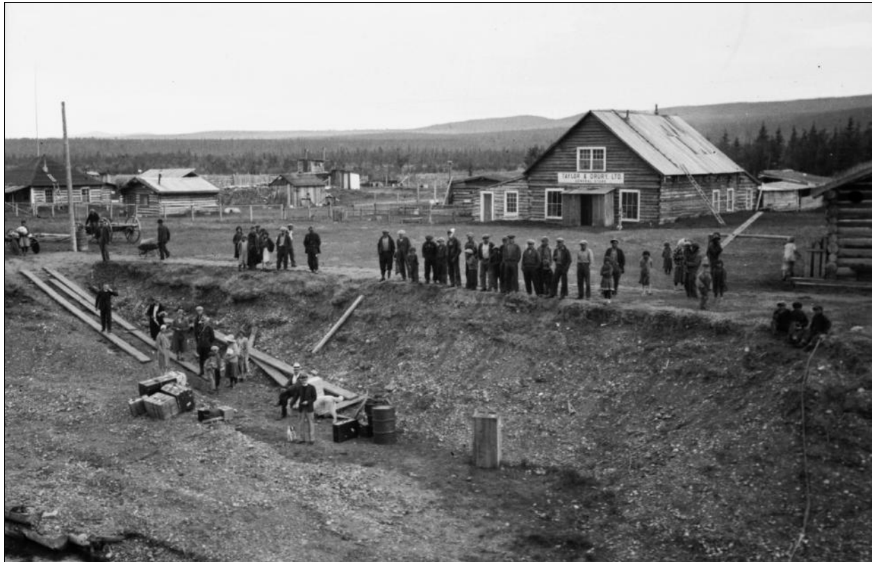
Figure 7. View of Fort Selkirk from a sternwheeler deck, June 1934.

2023 Note: Yukon Archives has renamed a number of the collections and fonds but the image numbers of the Catalogued Photos remain the same. In some cases, an institution has changed its name but the YA collection retains the old name. In that case, I put the new name in brackets below, e.g. Canadian Museum of Civilization, now the Museum of Canadian History.