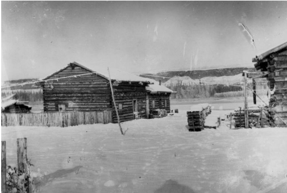
Figure 8. Harper's Post at Fort Selkirk, October 1897.

2023 Note: A number of the Yukon Archives fonds and collections have been renamed. Mostly the photo numbers are the same but in a few collections, such as the Martha Silas fonds and the Arthur B. Thornthwaite fonds, some images with “temporary numbers” have since been renumbered. Yukon Archives has caption lists with both sets of numbers.