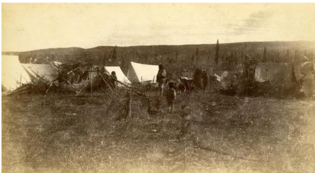
Figure 9. Native camp near Fort Selkirk, July 8, 1891.