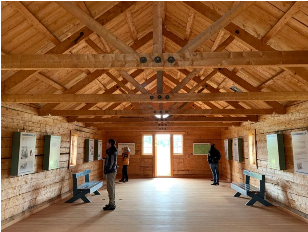
Figure 11. Interior of Big Jonathan House, 20 August 2021.

1971 The Opening of the Canadian North, 1870-1914 . Toronto: McClelland and Stewart. YA Ref 971 Za