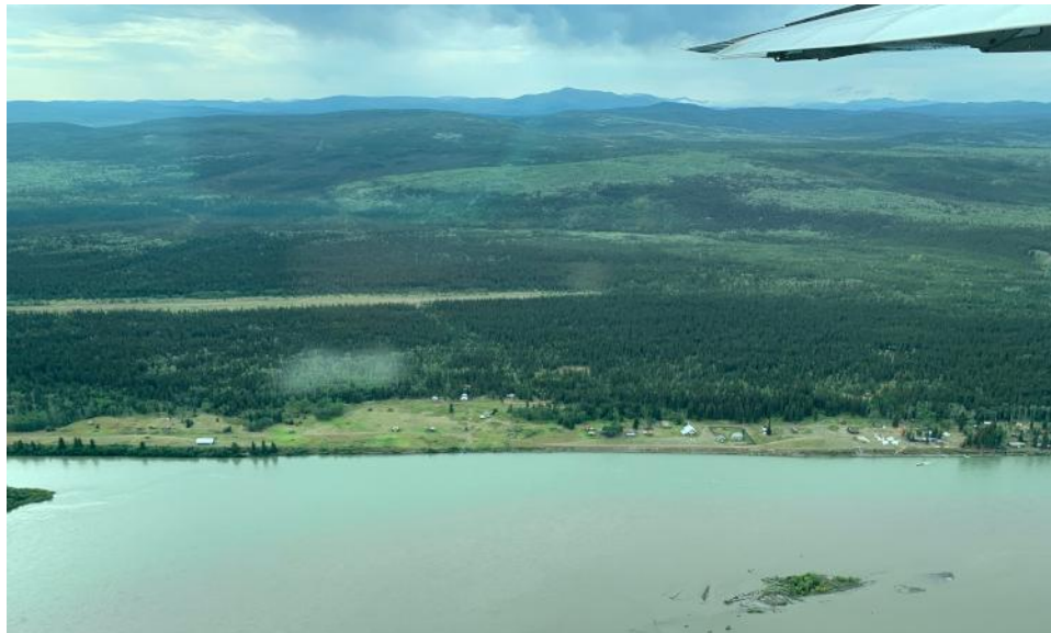
Figure 10. Aerial view of Fort Selkirk, August 20, 2021.

Note: The letters and numbers after each entry refer to the originating institute (BCA for British Columbia Archives, YA for Yukon Archives and WPL for Whitehorse Public Library, YA PAM indicates the location for an item in Yukon Archives pamphlet collection) followed by the catalogue number. See full list of abbreviations on p. 5.