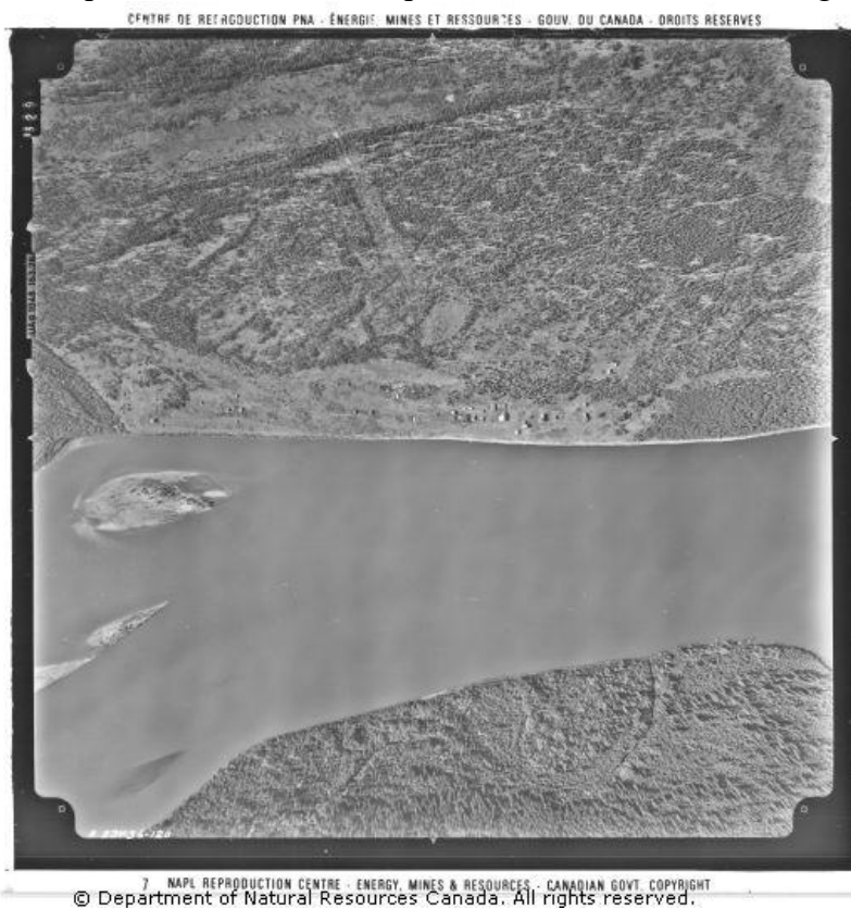
Figure 6. Fort Selkirk air photo, roll no. A23436, photo no. 120.

2023 Note: The citations below date from the 2000 bibliography. The GeoYukon site has a map layer showing roll and photo nos. of aerial maps as well as thumbnails of digitized air photos.