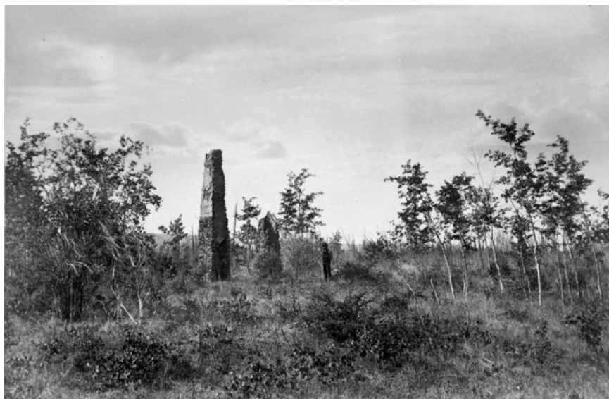
Figure 4. Ruins of original Fort Selkirk post, 17 August 1887. LAC, 3328517, photographer George Mercer Dawson.

(See also Publications & Reports section.)