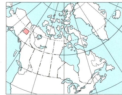
Figure 24. The stratigraphy and structure of the Keno Hill Quartzite in the Tombstone area, Yukon Territory.

Printed by the Surveys and Mapping Branch