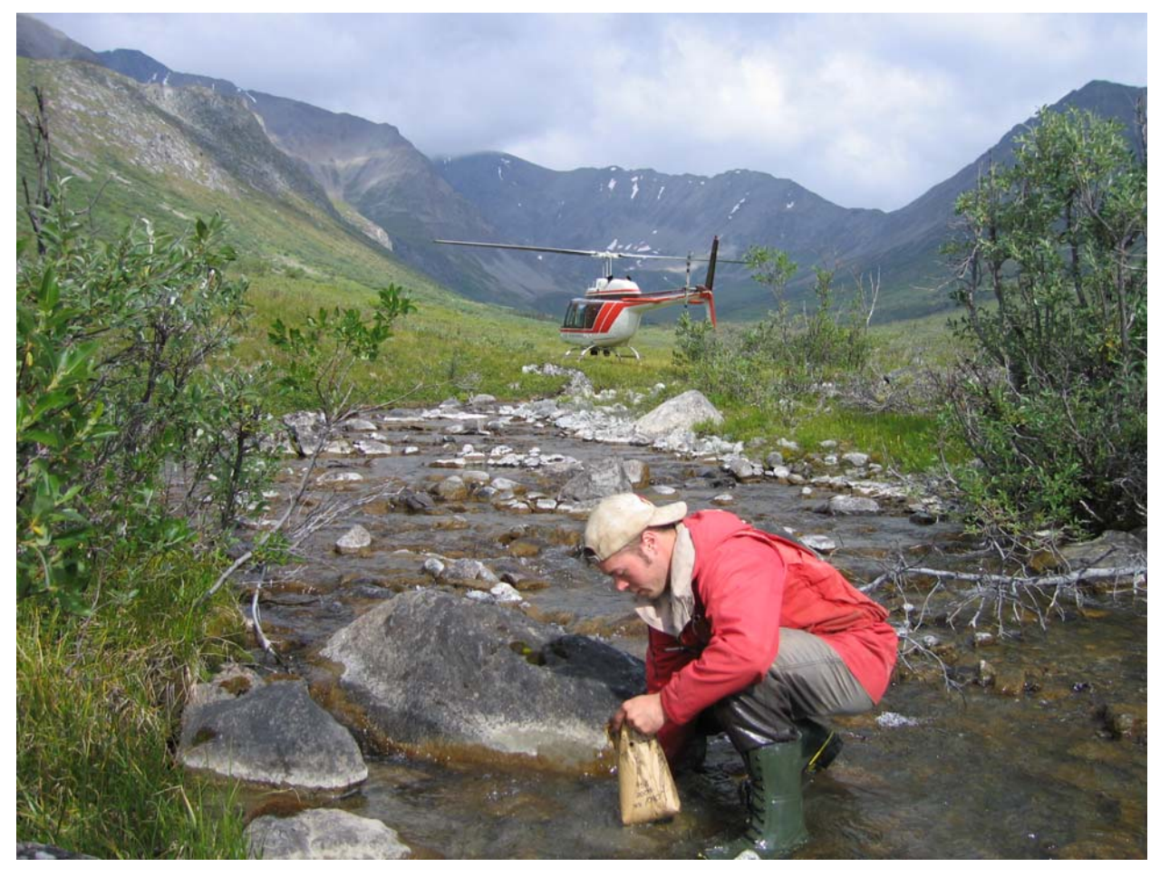
Figure 2. Pre-labelled Kraft paper bags and plastic bottles were used to collect samples of stream silts and stream waters. Flagging tape with a sample site number was used to mark sample sites. Field observations were noted on pre-printed water-resistant paper.

At each site a pre-labelled Kraft paper bag (12.5 cm x 28 cm with side gusset) (Fig. 2) was two-thirds filled with silt or fine sand collected from the active stream channel. In practice, the silt sample was collected after water samples were collected. Commonly, the sampler collected handfuls of silt from various points in the active stream channel while moving gradually upstream, normally over a distance of 5 to 15 m. If the stream channel consists mainly of clay, coarse material or organic sediment from which suitable sample material is scarce or absent, moss mat from the stream channel, which commonly contains trapped silt, may be added to the sample. A field duplicate pair of silt samples, assigned sequential sample numbers, is collected within each block of 20 samples. The first sample of the pair is assigned a replicate status value of 10 and the second is assigned a replicate status value of 20. Routine (non-duplicate) field samples are assigned replicate status values of 0.