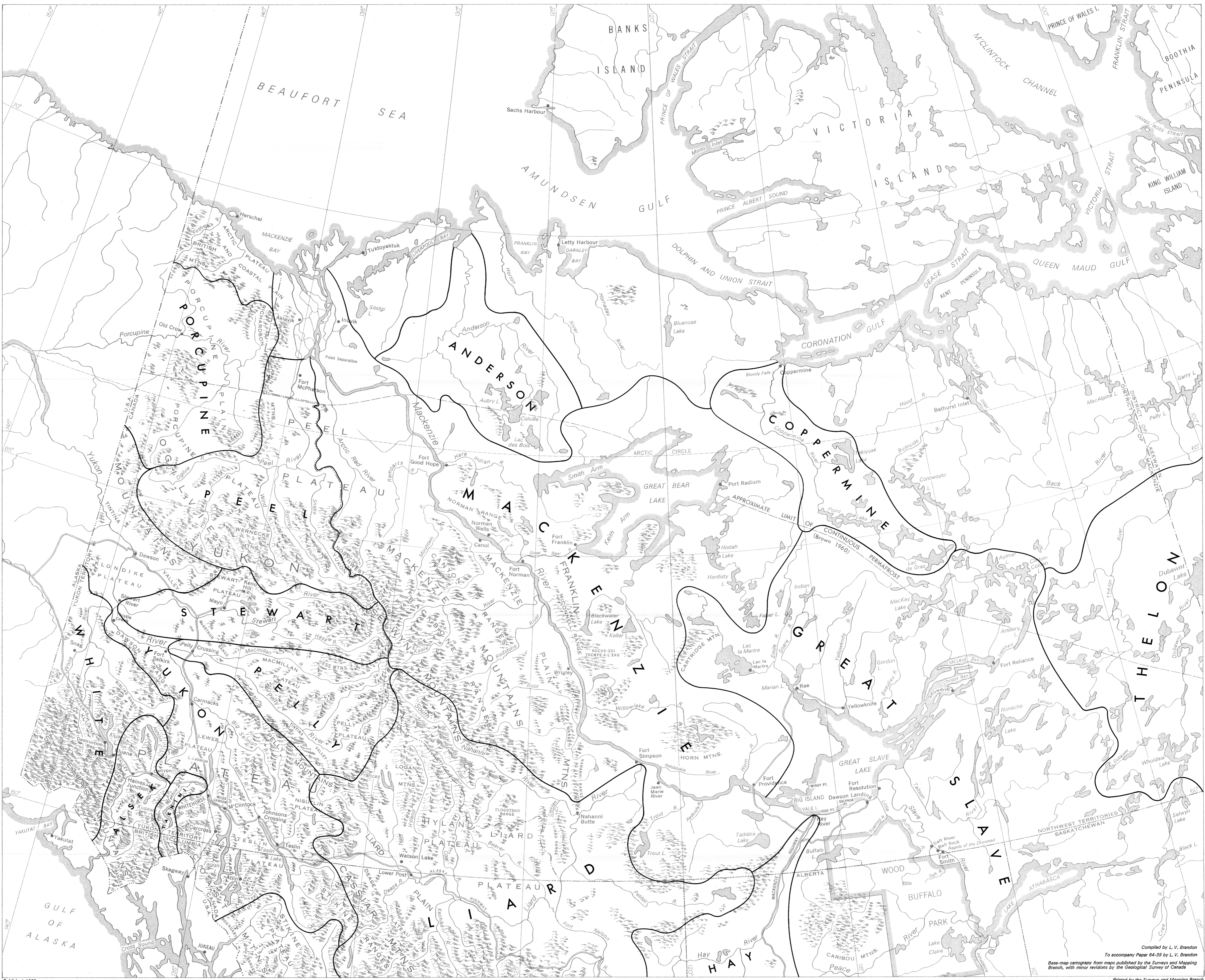
Figure 1. Major drainage areas, District of Mackenzie, Yukon Territory, and northern British Columbia

This document was produced by scanning the original publication. Ce document est le produit d'une numérisation par balayage de la publication originale.