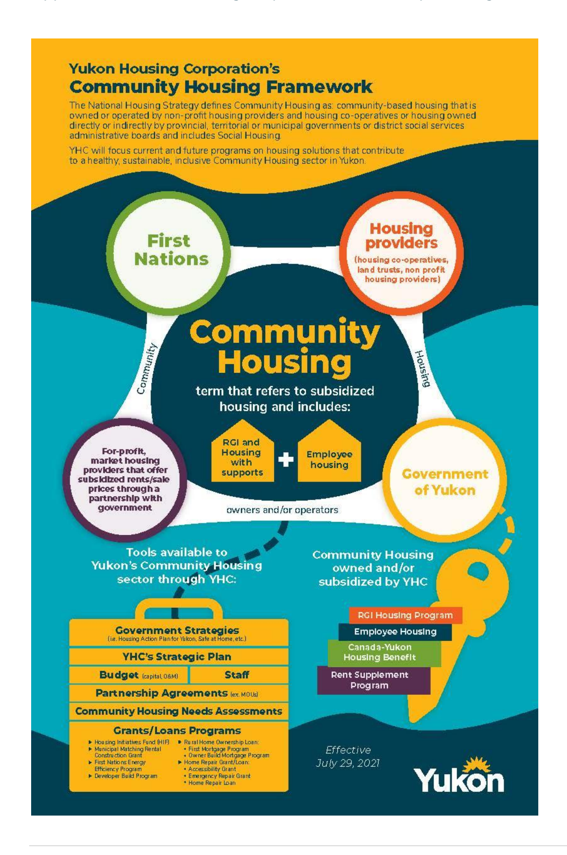
Appendix 6: Yukon Housing Corporation Community Housing Framework