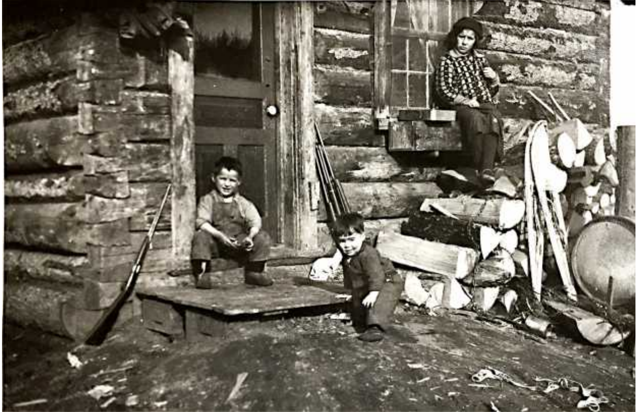
Lansing Creek, n.d.