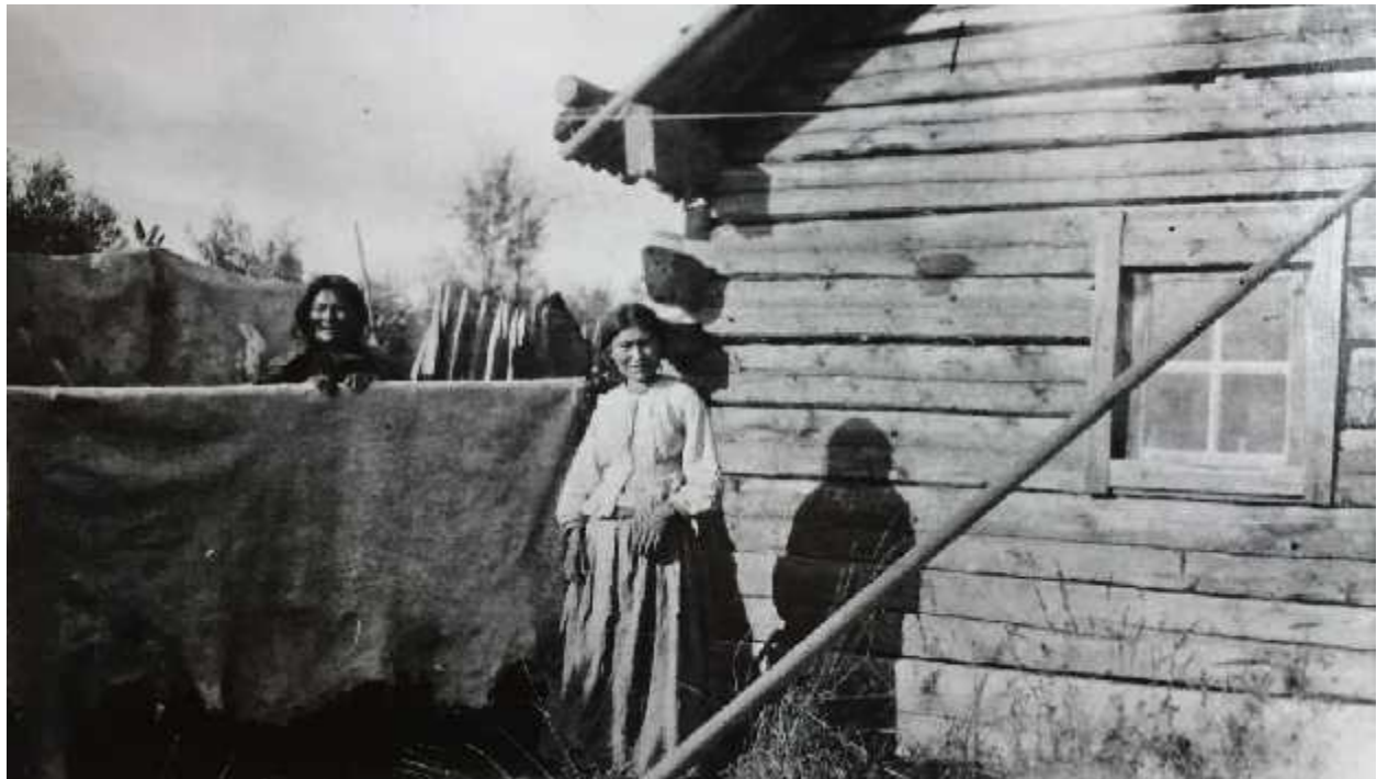
Tanning moosehide at Lansing Creek, n.d.