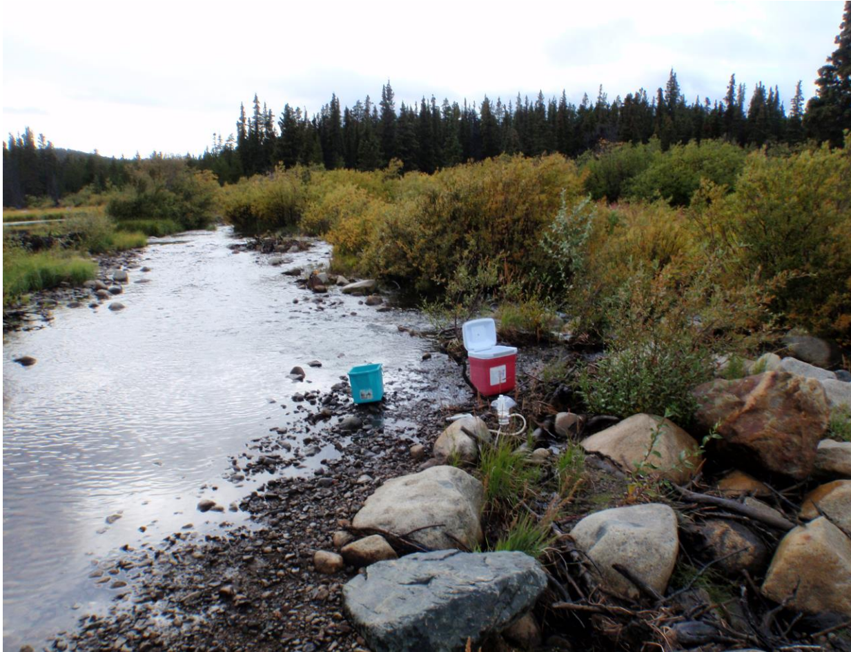
Photo 3: Surface water sampling at the outflow of the unnamed pond.

The analysis of the surface water samples for dissolved metals indicated a slight but insignificant increase in metal content in the outflow sample compared to the inflow (see Appendix for analytical report). The concentrations are below the Yukon Contaminated Sites Regulations and CCME guidelines for the protection of aquatic life (YCSR 2002, CCME 2002).