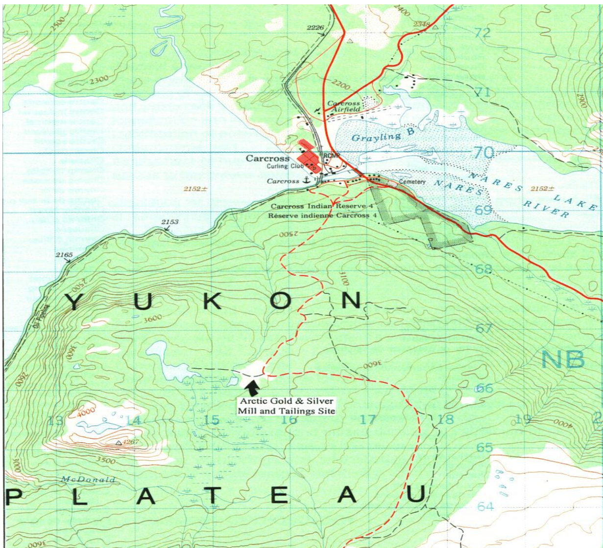
Figure 1: Location of Arctic Gold and Silver Tailings

The Arctic Gold and Silver mill and tailings impoundment is located approximately 4 km south of the Village of Carcross on the road to both the Arctic Caribou and Big Thing mines on Montana Mountain (60° 08' 00'' N, 134° 43' 20'' W).