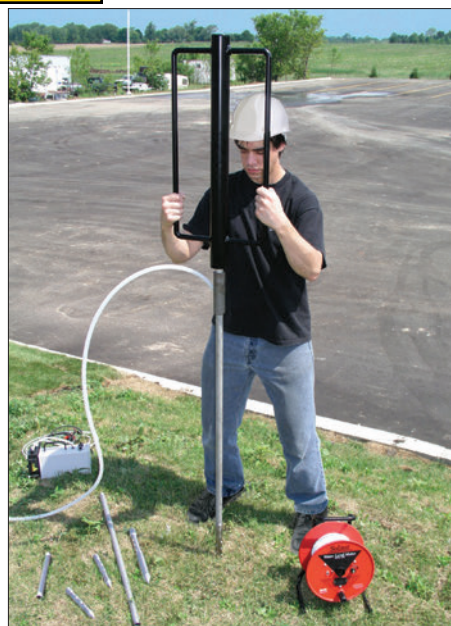
Installing Piezometers with a Manual Slide Hammer

Solinst Drive-Point Piezometers can be driven into the ground with any direct push or drilling technology, including the Manual Slide Hammer shown at right. To avoid clogging or smearing of the screen during installation, a shielded version is also available.