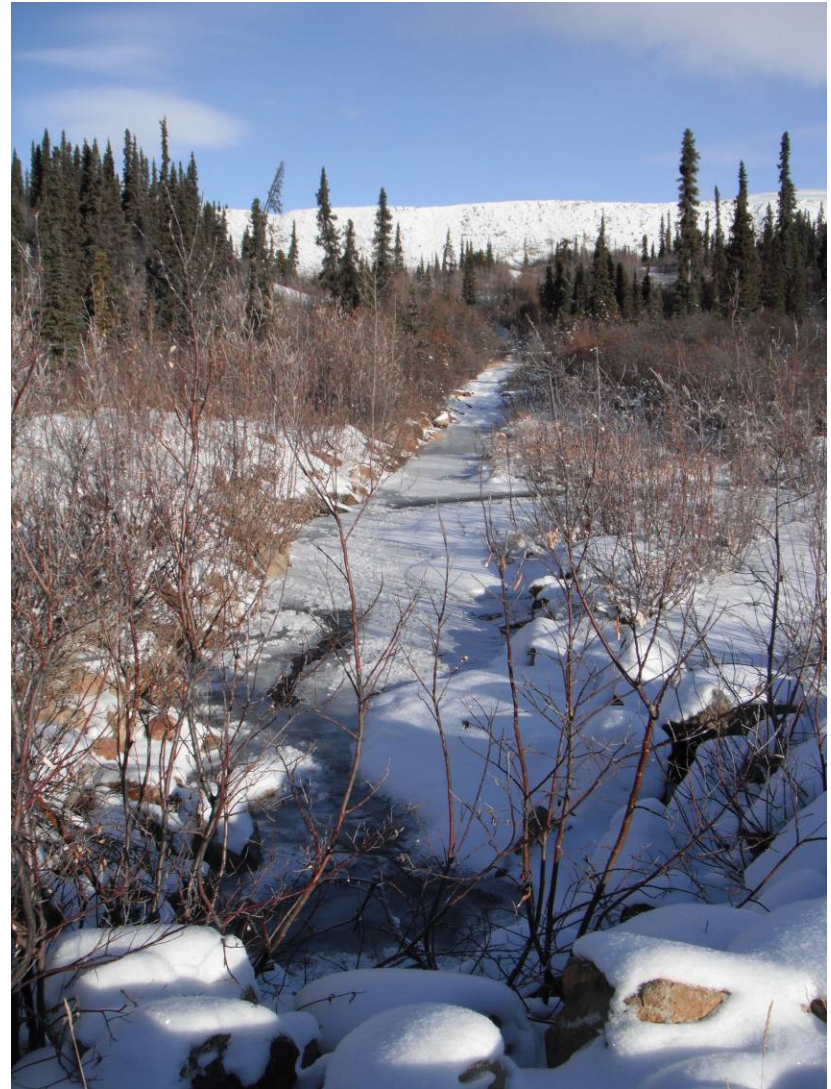
Photo #3; VW3, looking upstream from culvert, October 24 th , 2012.