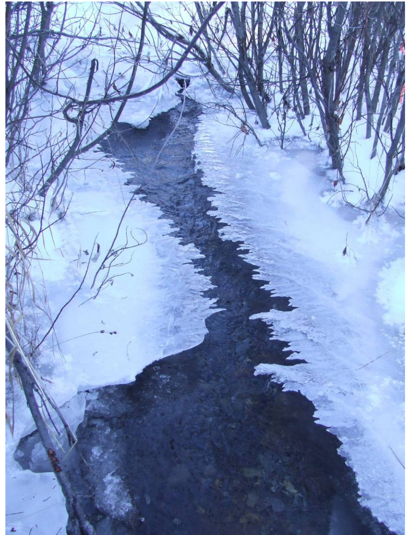
Photo #5; VW2, open water just upstream of culvert, Oct 22 nd , 2012.