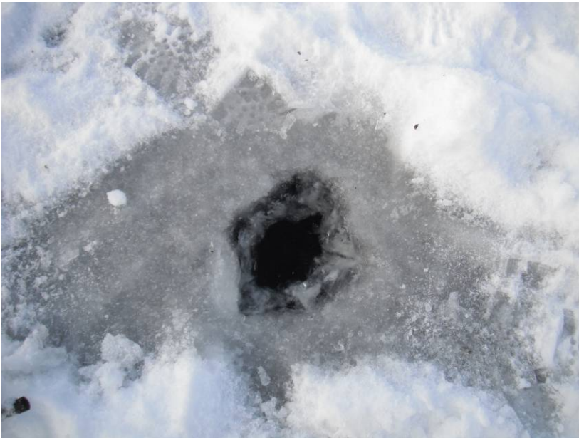
Photo #6; V20A, sampled from pool upstream trail. Oct 23 rd , 2012.