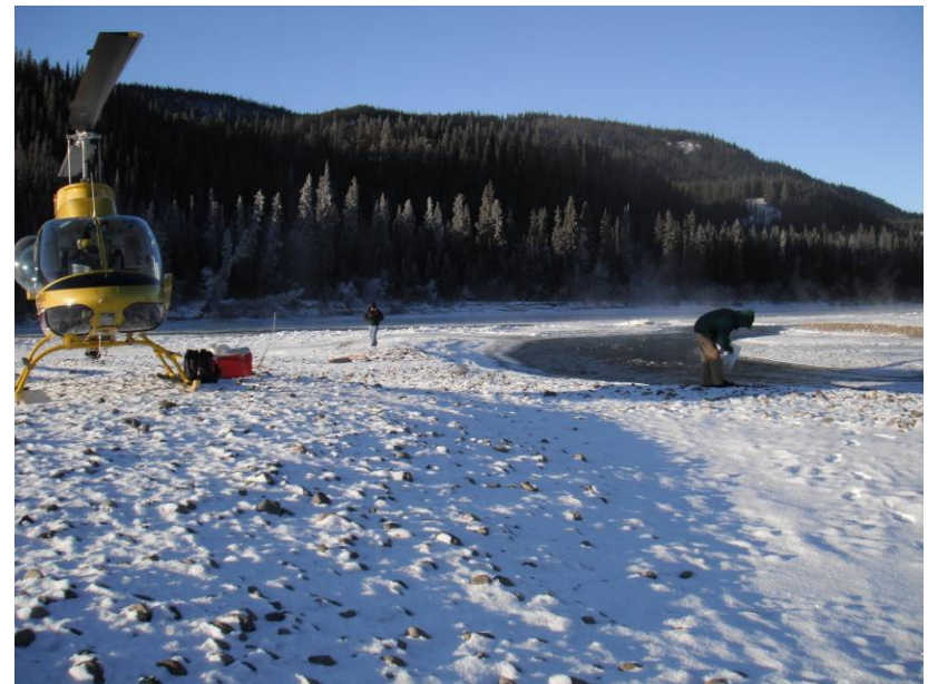
Photo #20; A1 was sampled at the mouth due to ice cover, Oct 23/12