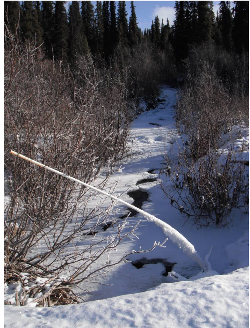
Photo #12; K8 looking upstream from the culvert, October 24 th , 2012.