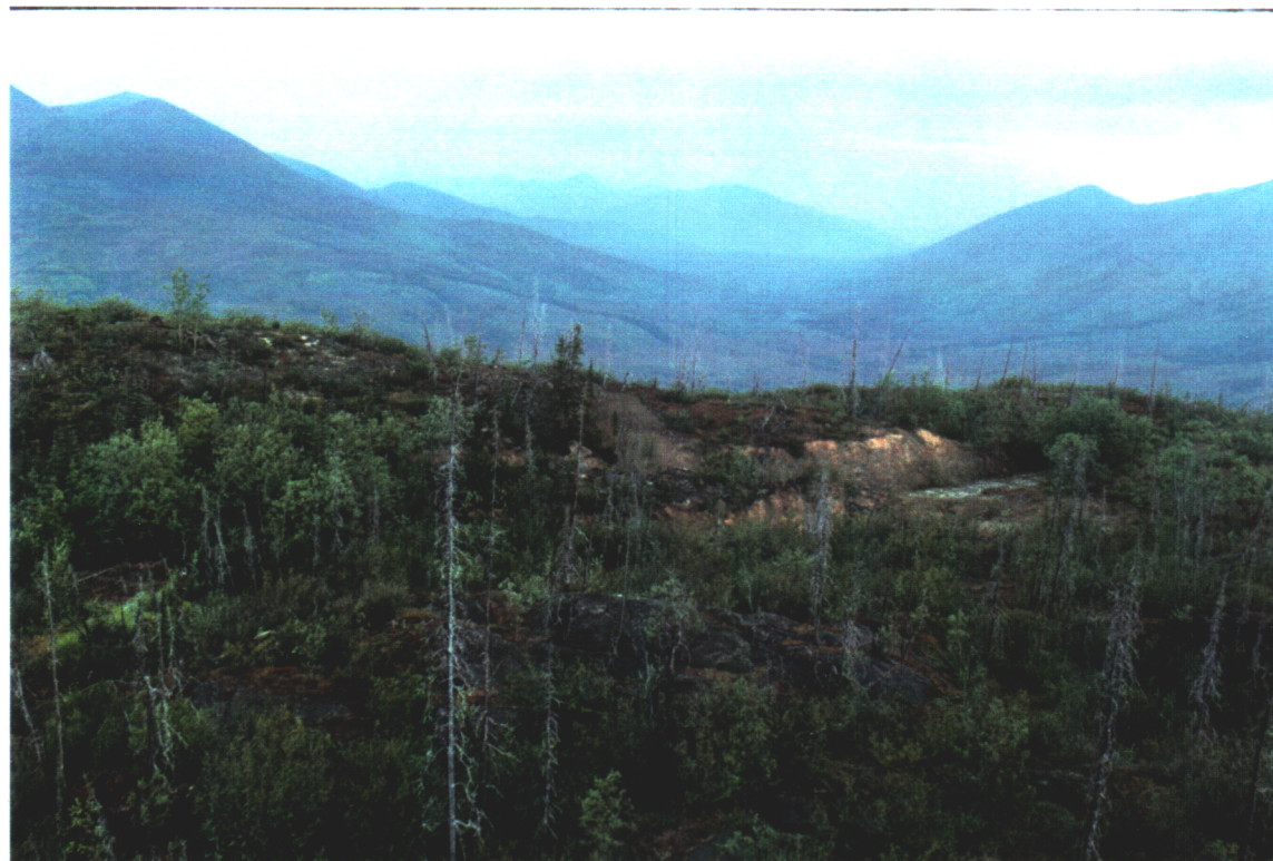
VIEW OF SITE SHOWING TRENCHING AND ROCK OUTCROPPINGS