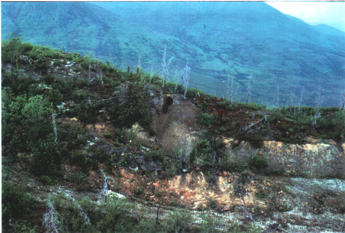
DISTANT VIEW OF ADIT AND TRENCHING