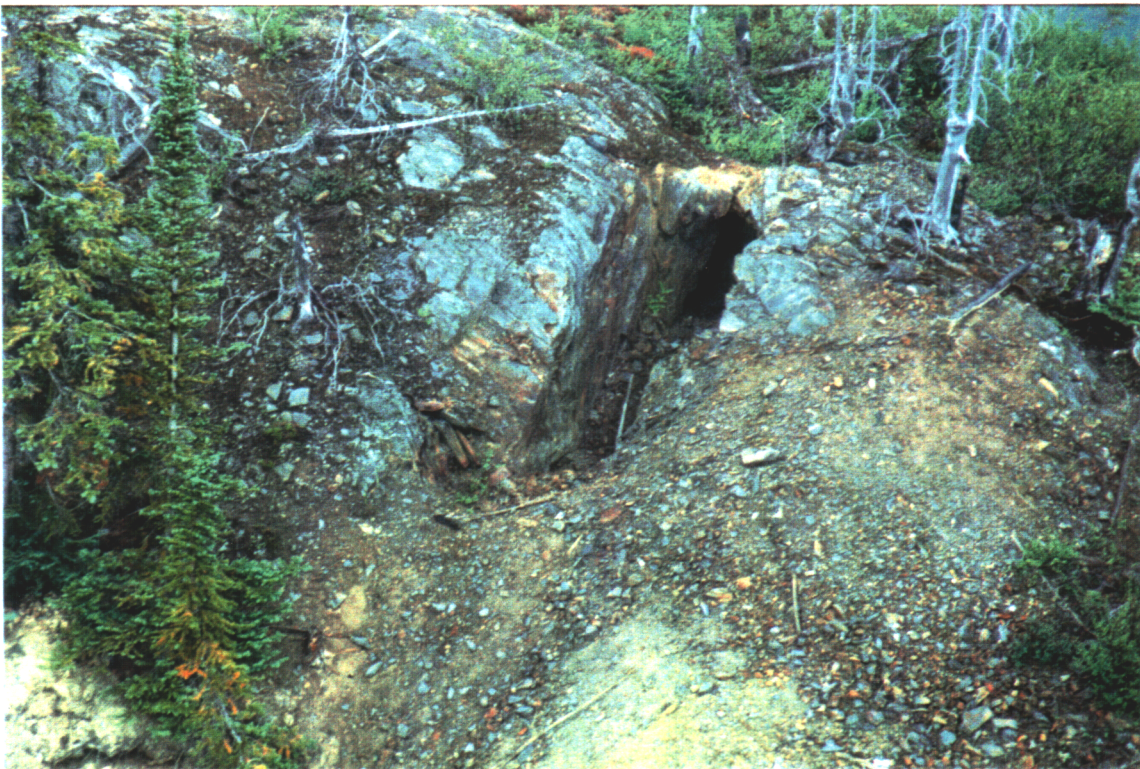
CLOSE-UP VIEW OF ADIT