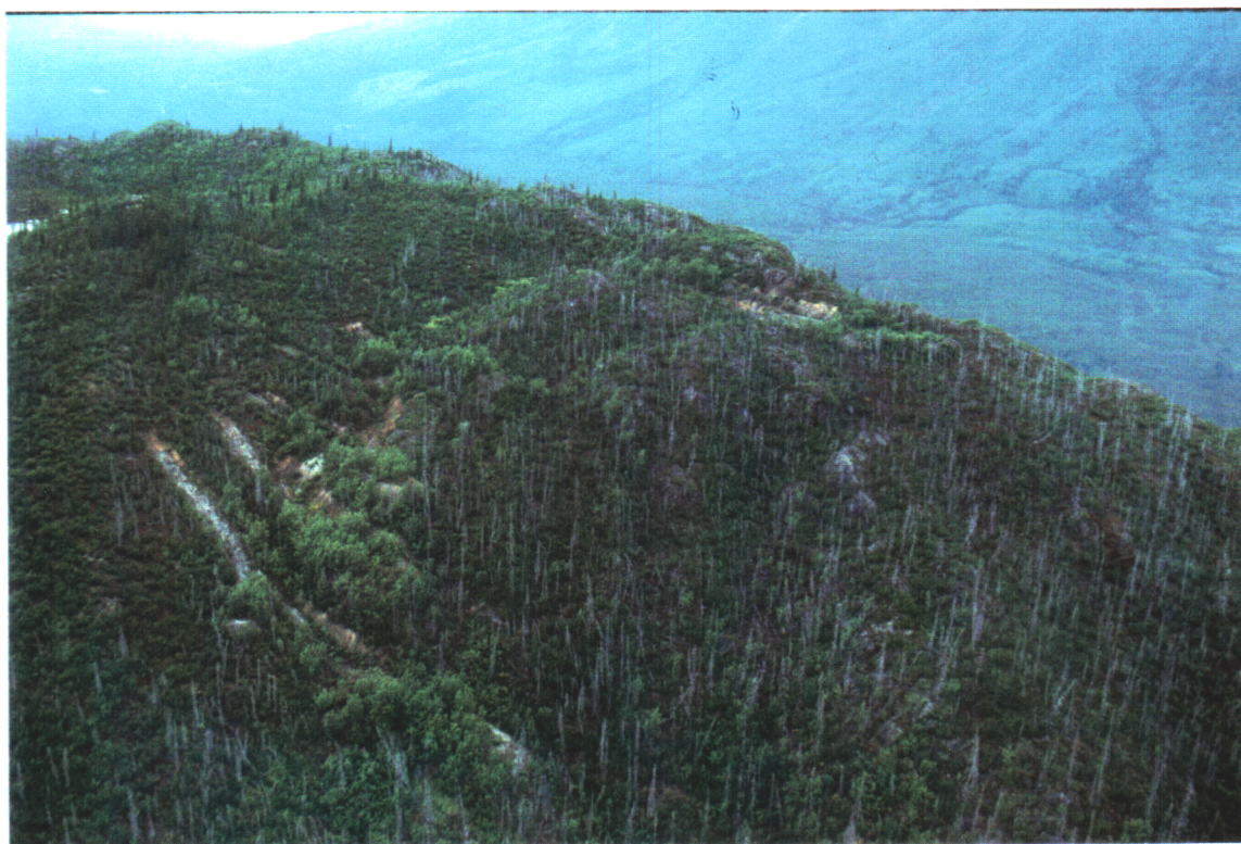
OVERALL VIEW OF SITE