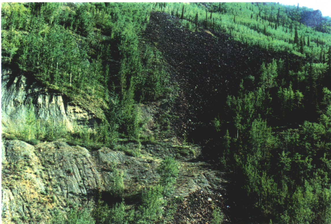
OVERVIEW OF SITE SHOWING PIPE (LOWER PART OF PHOTO)