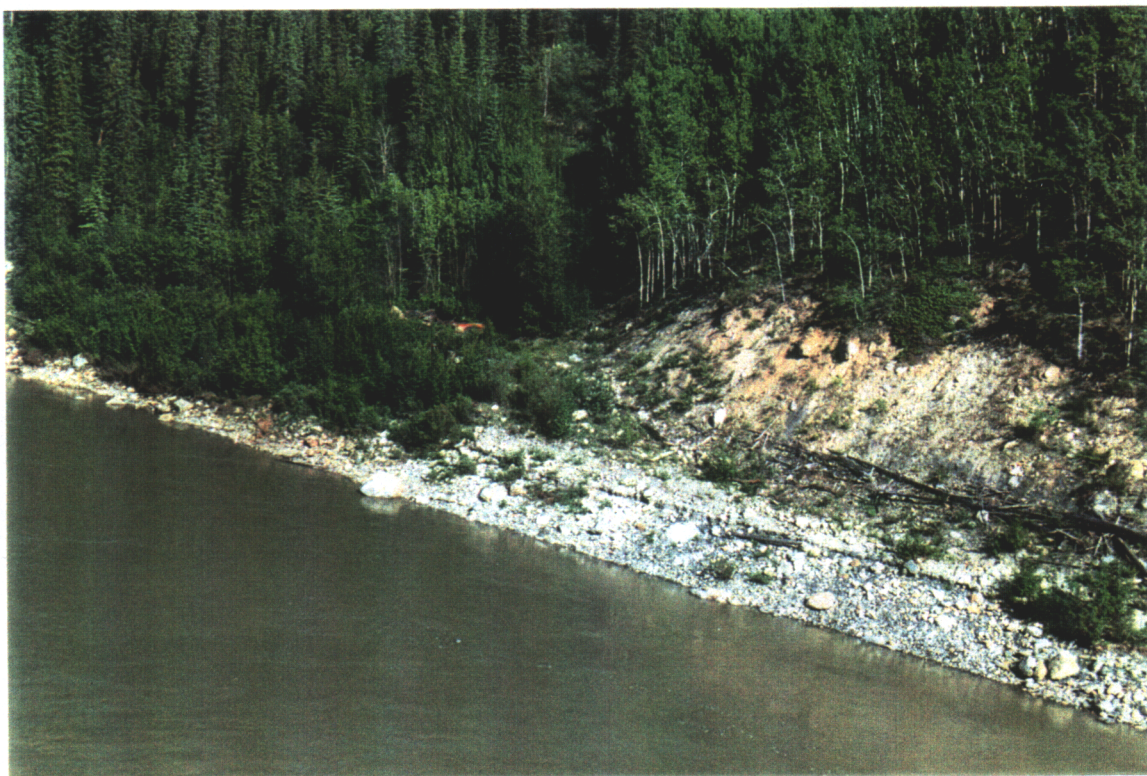
RIVERBANK AT SITE