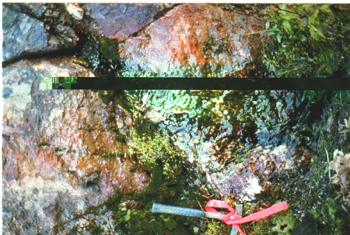
Photo 59-5. Seep from the rock around the vein. Note green moss growing in water.