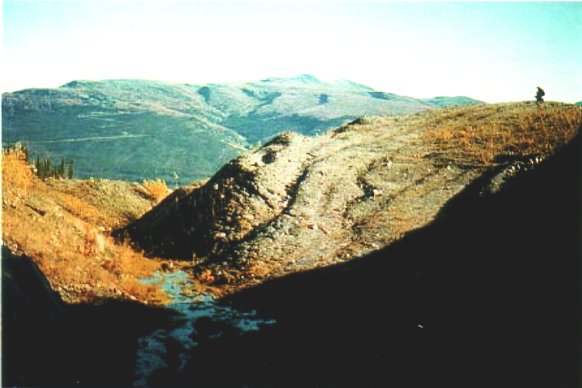
Photo 59-3. Main waste rock pile, looking east. Note water from seep and revegetation of waste rock.