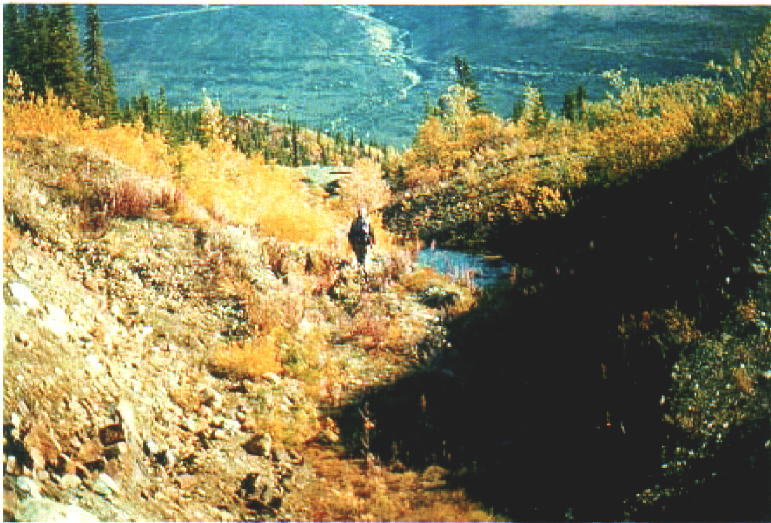
Photo 59-1. Trench, looking eastward from below the shaft.