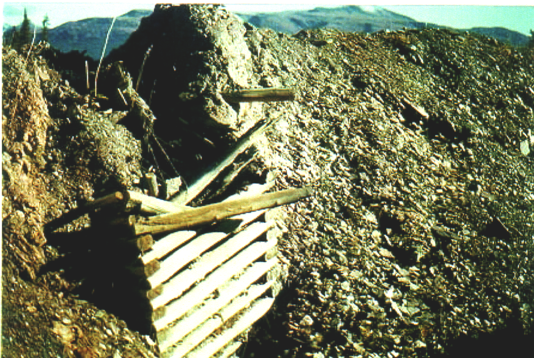
Photo 59-2. Collapsed shaft in center of trench.