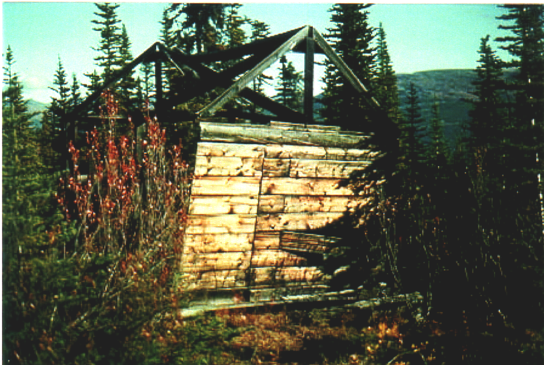
Photo 59-4. Wooden cabin.