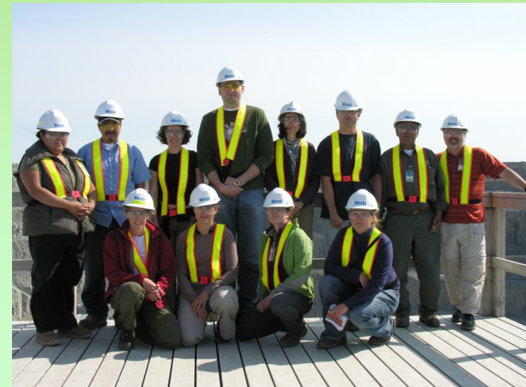
ICRP Working Group Site Visit June 2007