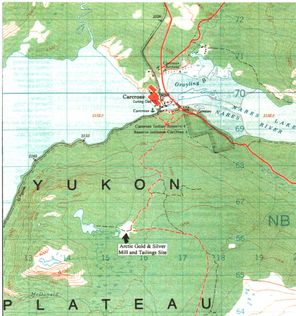
Figure 1: Location of Arctic Gold and Silver Tailings

The Arctic Gold and Silver mill and tailings impoundment is located approximately 4 km south of the Village of Carcross on the road to both the Arctic Caribou and Big Thing mines on Montana Mountain (60° 08' 00" N, 134° 43' 20" W).