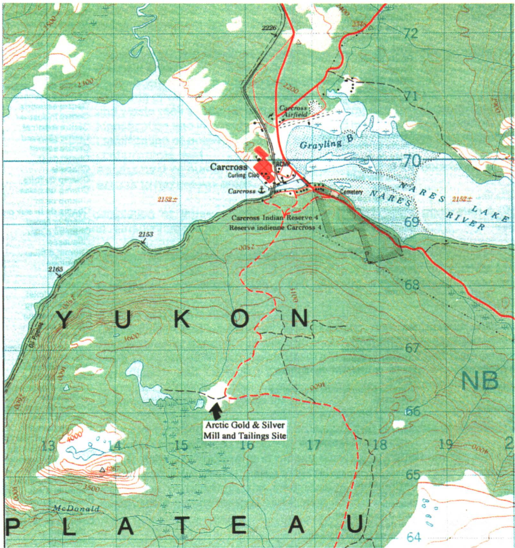
Figure 1: Location of Arctic Gold and Silver Tailings

The Arctic Gold and Silver mill and tailings impoundment is located approximately 4 km south of the Village of Carcross on the road to both the Arctic Caribou and Big Thing mines on Montana Mountain (60° 08' 00" N, 134° 43' 20" W).