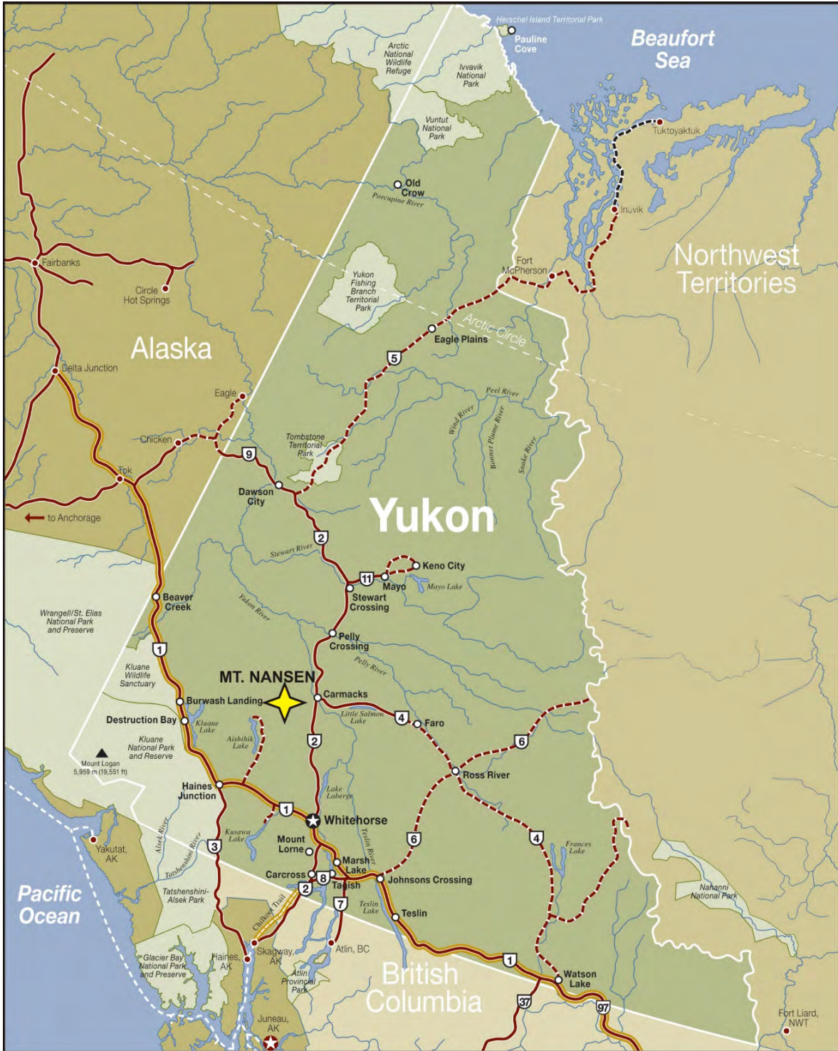
Figure 1.2-1 Mount Nansen Location Map