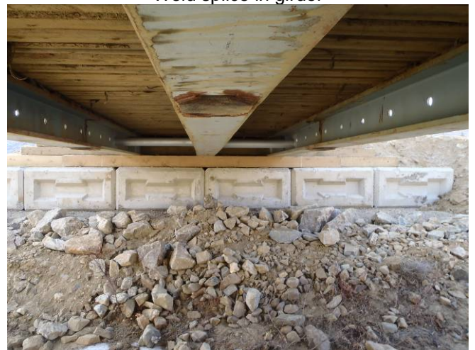
Underside of bridge