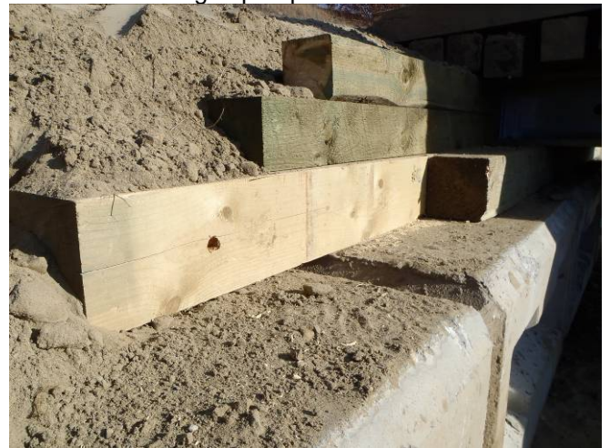
Timber ballast wall – loose and non-treated end-timber blocks