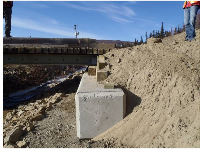
Loose soil in the embankment sides