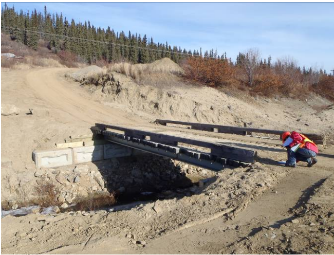
Mount Nansen Bridge - Overview