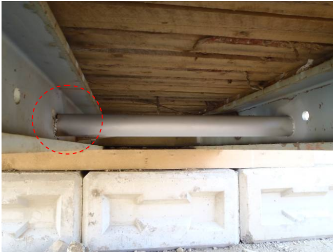
Steel pipe diaphragm – welding in bad condition