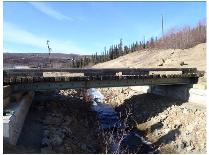
Mount Nansen Bridge - Elevation