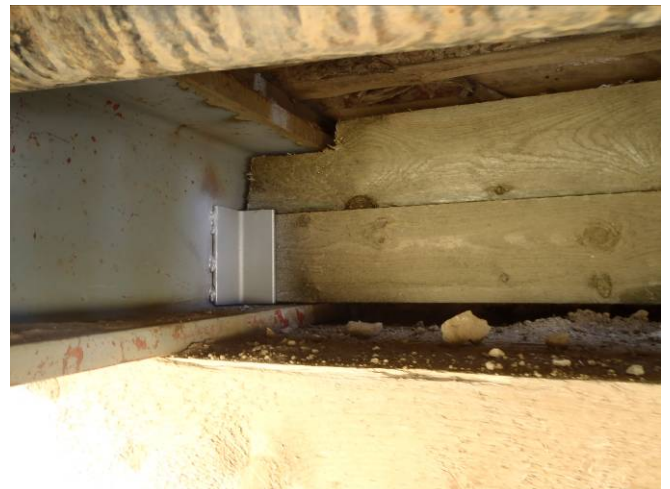
Steel girder to inner ballast wall connection