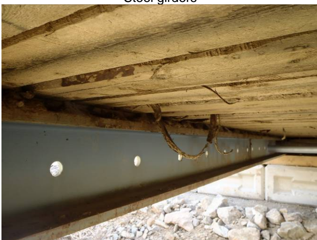
Deteriorated timber plank between top of steel girder and deck