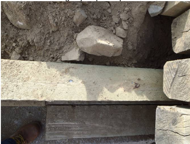
Fixed timber ballast wall