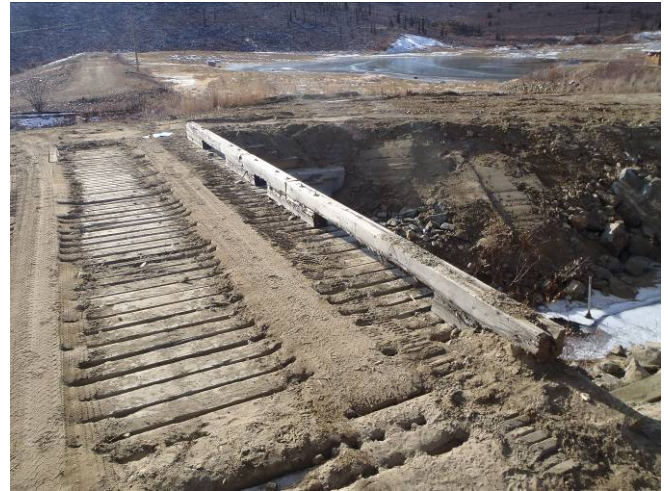
Damaged parapet - Downstream