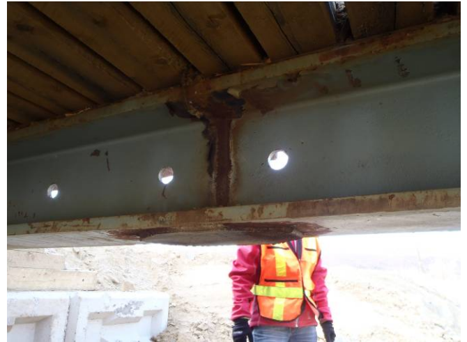
Weld splice in girder