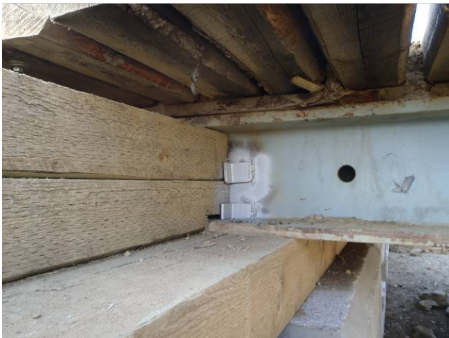
Steel girder to outer ballast wall connection