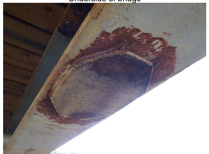
Poor quality previous weld repair