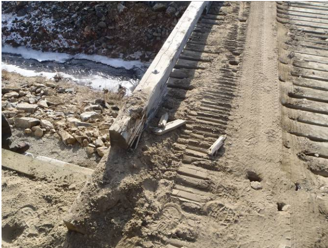
Damaged parapet - Upstream