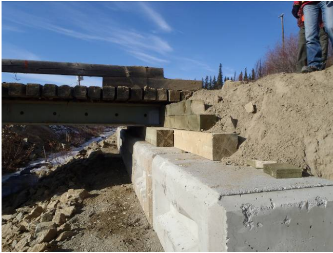
Concrete lock blocks