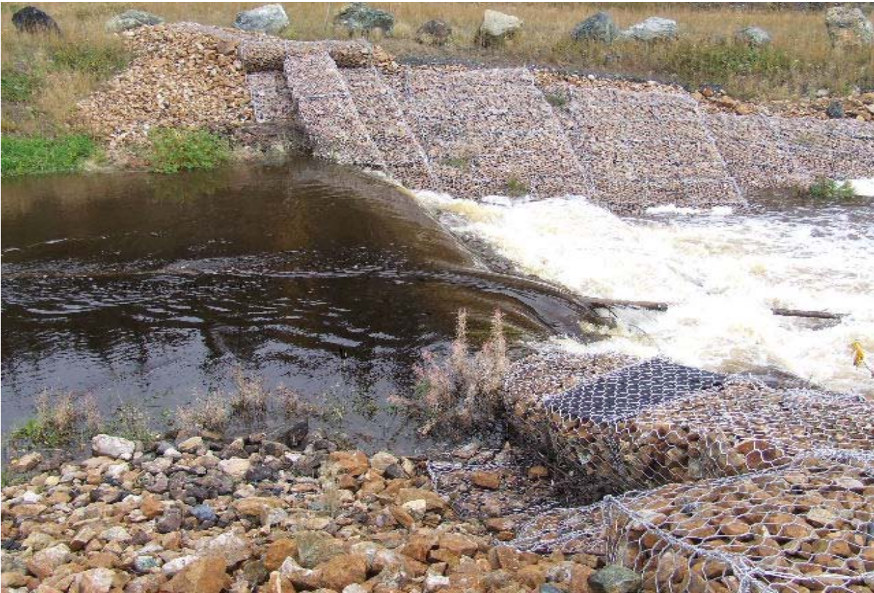
Flow Variance of First Gabion