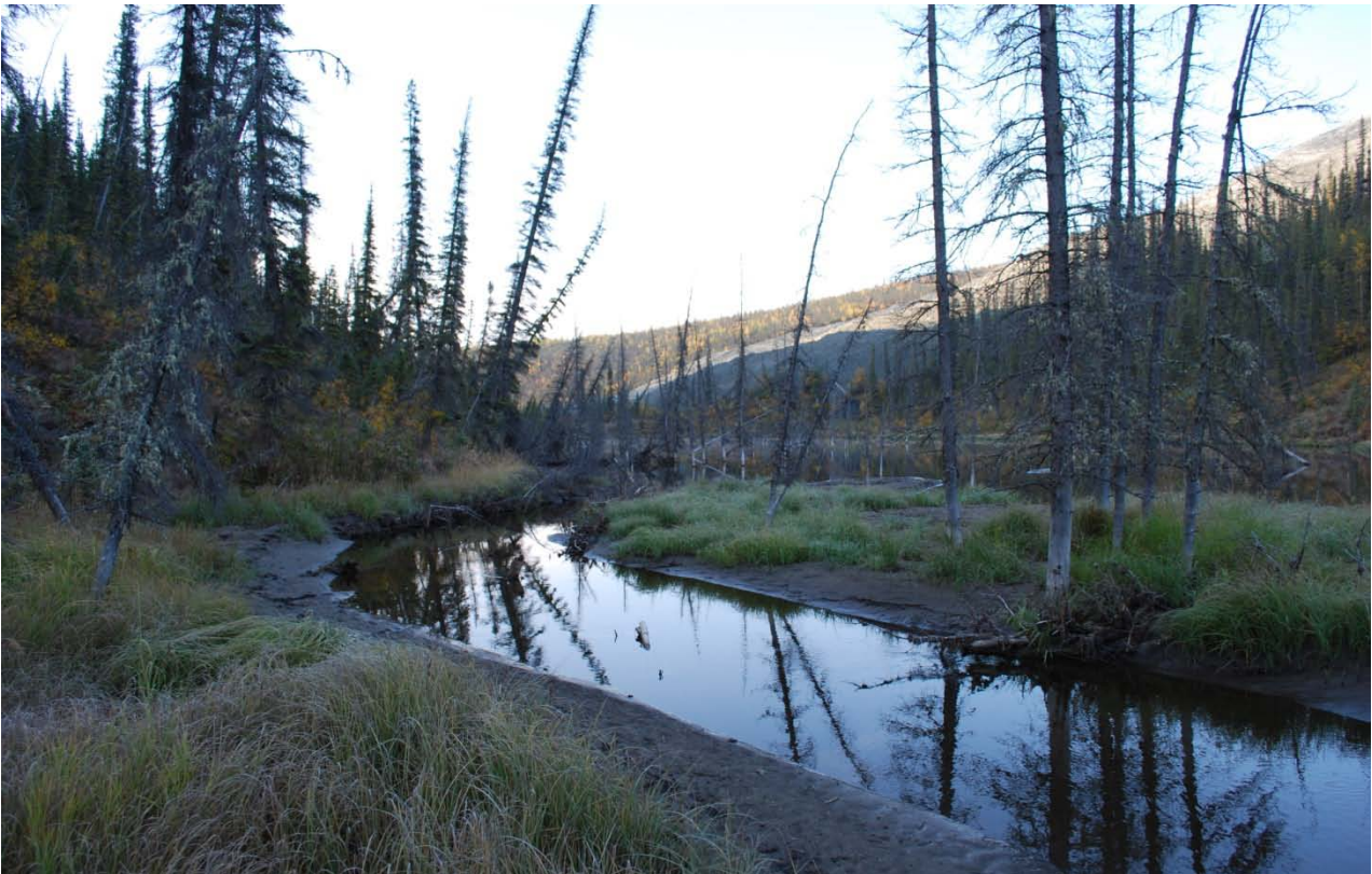
R3 Wolverine Ck u/s of Tailings and Beaver Pond