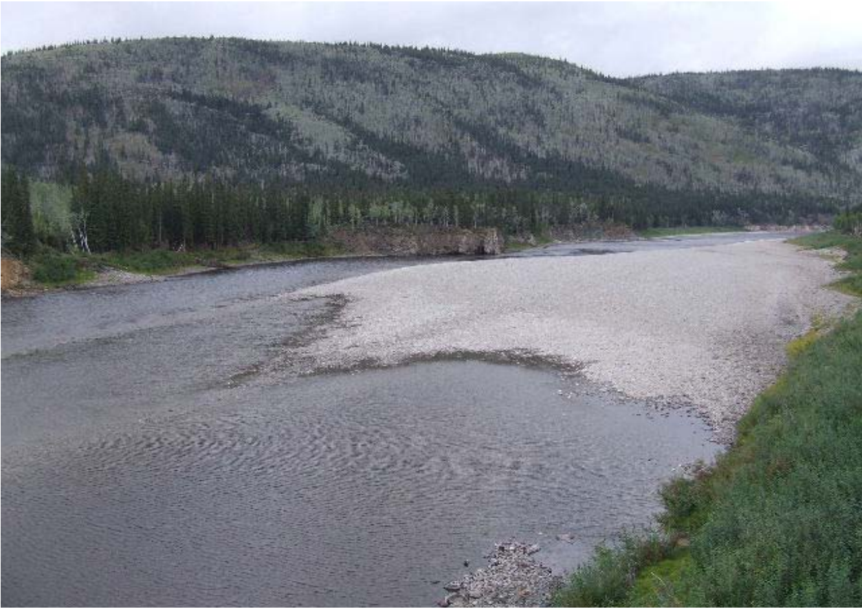
E8 Forty Mile d/s Clinton Ck