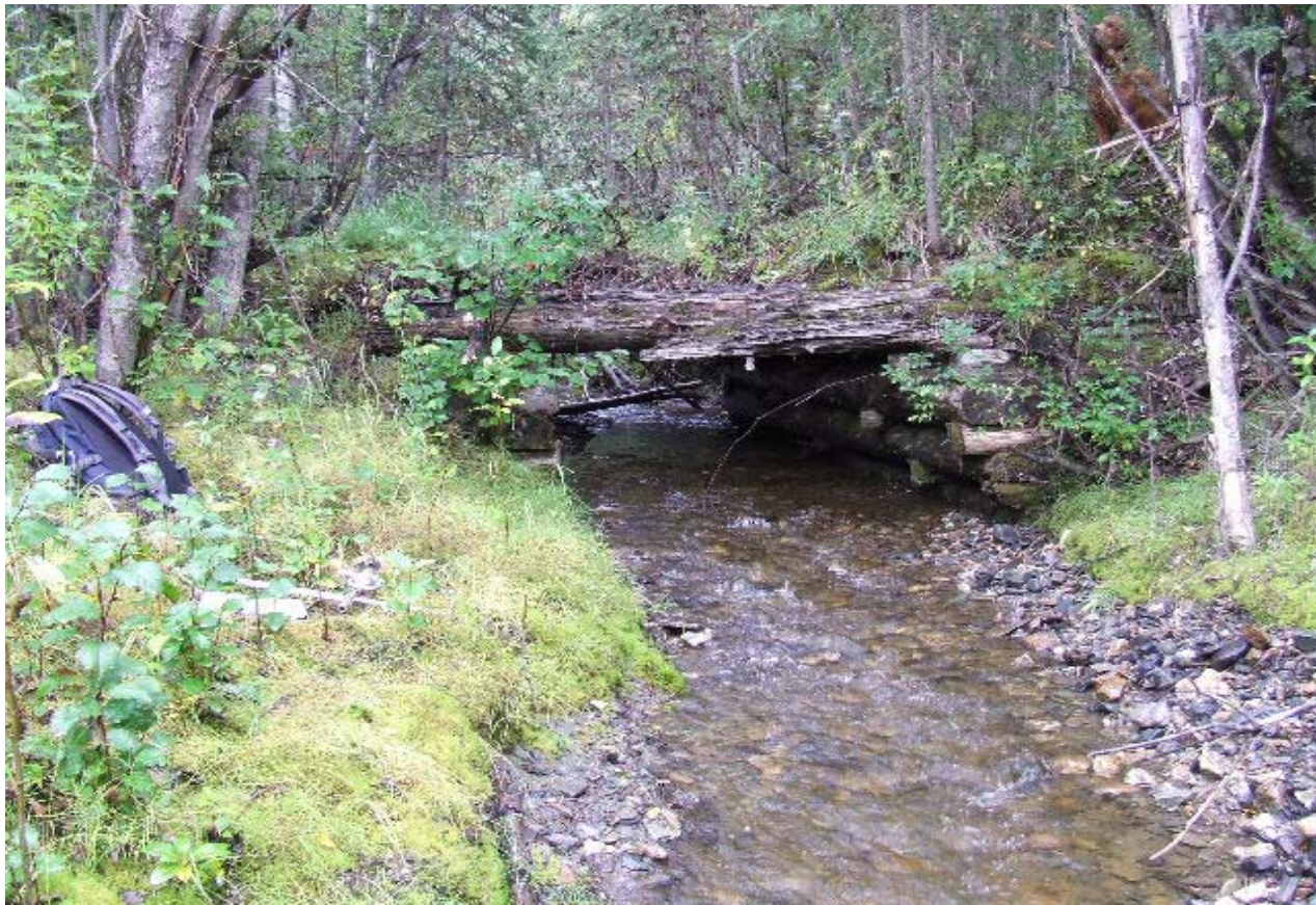
R4 Eagle Ck u/s of Culvert