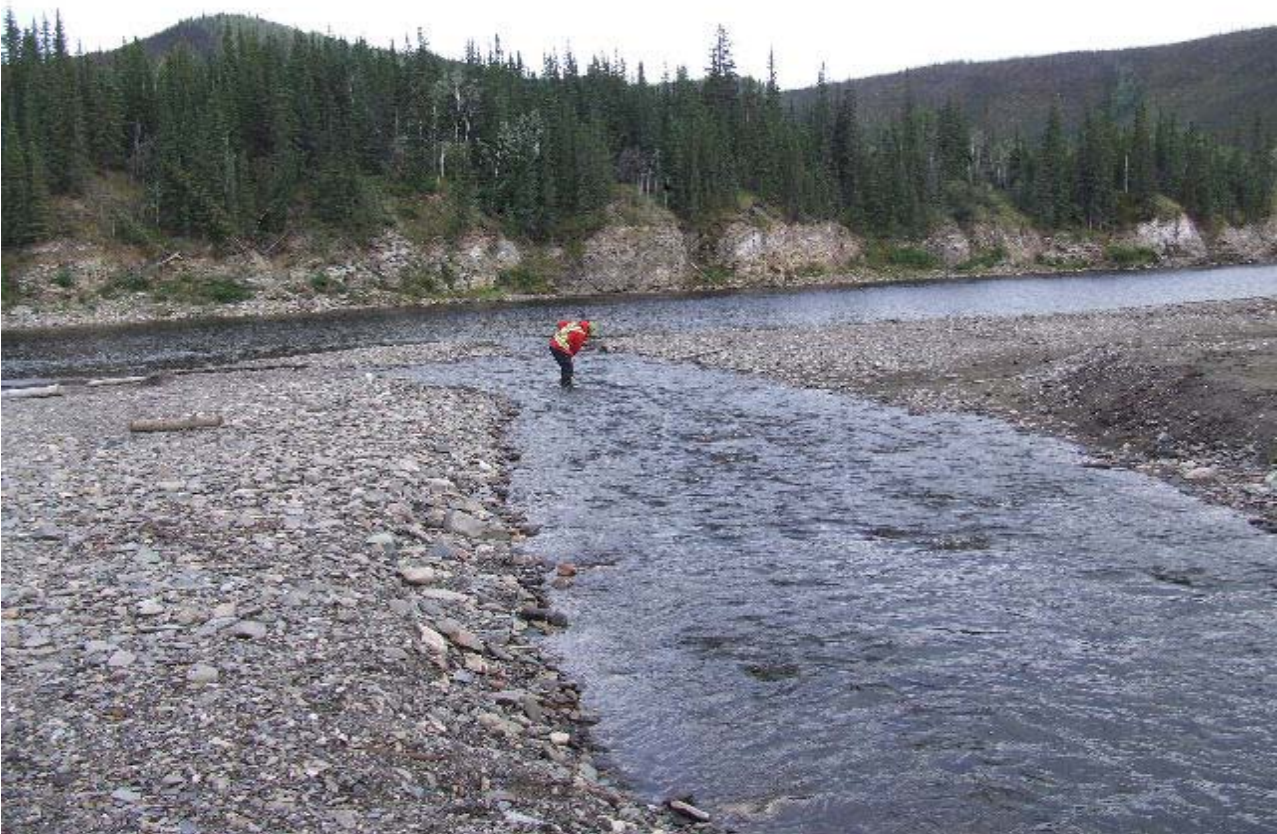
E7 Clinton Ck near Mouth