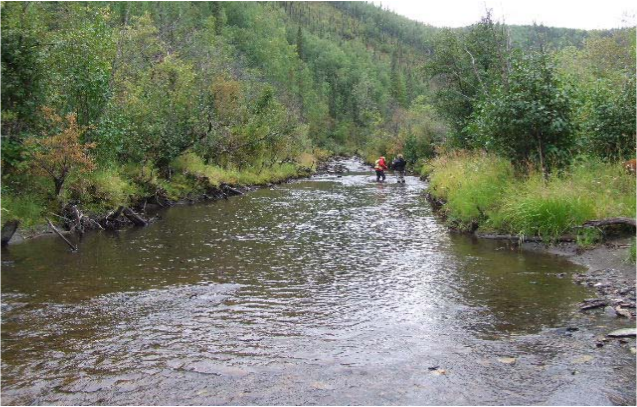
E4 Clinton Ck d/s Wolverine Ck u/s Eagle Ck