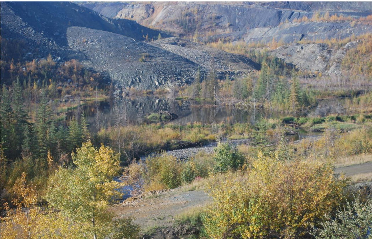
E2 Clinton Ck d/s of Porcupine Ck u/s of Wolverine Ck