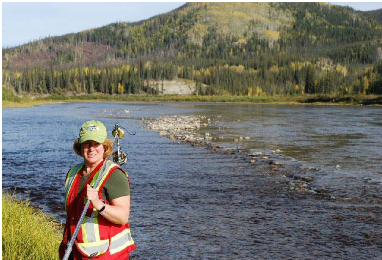
R6 Forty Mile River u/s Clinton Ck