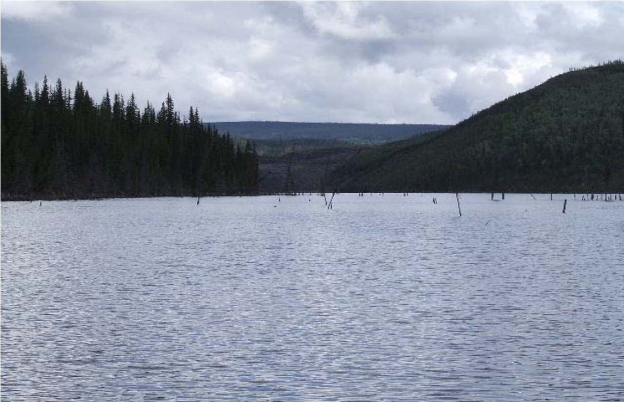
R1 Clinton Ck u/s Hudgeon Lake