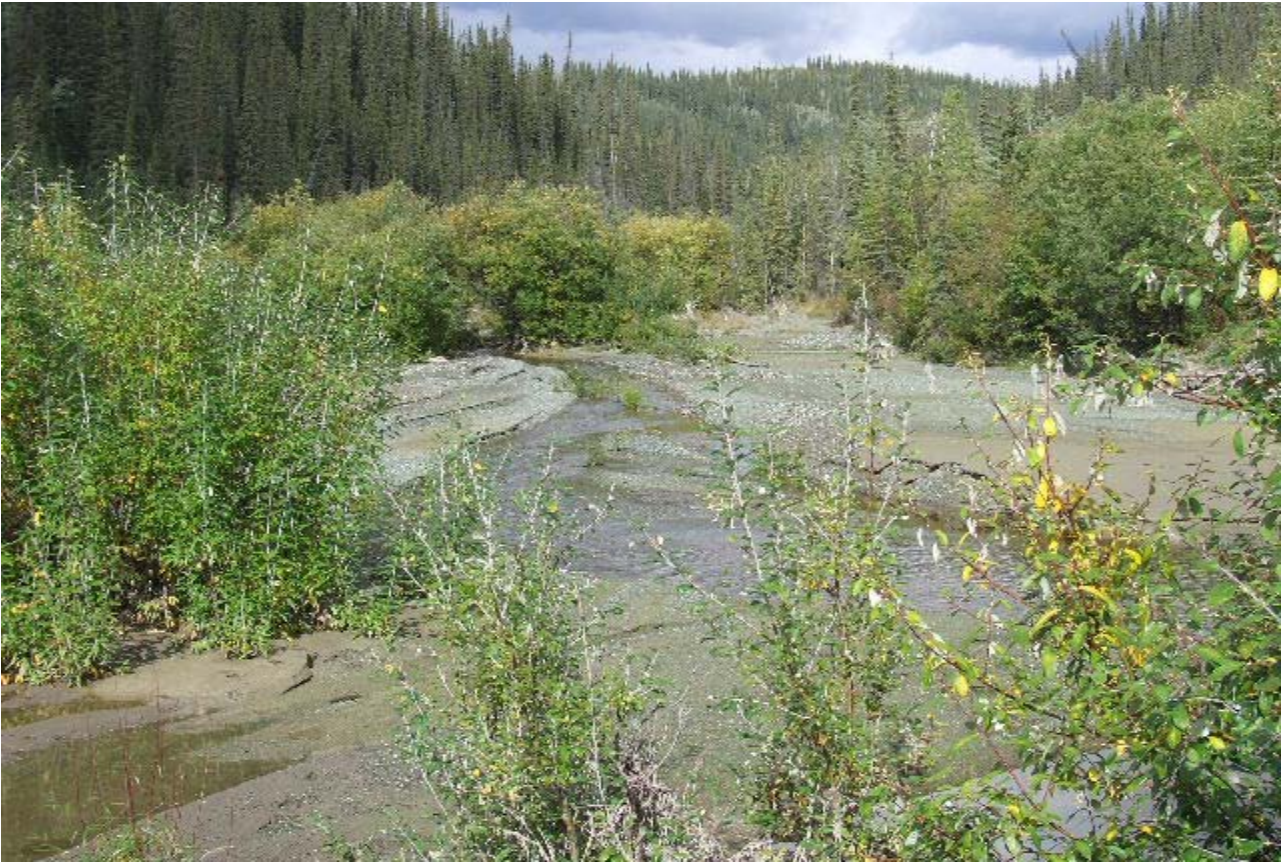
E3 Wolverine u/s Culvert d/s Tailings