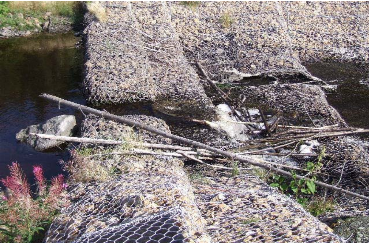
Flow Variance of First Gabion