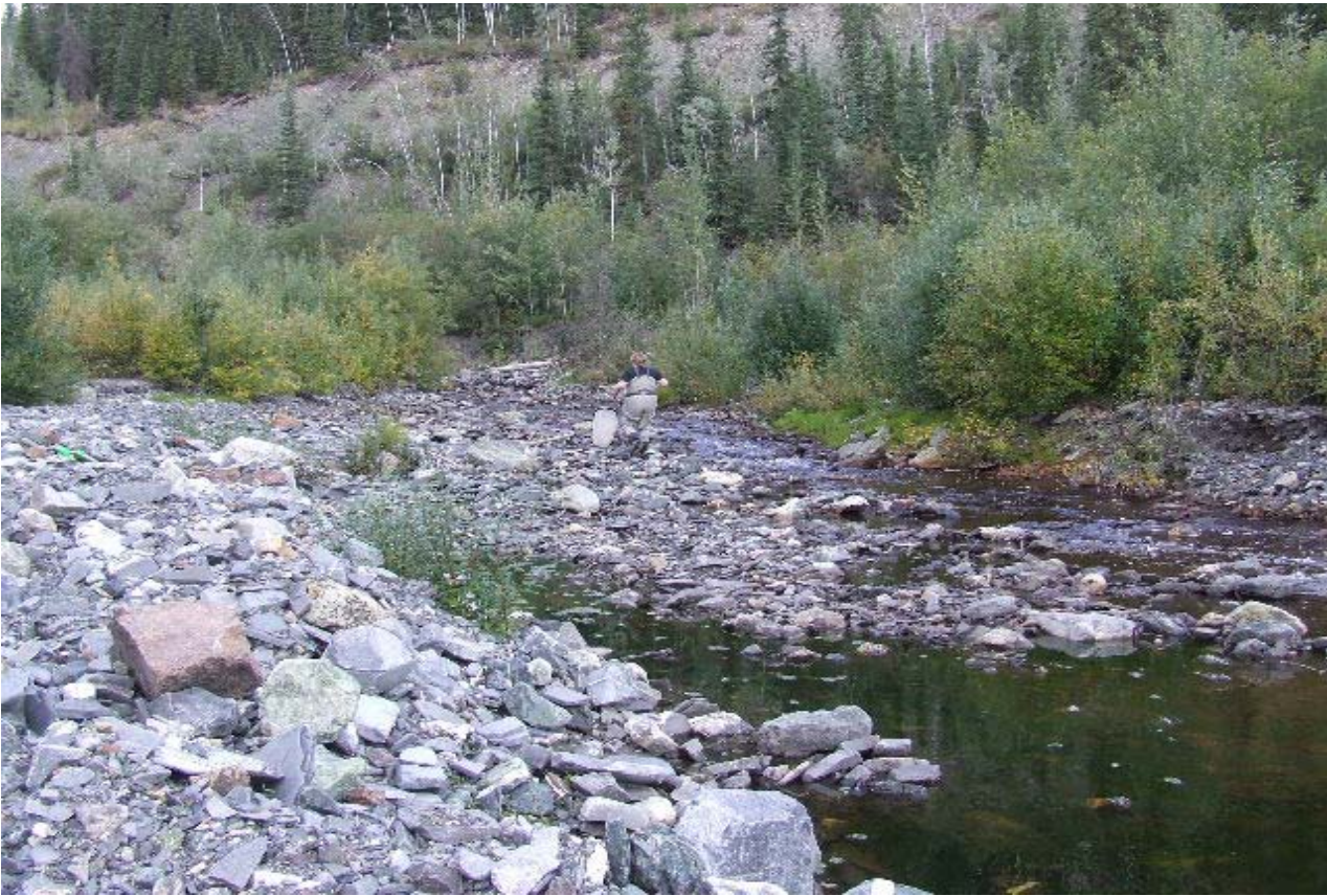
E1 Clinton Ck d/s of Gabions u/s Porcupine Ck