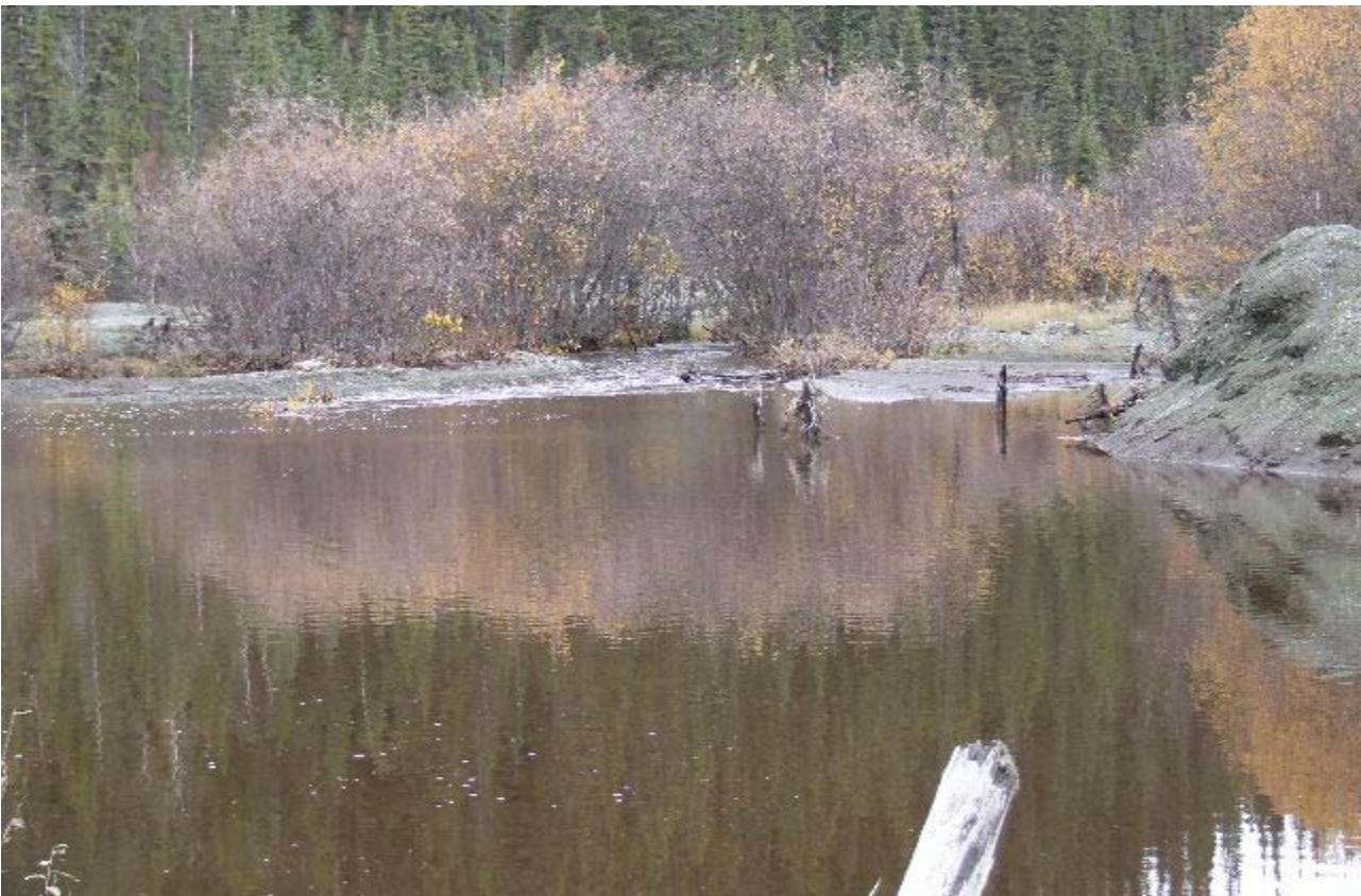
E3 Wolverine u/s Culvert d/s Tailings