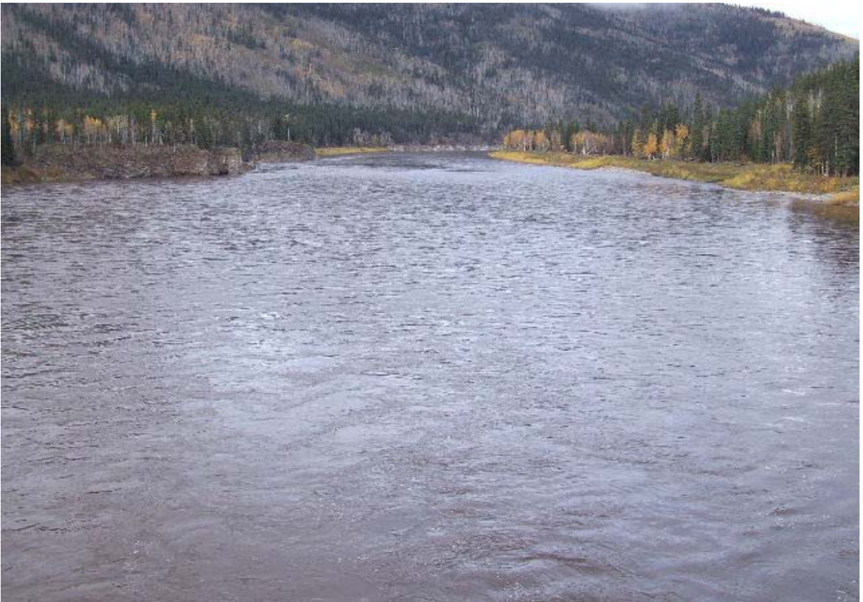
E8 Forty Mile d/s Clinton Ck