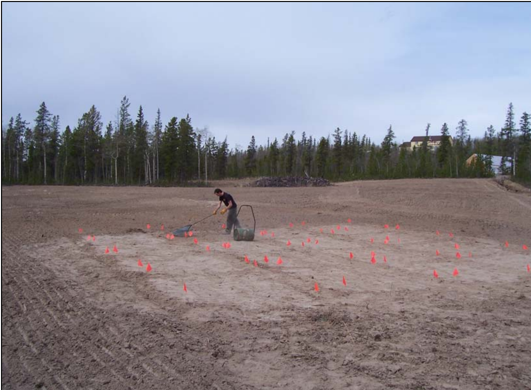
Photo 1: Example of a 4m x 4m plot layout staked out and rolled (2006)