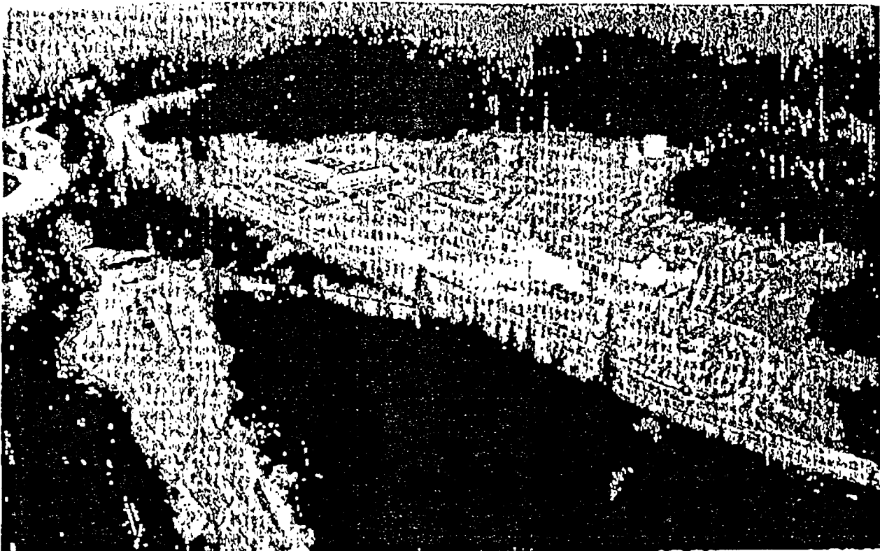
Border Pump Station, 32 acres in area, is located on the Haines Cut-Off Highway 47 miles north of the Haines Terminal.

d. Diesel fuel oil is provided from the 5,000-barrel station storage tank located on a hill above the pump house. This tank is filled from the pipeline at scheduled intervals.