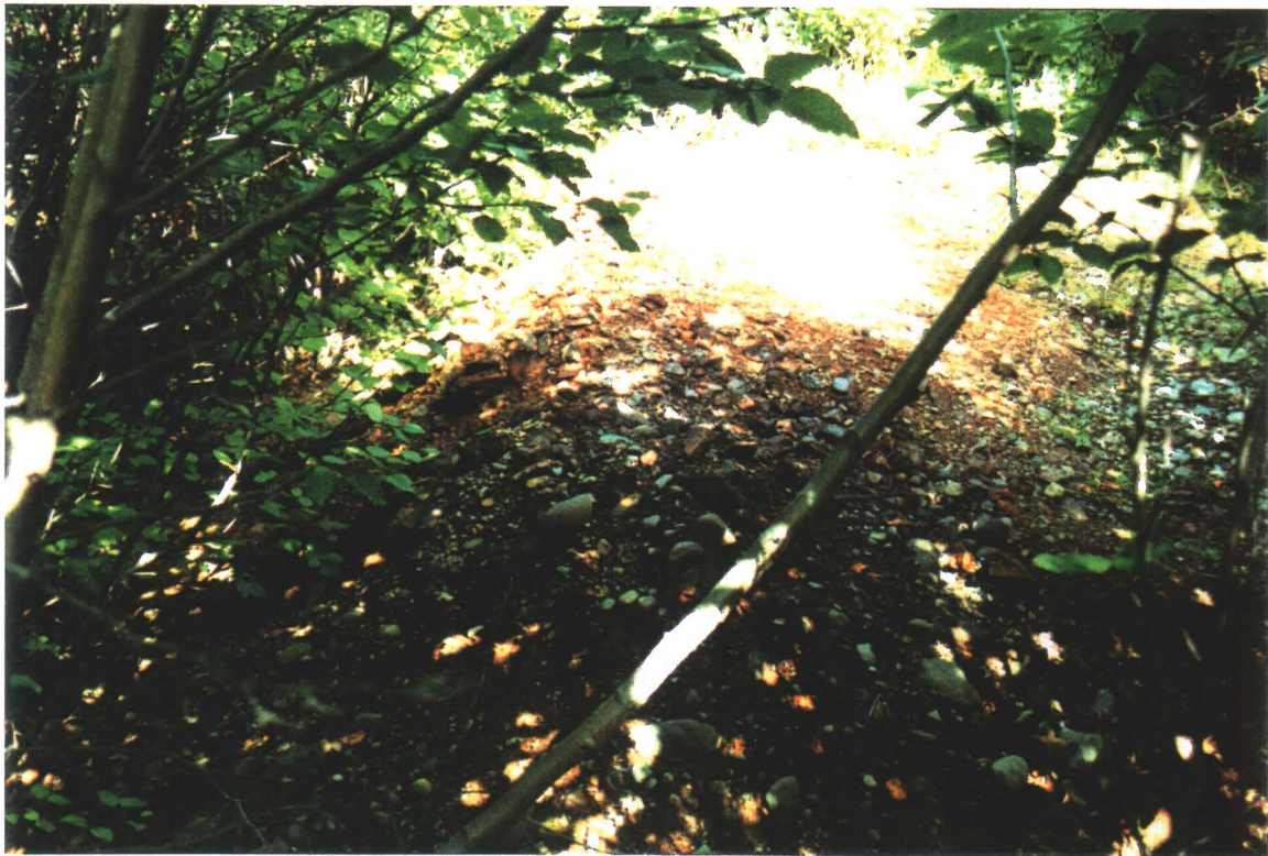
WASTE ROCK PILE