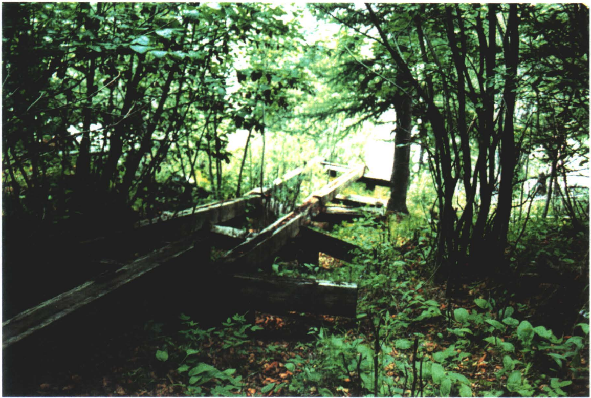
WOODEN TRESTLE TRAMWAY