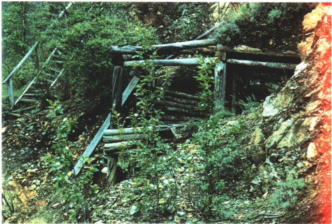
CLOSE-UP OF ADIT