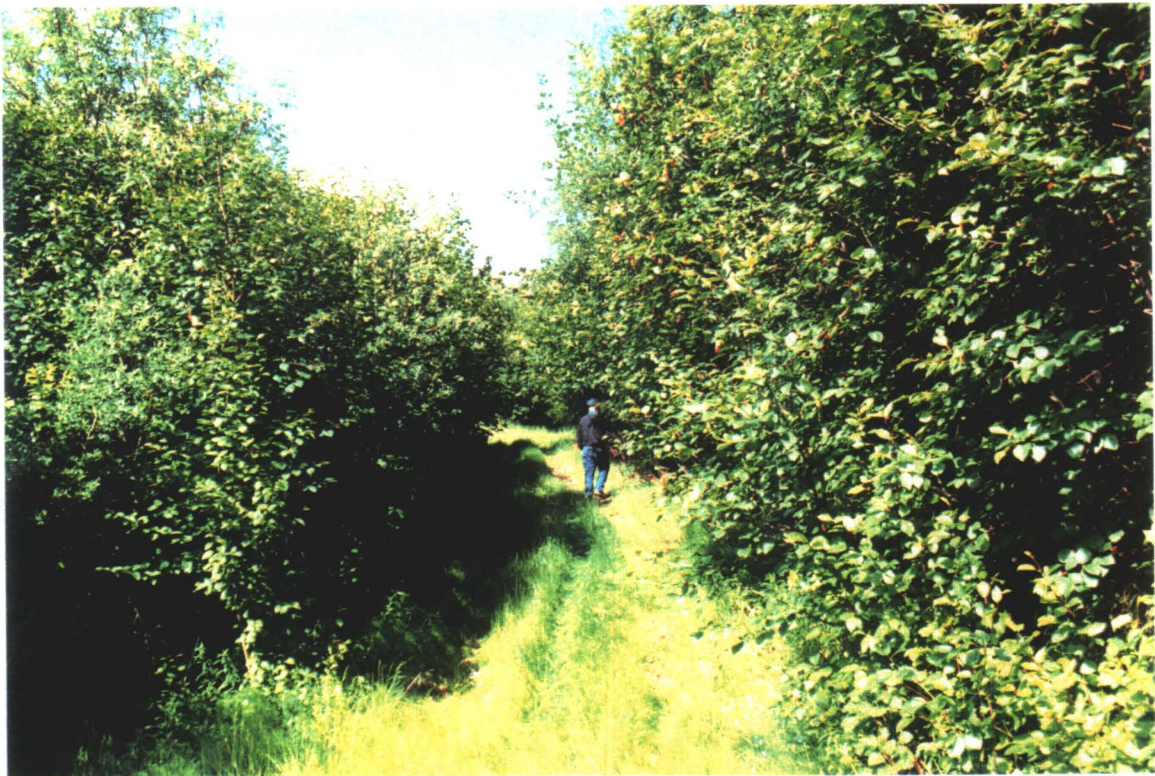
ACCESS TRAIL TO SITE