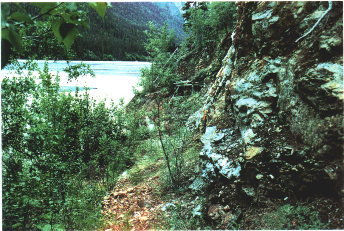
ADIT, STAIRWAY, AND WHITE RIVER