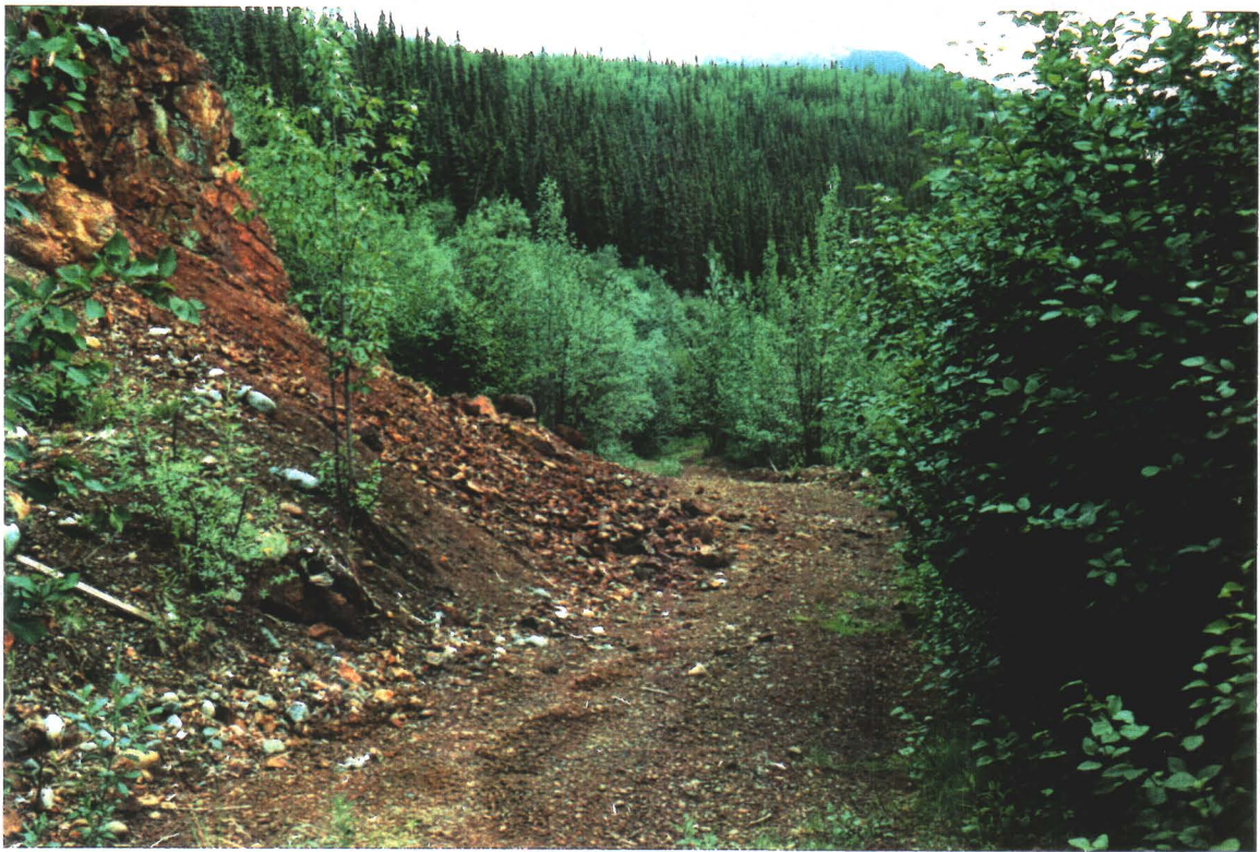
ROCK OUTCROPPINGS ALONG TRAIL