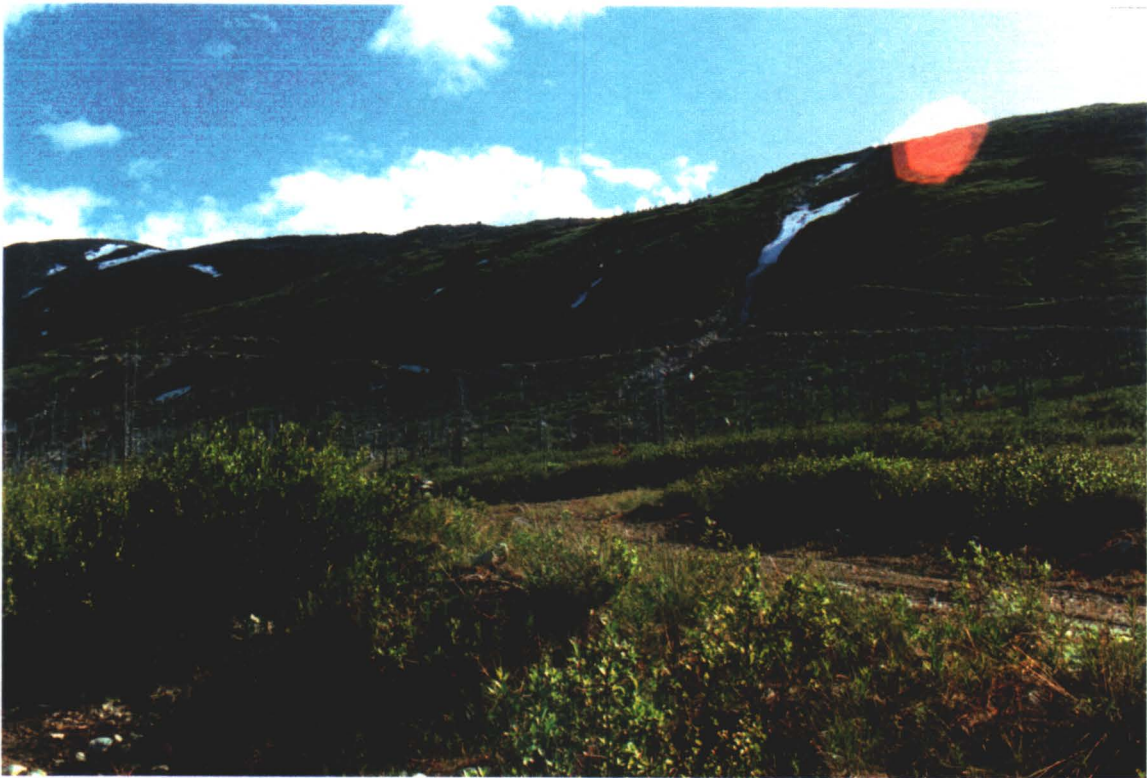
8. EXPLORATION ACCESS ROAD AND SLOPE FAILURES