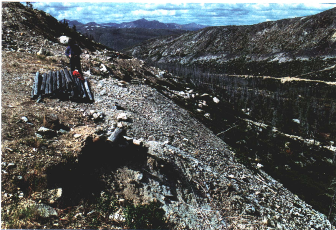
2. WASTE MATERIAL AND LAGGING FROM ADIT