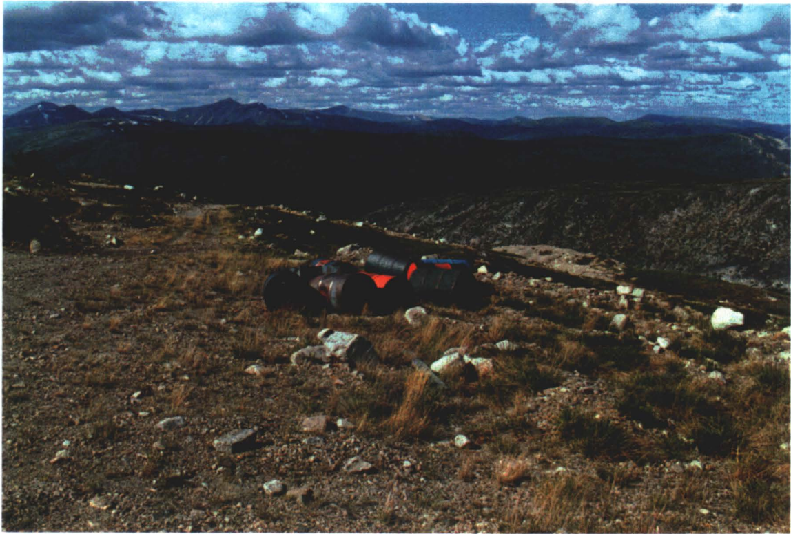
5. EMPTY BARRELS AT EXPLORATION SITE