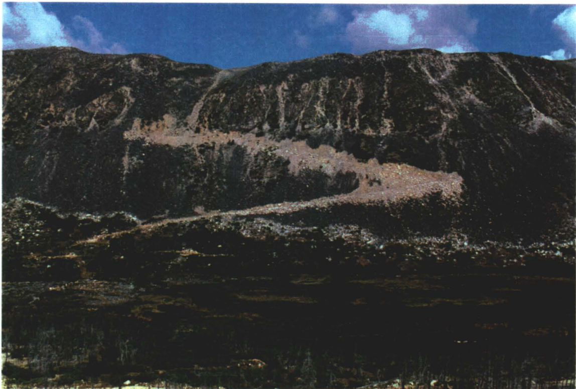
4. EXPLORATION ROAD