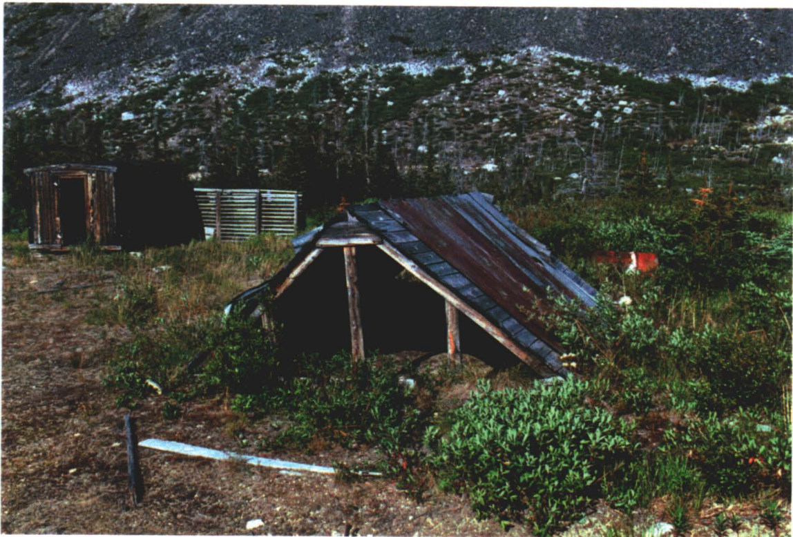
6. A-FRAME, CORE RACK, AND STORAGE BUILDING AT CAMP LOCATION