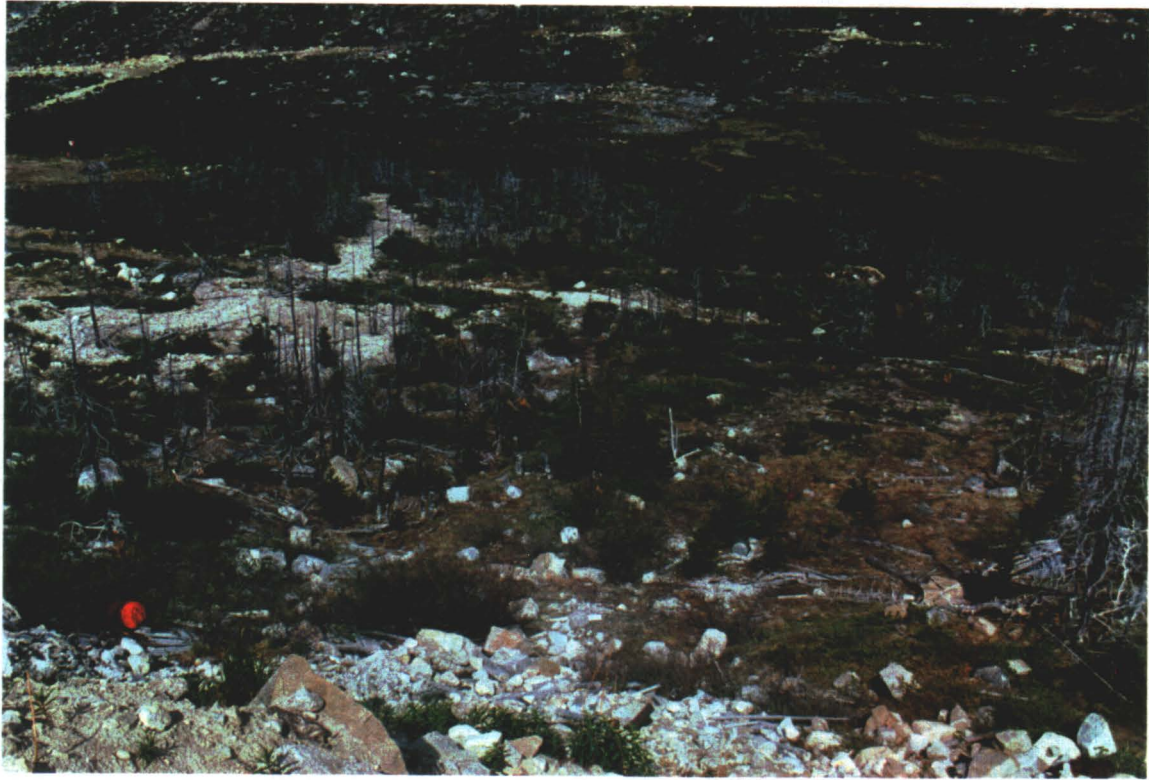
3. WASTE MATERIAL DOWNSLOPE OF ADIT