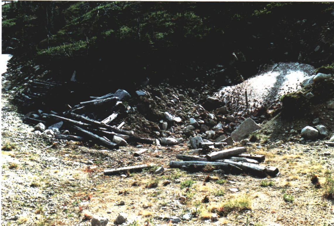
1. ADIT LOCATION