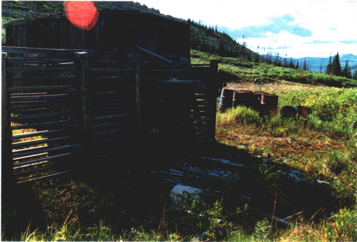
7. CORE RACK, SPILLED CORE, AND BARRELS AT CAMP LOCATION