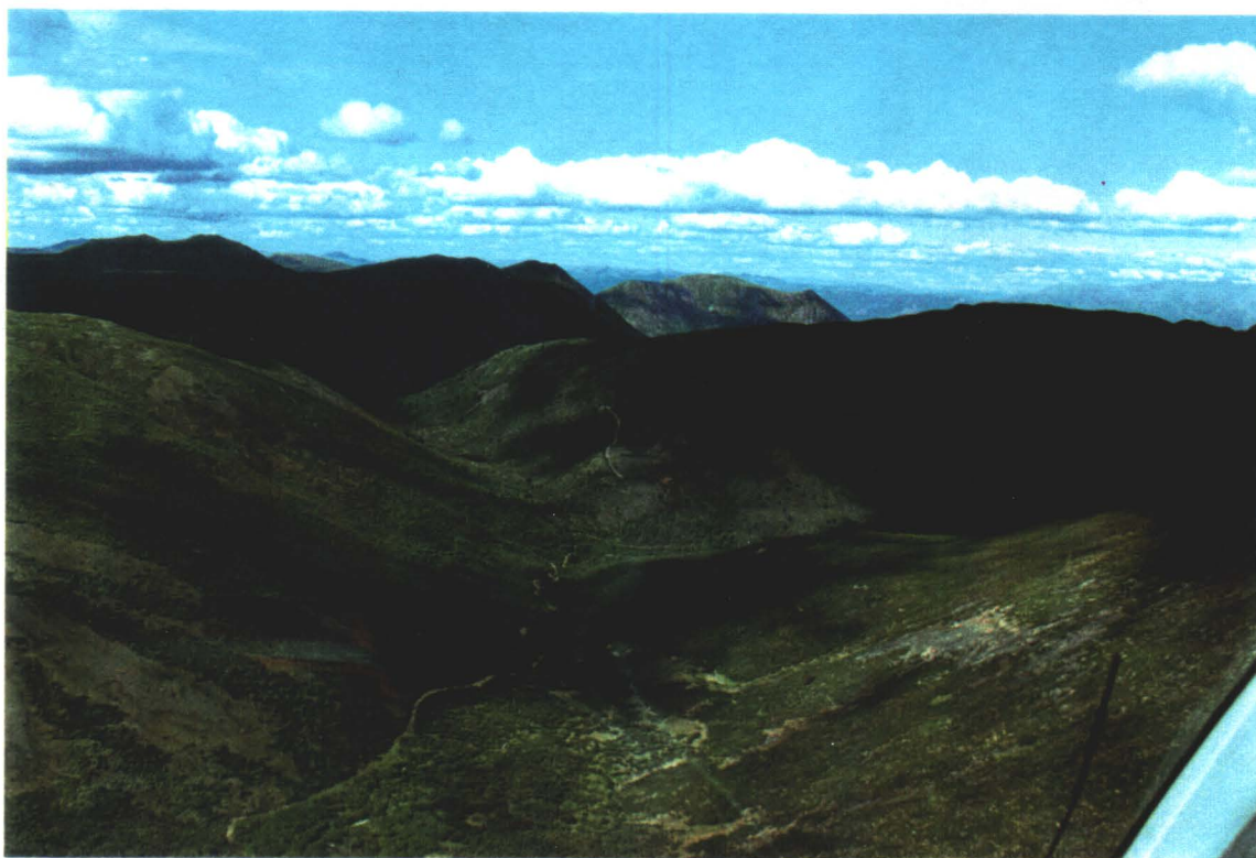
ROAD ACCESS TO SITE UP MORRISON CREEK