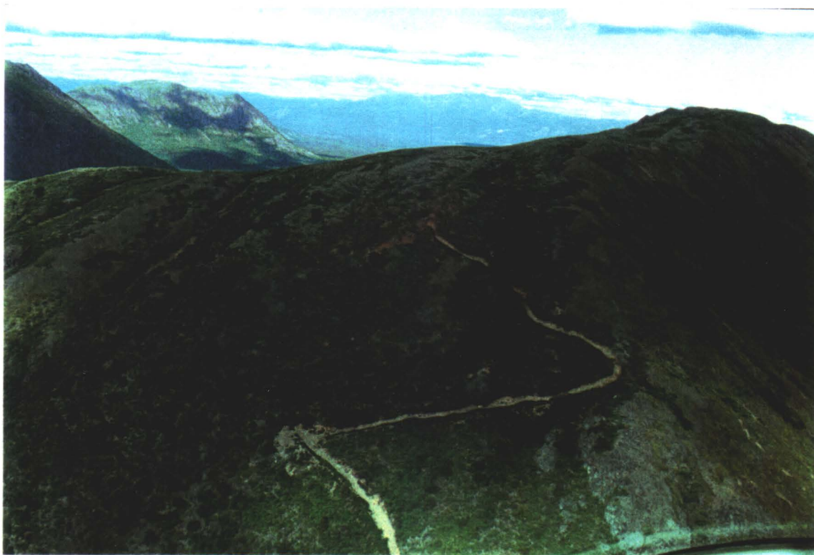
STEEP SWITCHBACK TRAILS TO SITE ON MULE HILL