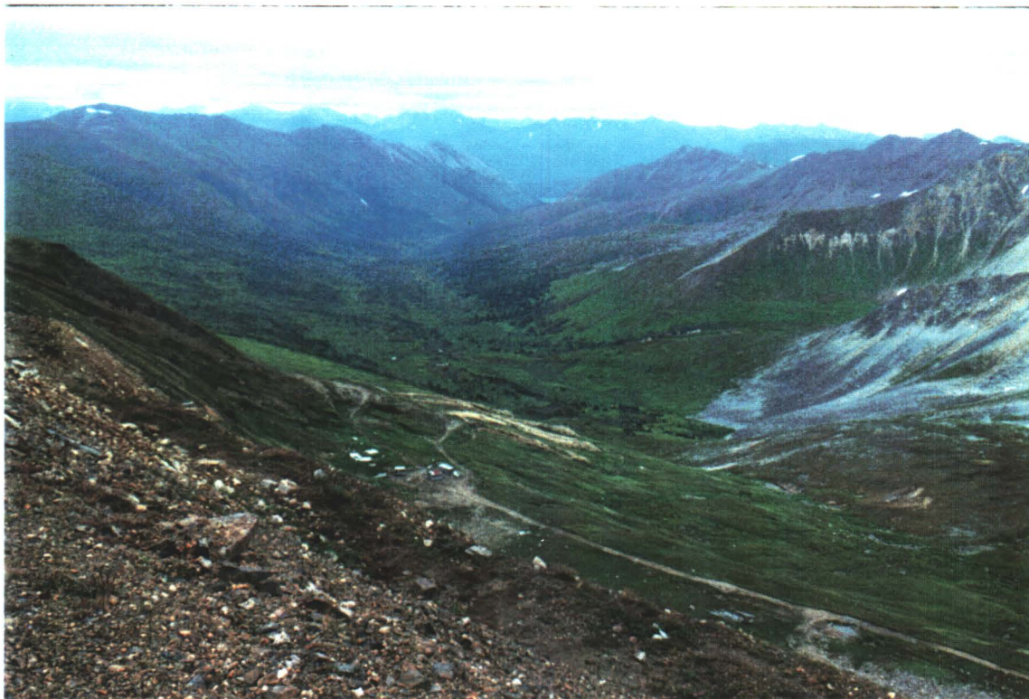
CAMP SITE FROM ADIT LOCATION