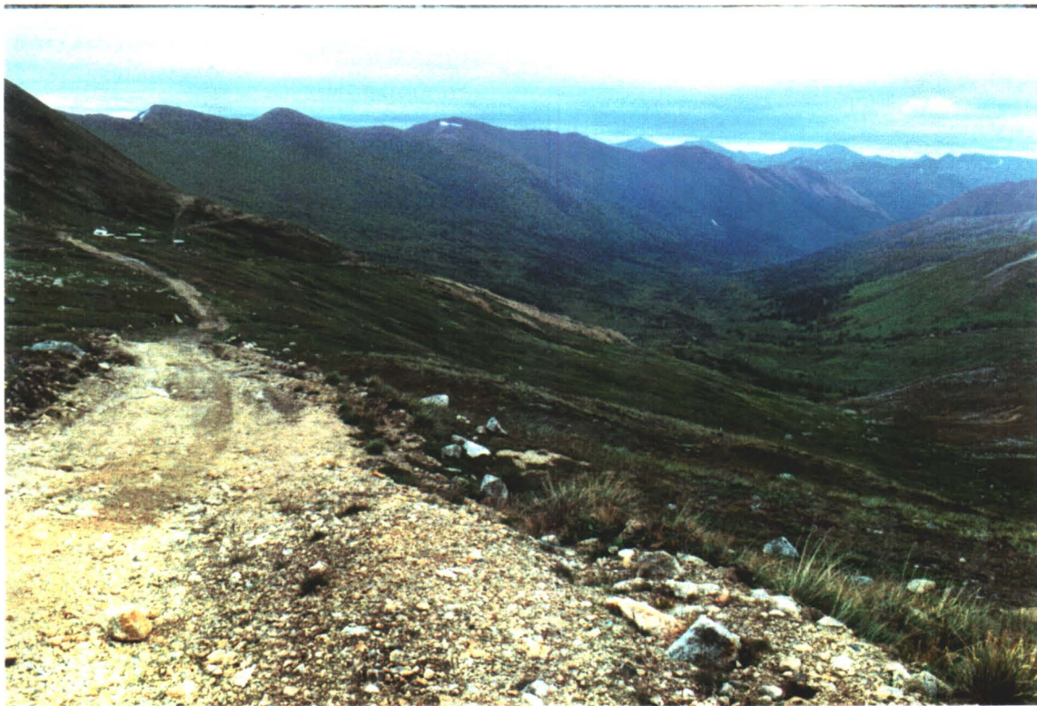
ACCESS ROAD NEAR EXPLORATION SITE