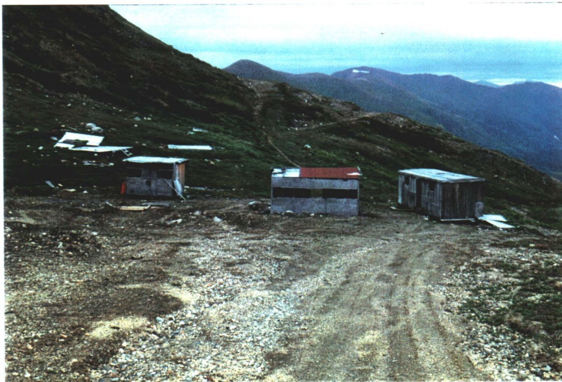
BUILDINGS AT CAMP SITE