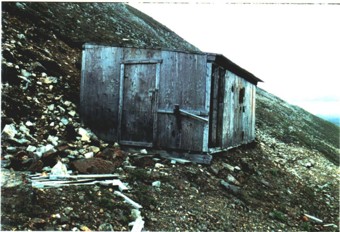
STORAGE BUILDING NEAR ADIT