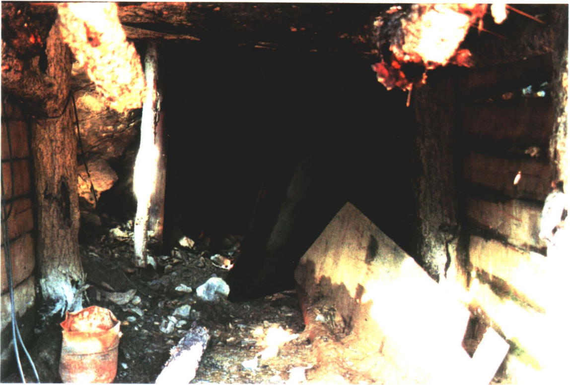
INTERIOR OF UPPER ADIT