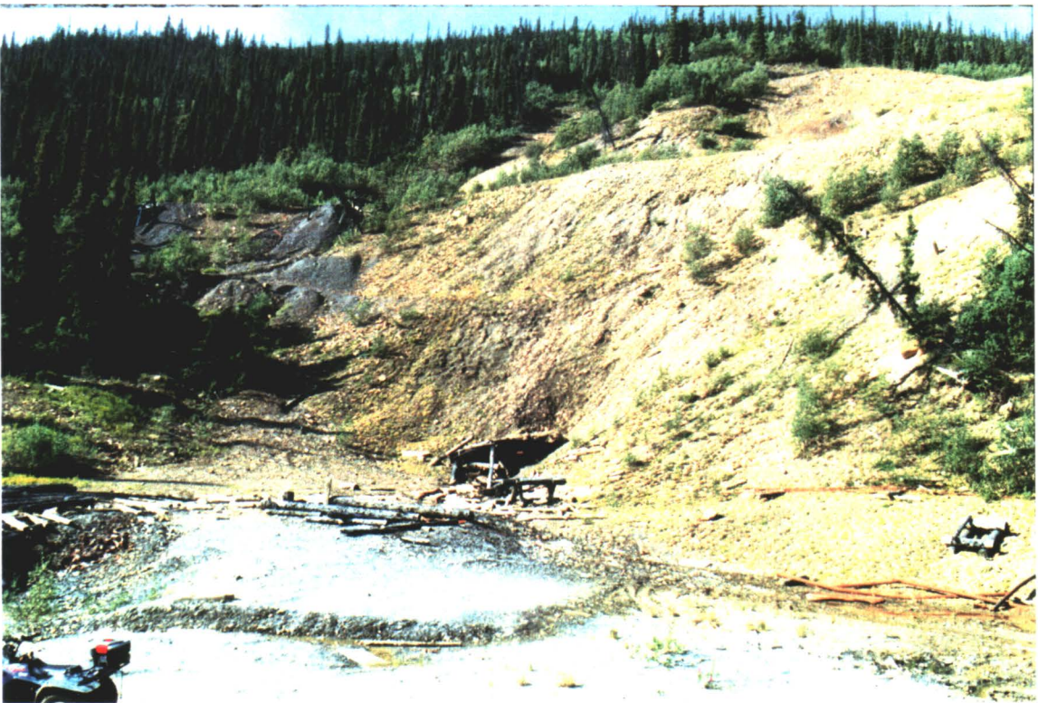
LOWER ADIT AND SLOPE TO UPPER ADIT