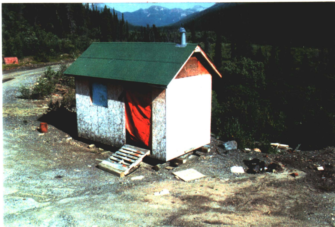
SMALL STORAGE BUILDING