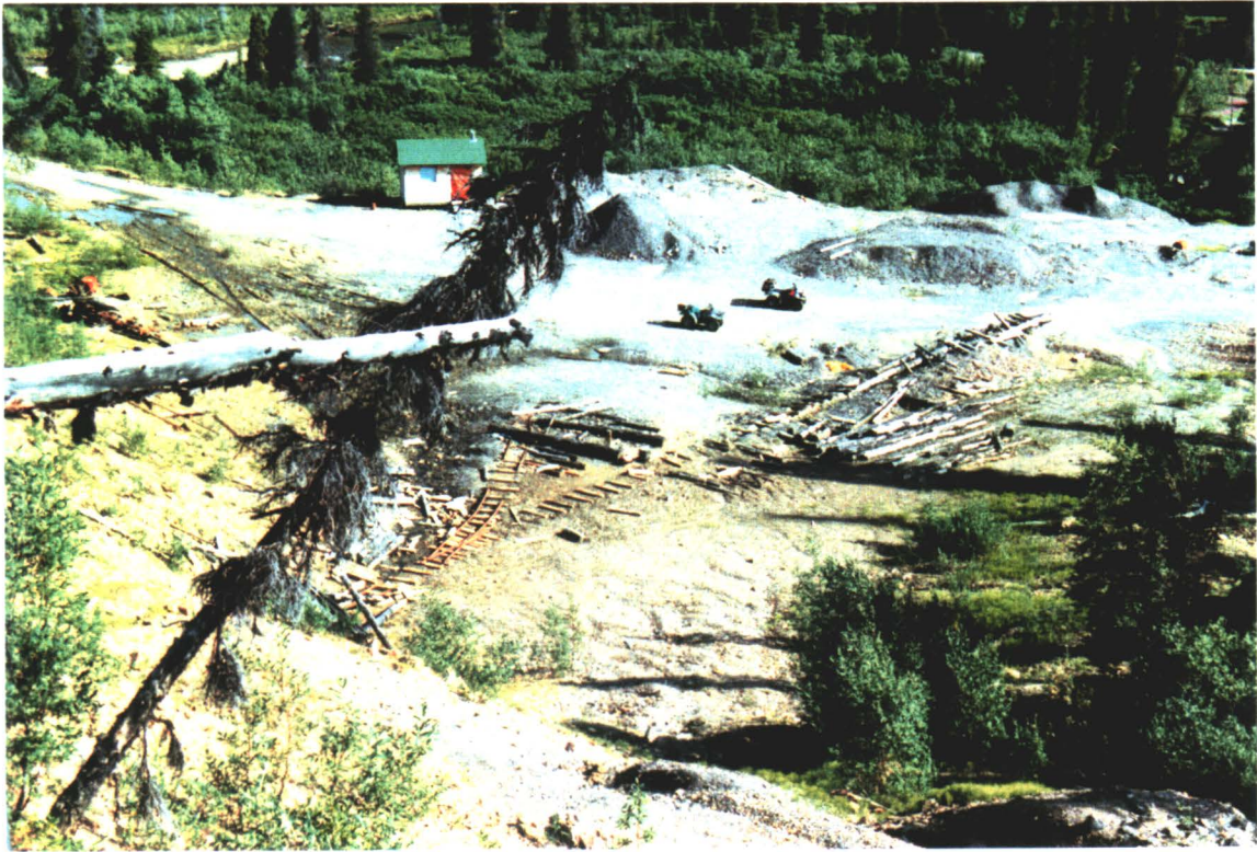
EXPLORATION SITE STAGING AREA