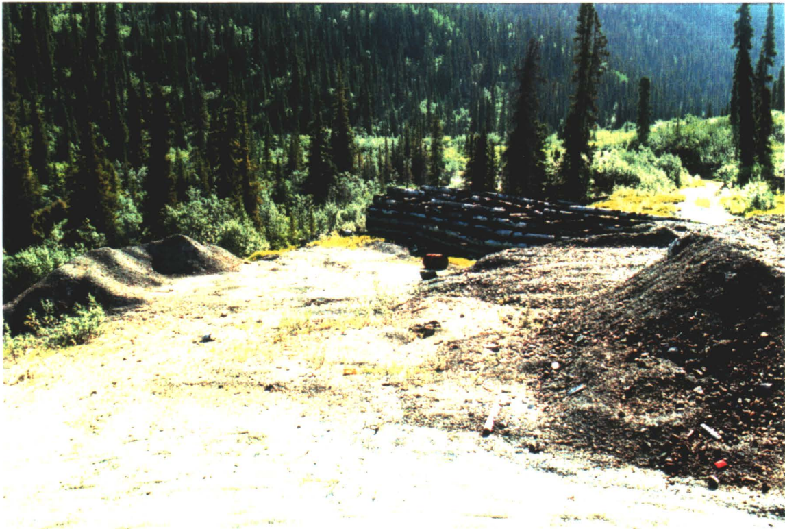
LOG STRUCTURE AND STOCKPILE AREA