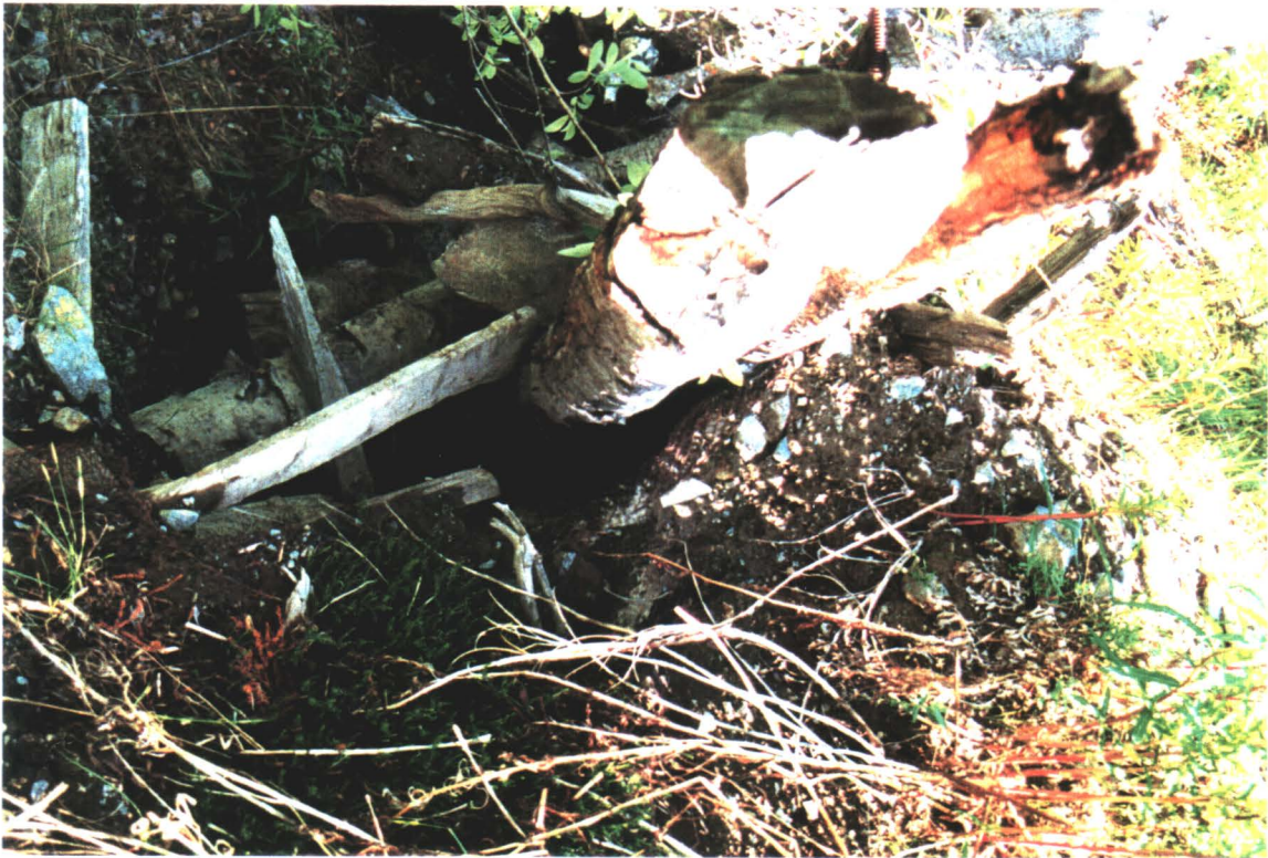
ENTRANCE TO LOWER ADIT