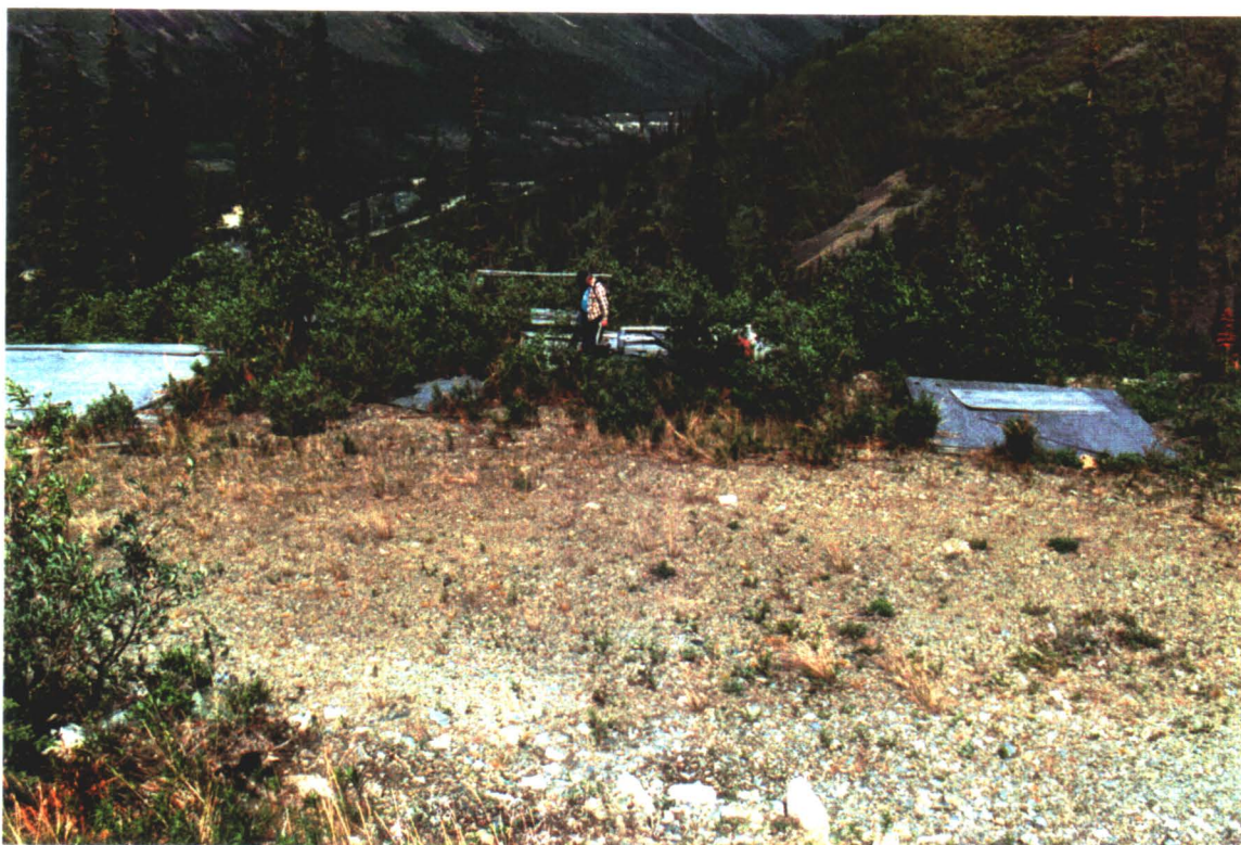
TENT FRAME FLOORS