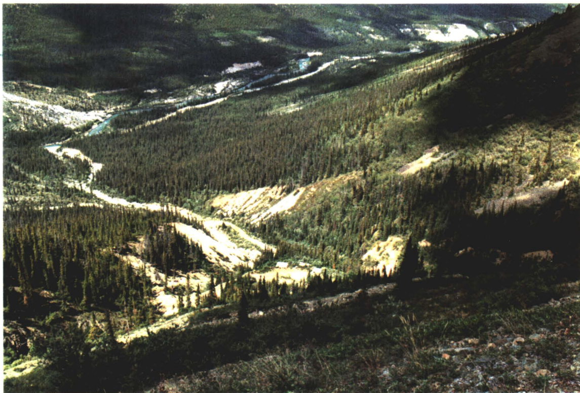
TALLY-HO CREEK AND EXPLORATION CAMP SITE (MIDDLE OF PHOTO)