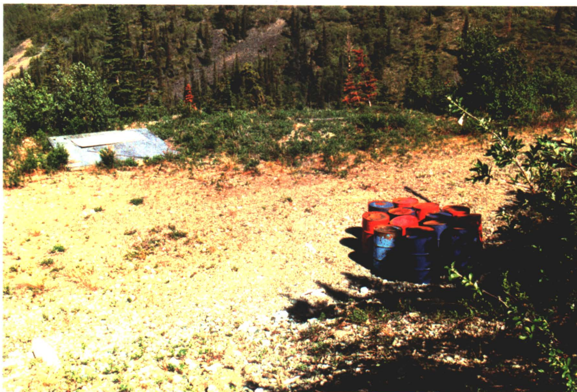
EMPTY FUEL BARRELS AT CAMP SITE