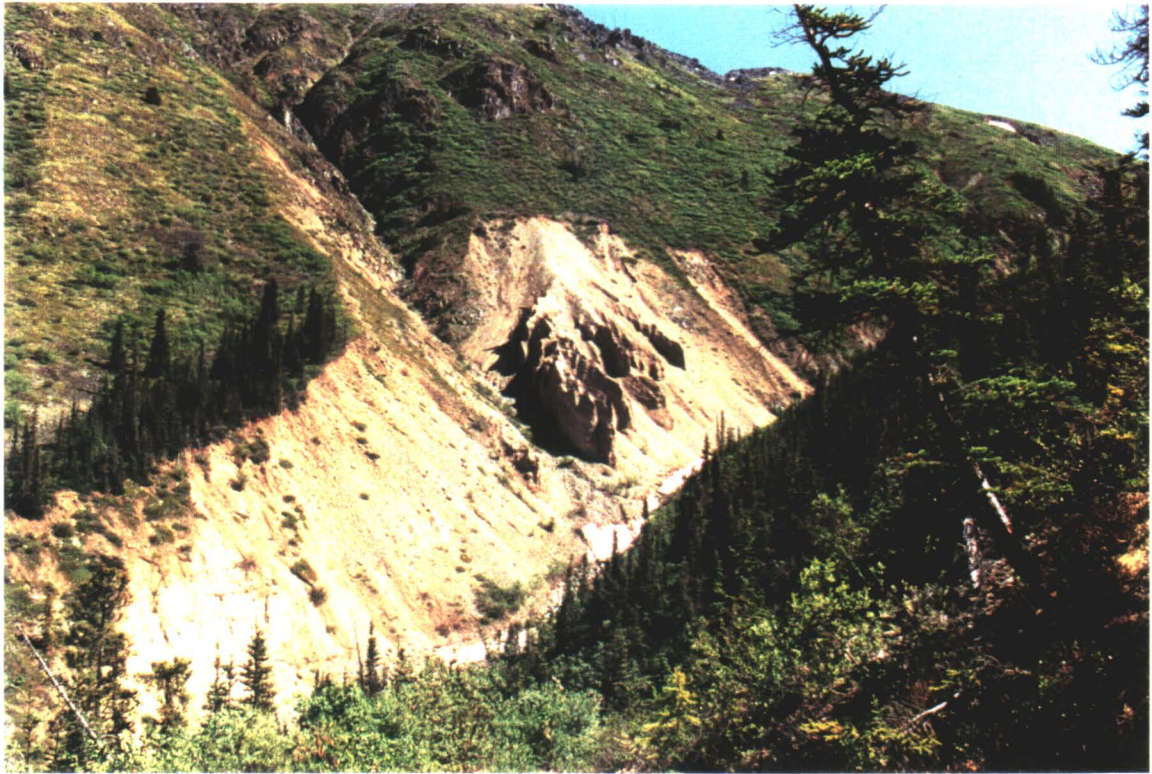
EROSION ON TALLY-HO CREEK