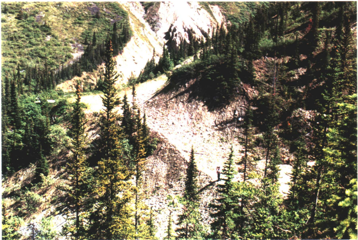
CAMP SITE LOCATION AND AREA NEAR LOWER ADIT