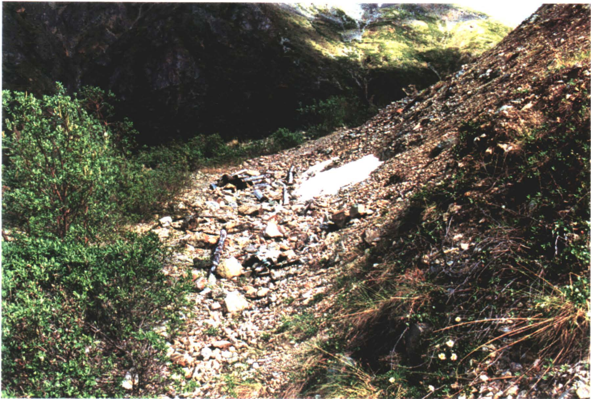
EXPLORATION TRAIL (NOTE REVEGETATION AND NATURAL SLOUGHING)