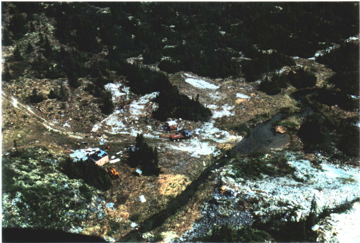
CAMP SITE AND CONGLOMERATE CREEK