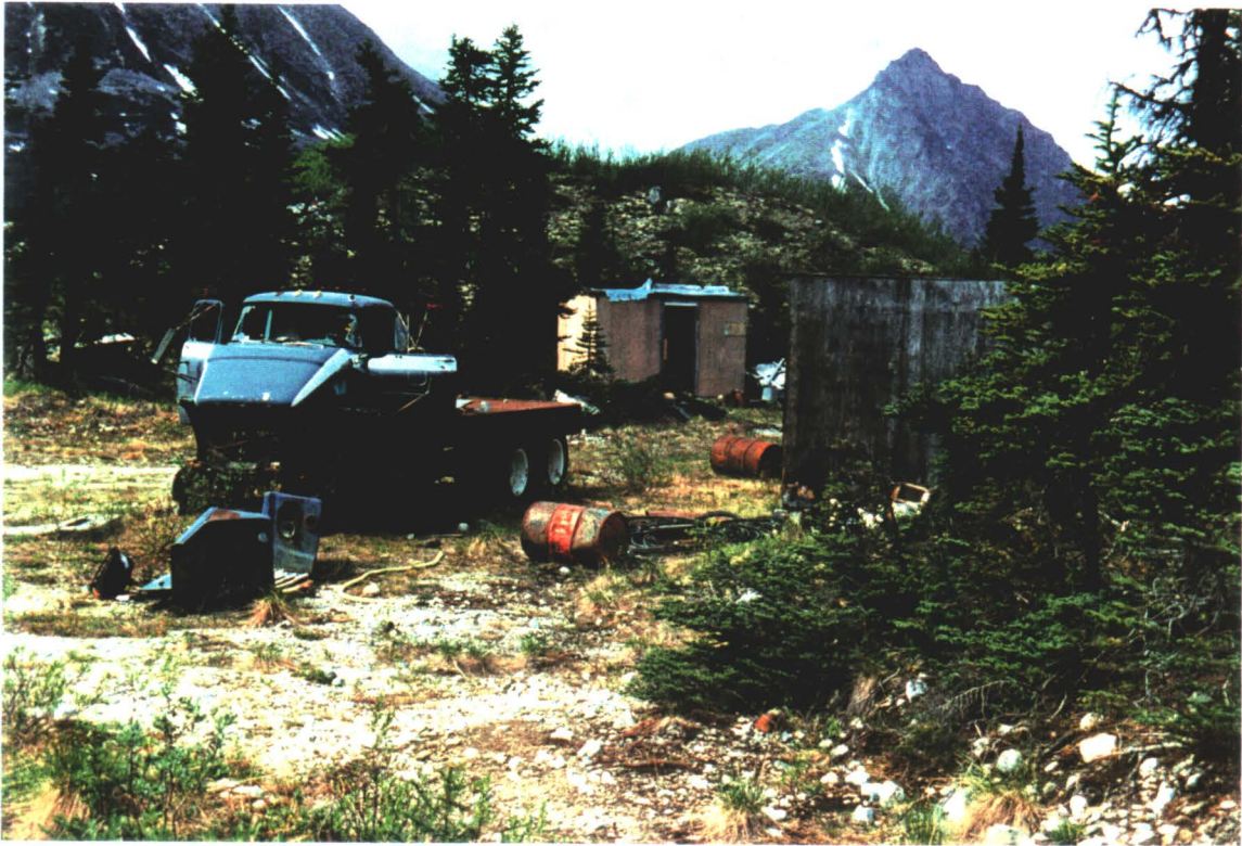
ABANDONED FLAT DECK TRUCK AND MISCELLANEOUS DEBRIS