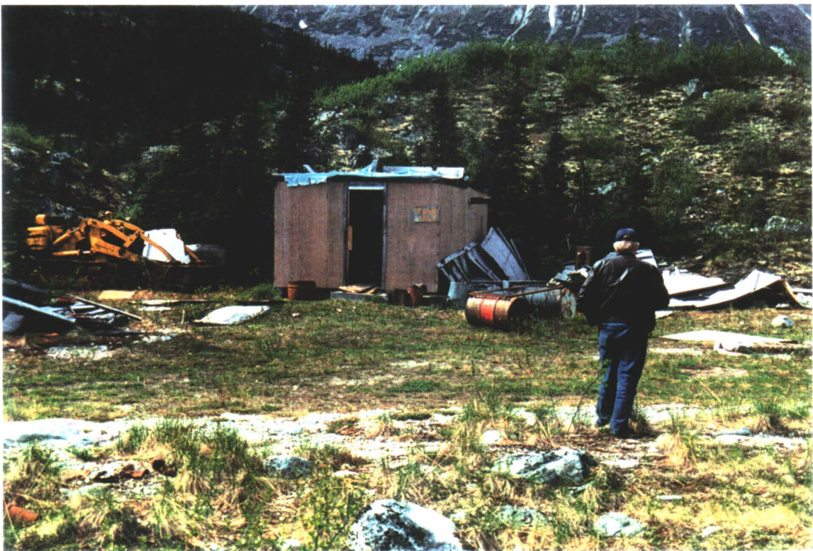
CRAWLER TRACTOR AND CAMP BUILDING