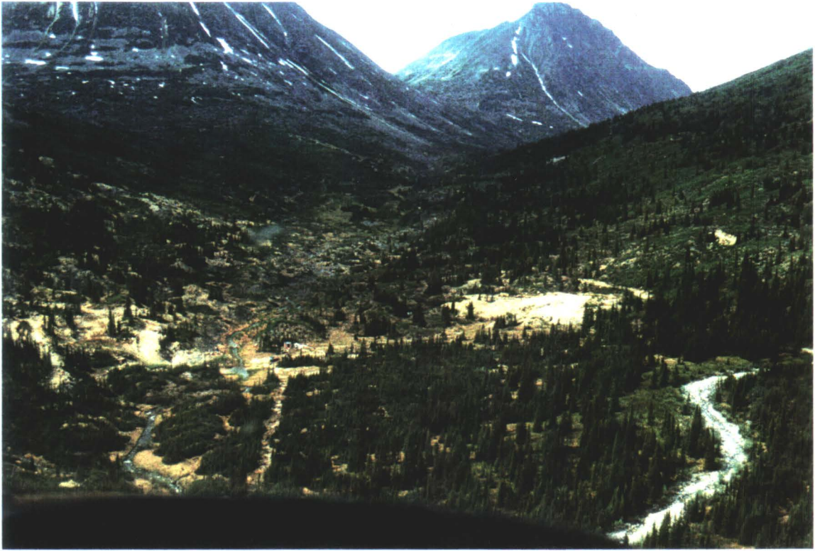
OVERALL VIEW OF SITE