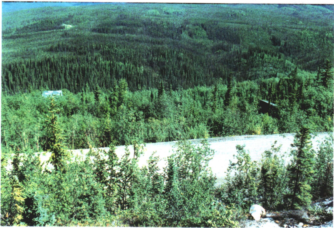
ACCESS FROM HIGHWAY