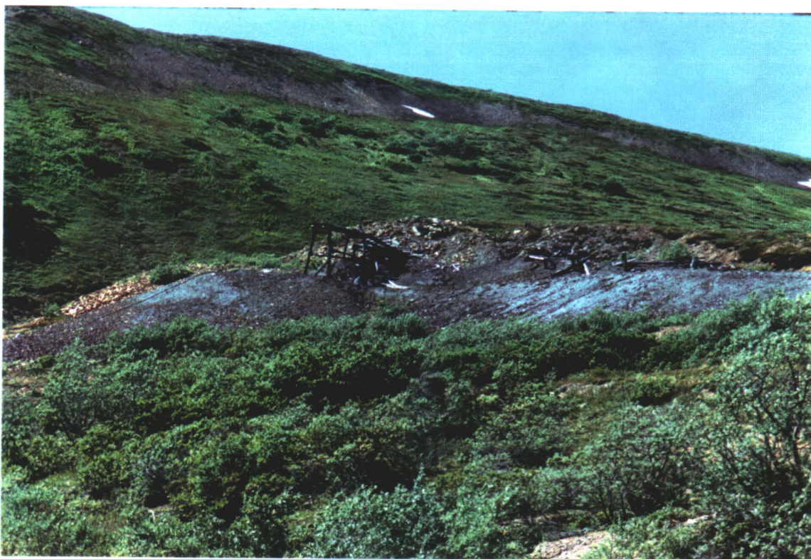
WASTE DUMP AT UPPER ADIT