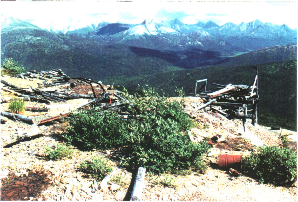
RAIL TO WASTE DUMP FROM UPPER ADIT