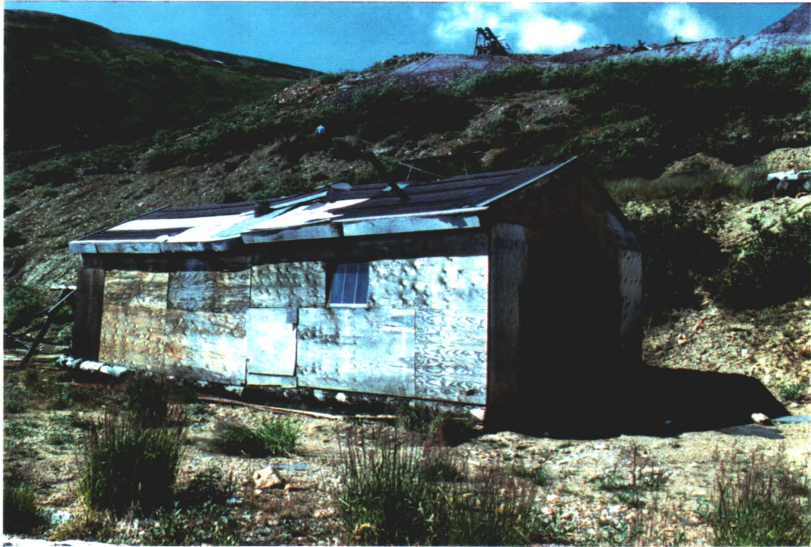
WORKSHOP AT LOWER ADIT