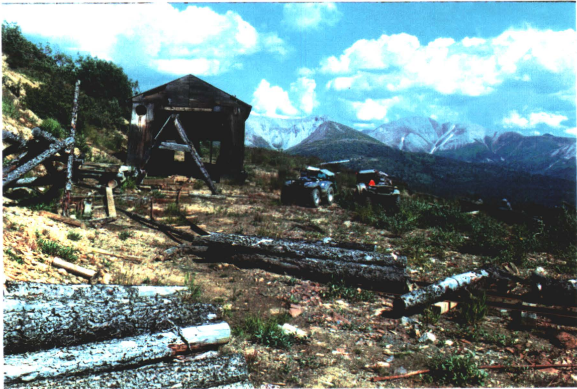
WORKSHOP AT LOWER ADIT