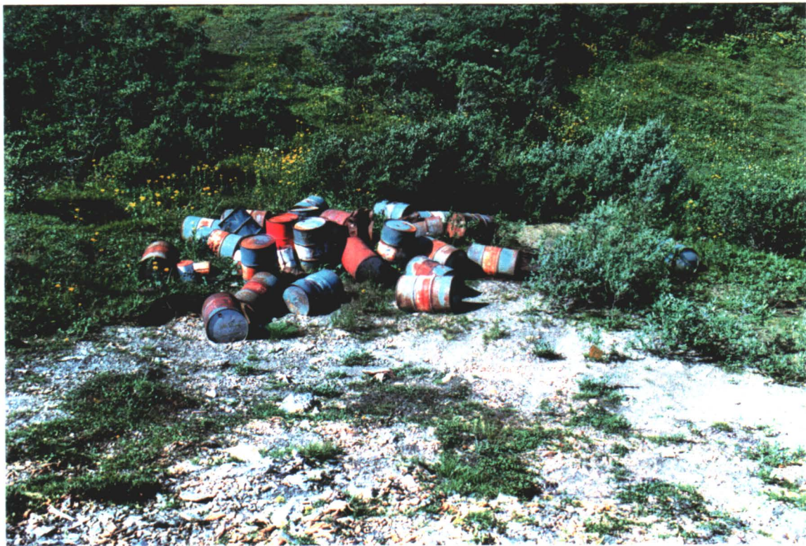
27 BARRELS (7 FULL) AT CAMP SITE