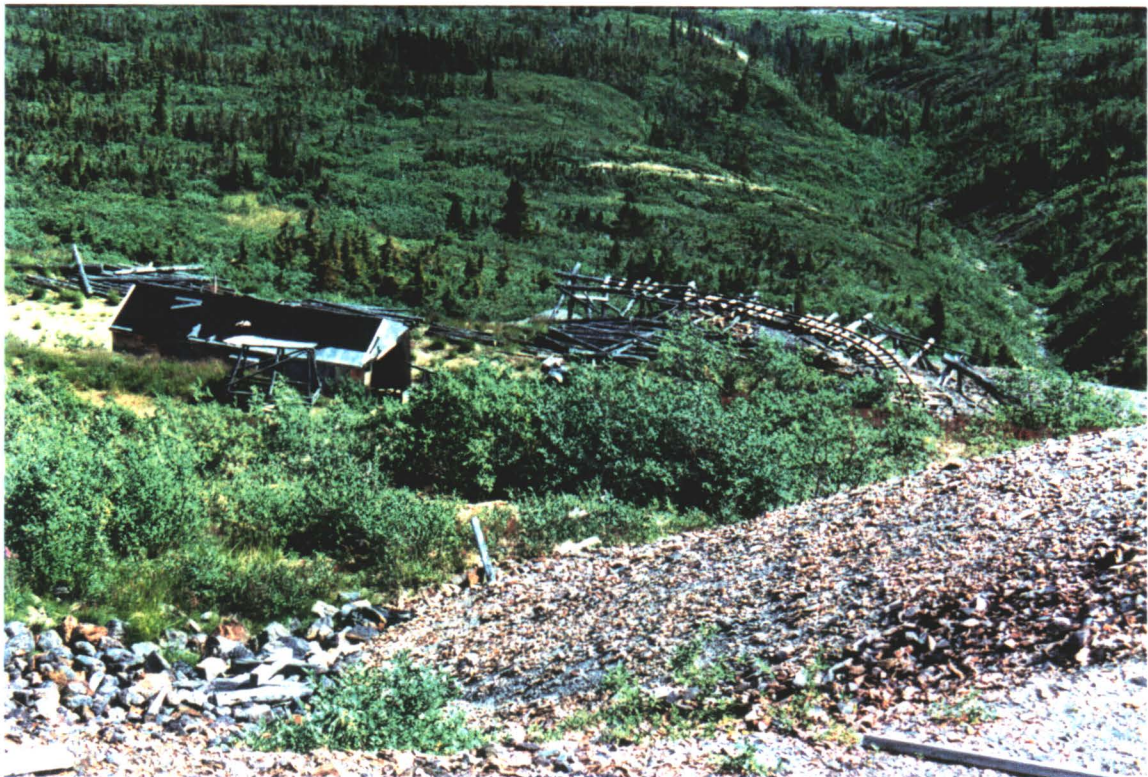
WORKSHOP AND RAIL TO WASTE DUMP AT LOWER ADIT