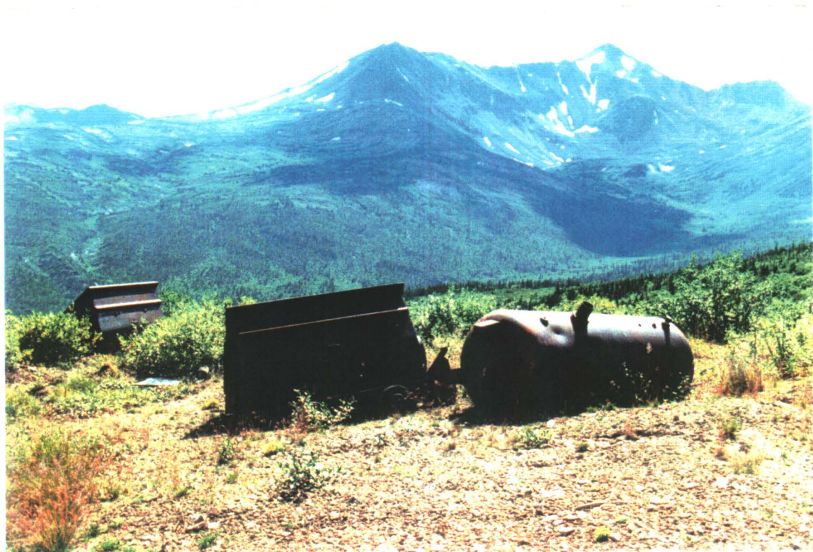
ORE CARS AND PRESSURE VESSEL