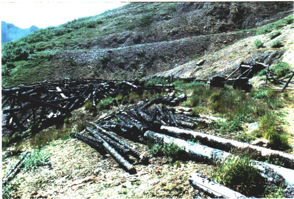
LOWER ADIT, LAGGING, AND RAIL TO WASTE DUMP