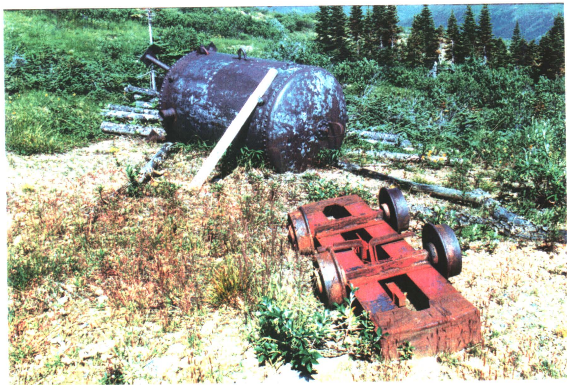
PRESSURE VESSEL AND ORE CAR UNDERCARRIAGE