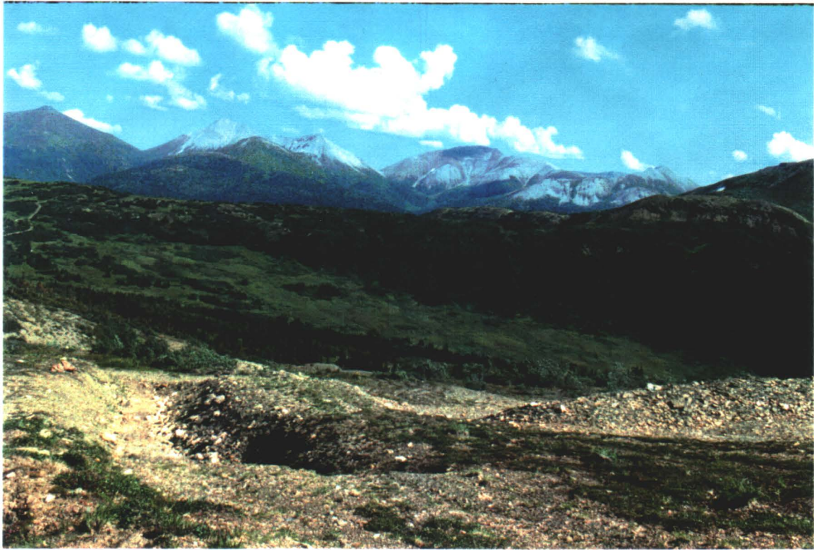
TRENCHING AND LOCAL TOPOGRAPHY