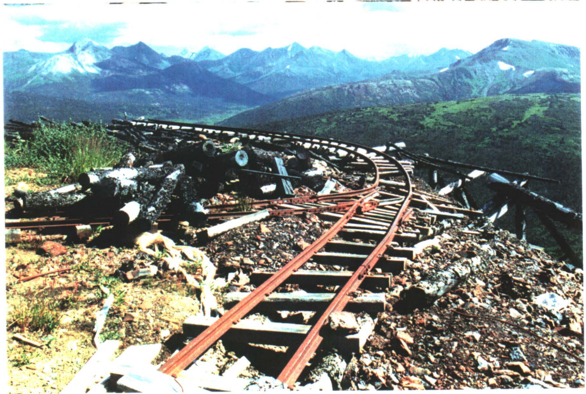
RAIL TO WASTE DUMP FROM UPPER ADIT