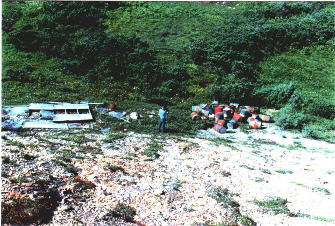
REMAINS OF CAMP AND BARREL SITE