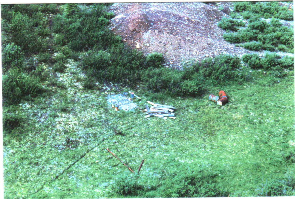
BARRELS, CORE BOXES, AND PIPE