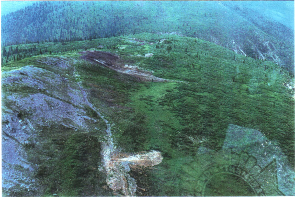
OVERALL VIEW OF SITE SHOWING TRENCHING