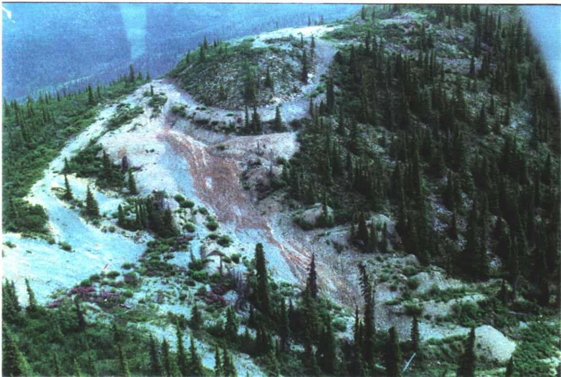
TRENCHING AND EXPLORATION ROADS