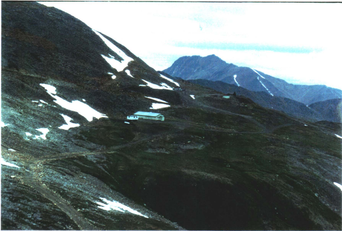
ACCESS TO EXPLORATION SITE