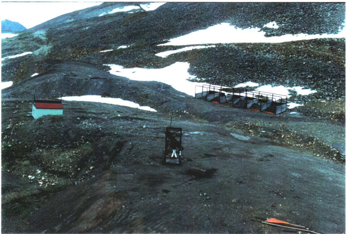
SAMPLING TOWER, ORE BINS, AND GENERATOR BUILDING