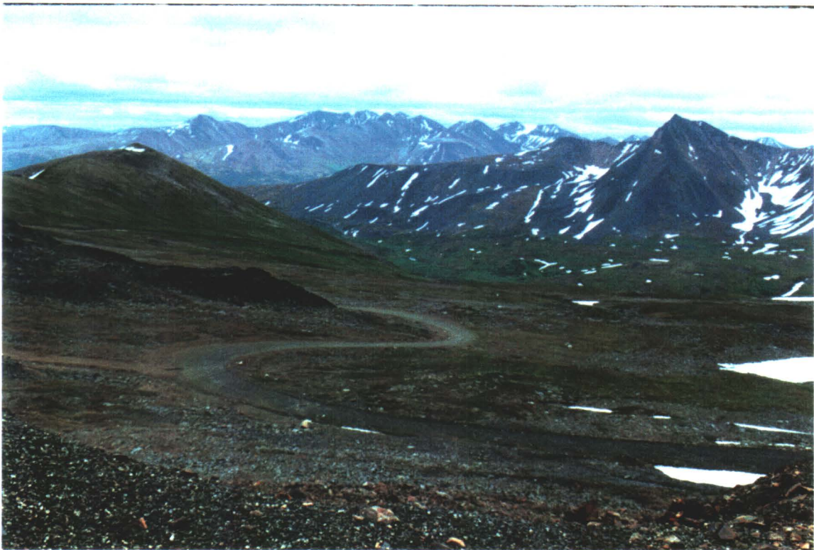
ACCESS ROAD FROM SITE