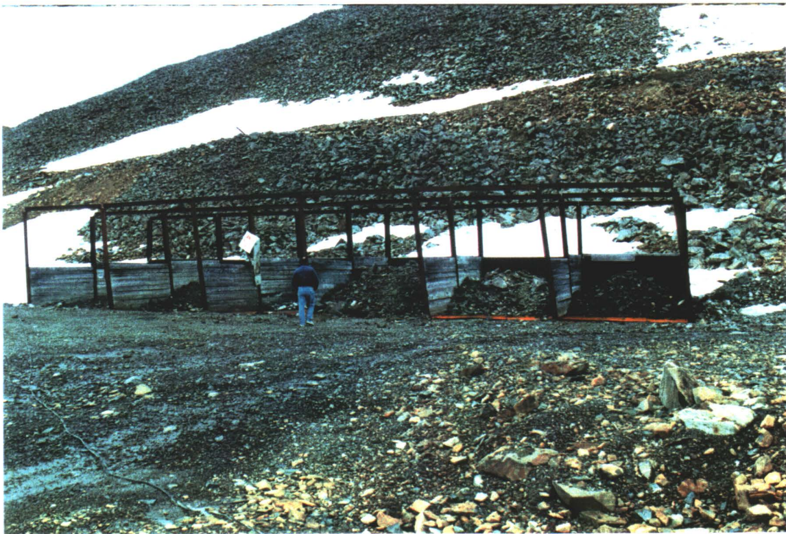
ORE STORAGE BINS