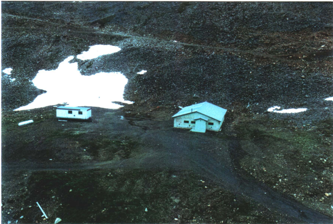
OFFICE TRAILER AND CORE STORAGE BUILDING