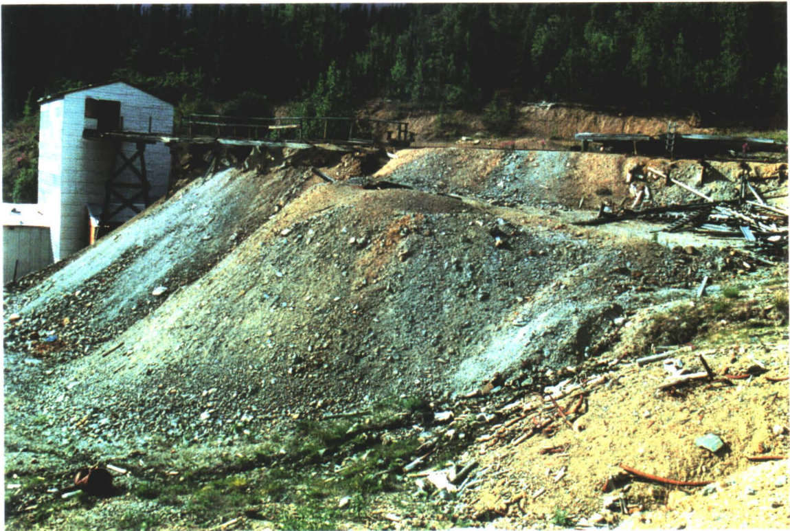
ROCK WASTE DUMP