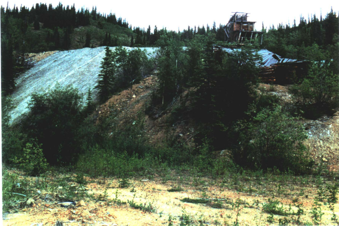
UPPER MILL SITE AND ROCK WASTE ON LEFT