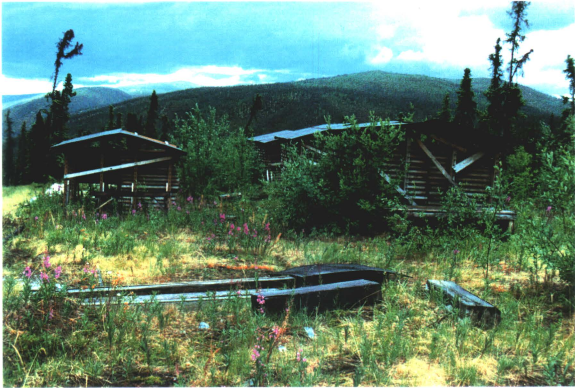
CORE STORAGE SHEDS