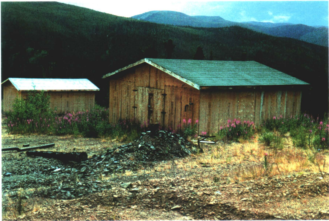
STORAGE SHEDS AT CAMP SITE