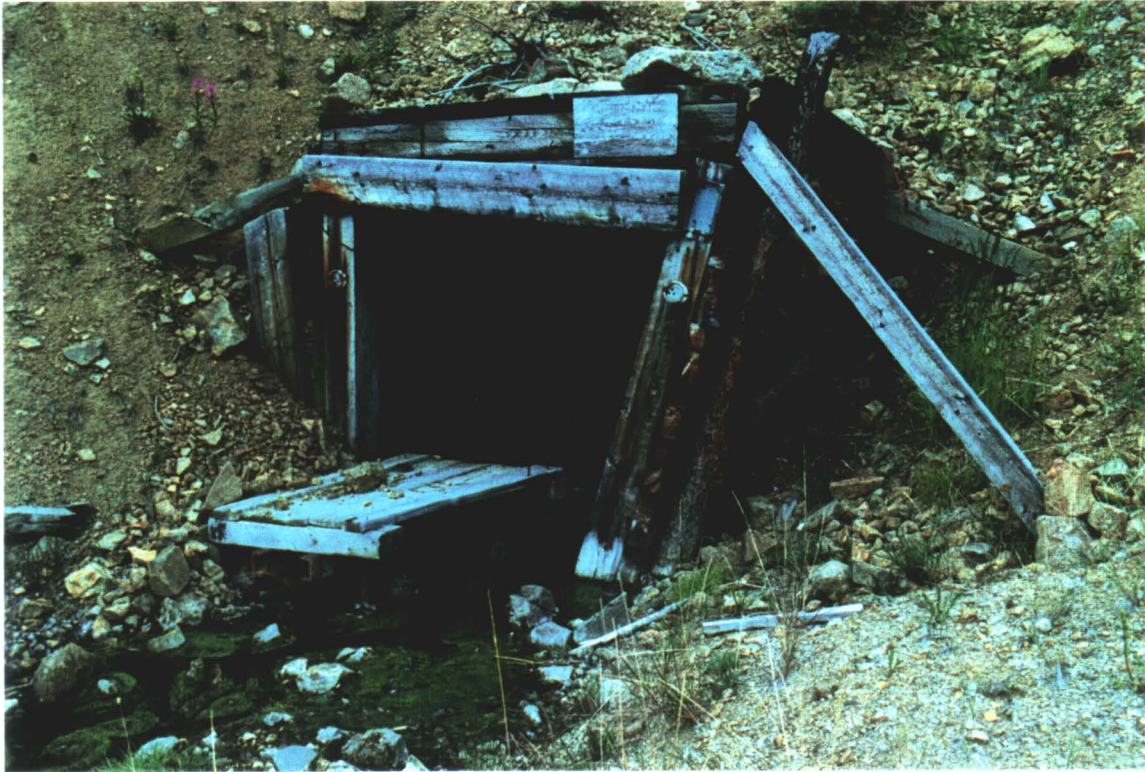
MIDDLE ADIT AND DRAINAGE FROM ADIT