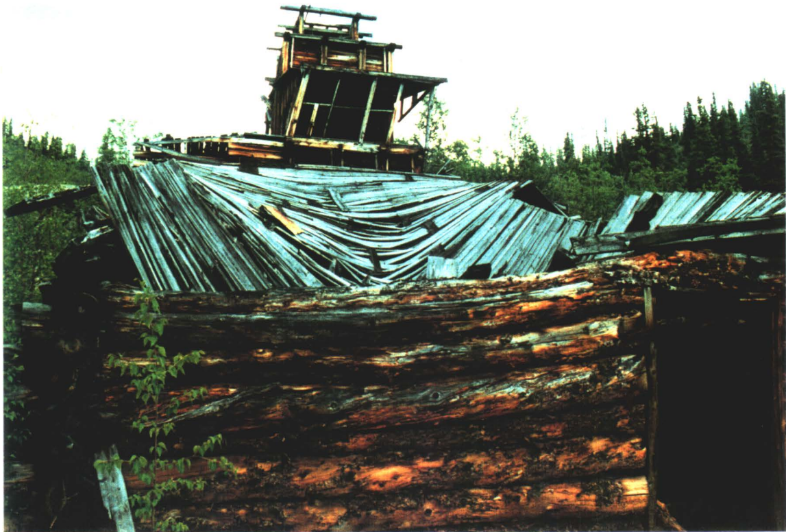
UPPER MILL SITE