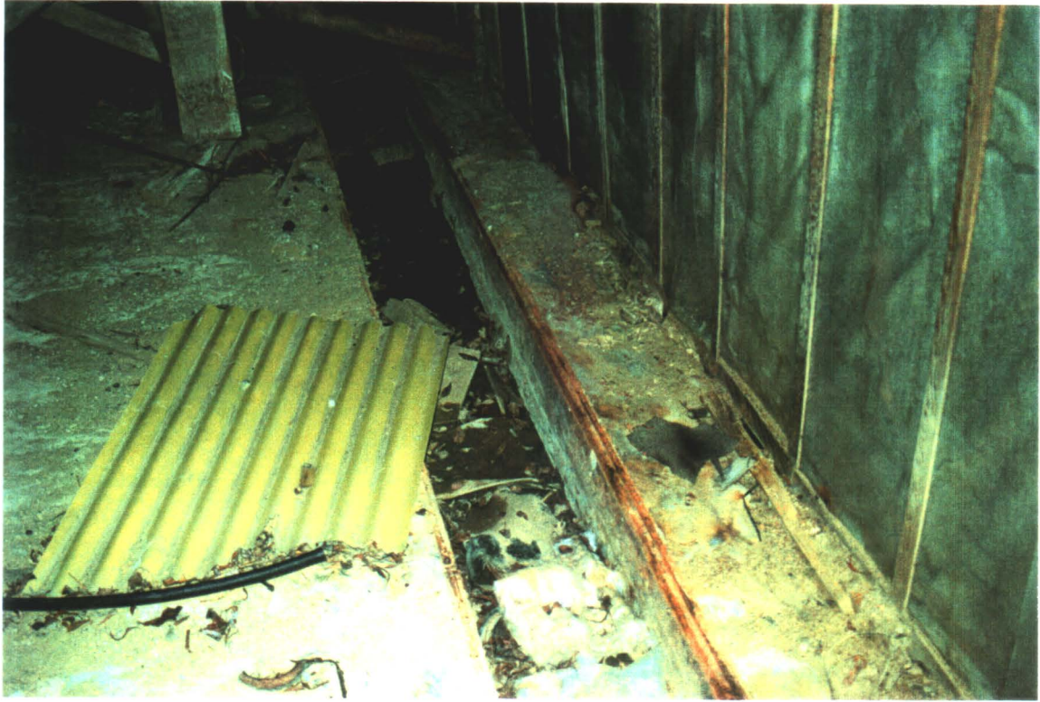
PROBABLE CATCHMENT CHANNEL FOR TAILINGS