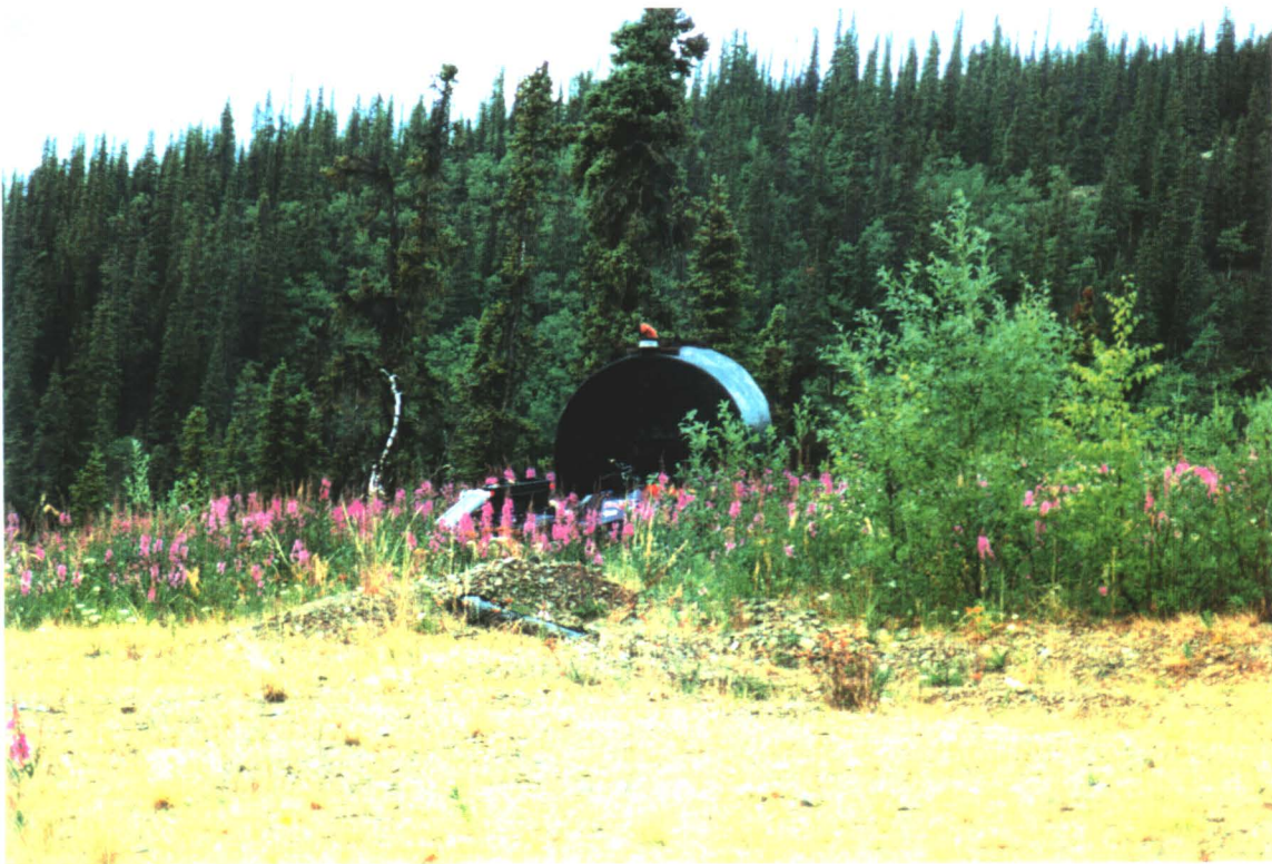
STORAGE TANK AT CAMP SITE