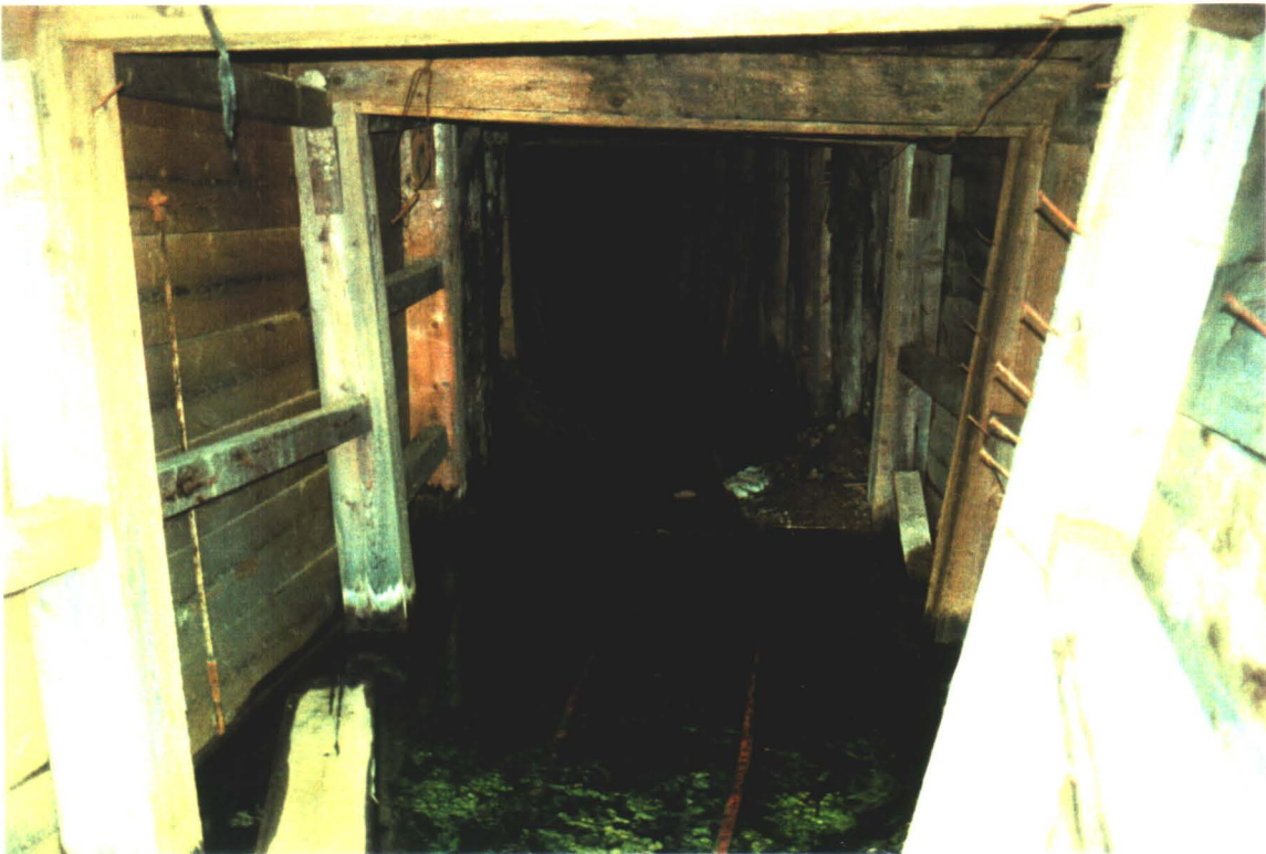
INTERIOR OF MIDDLE ADIT