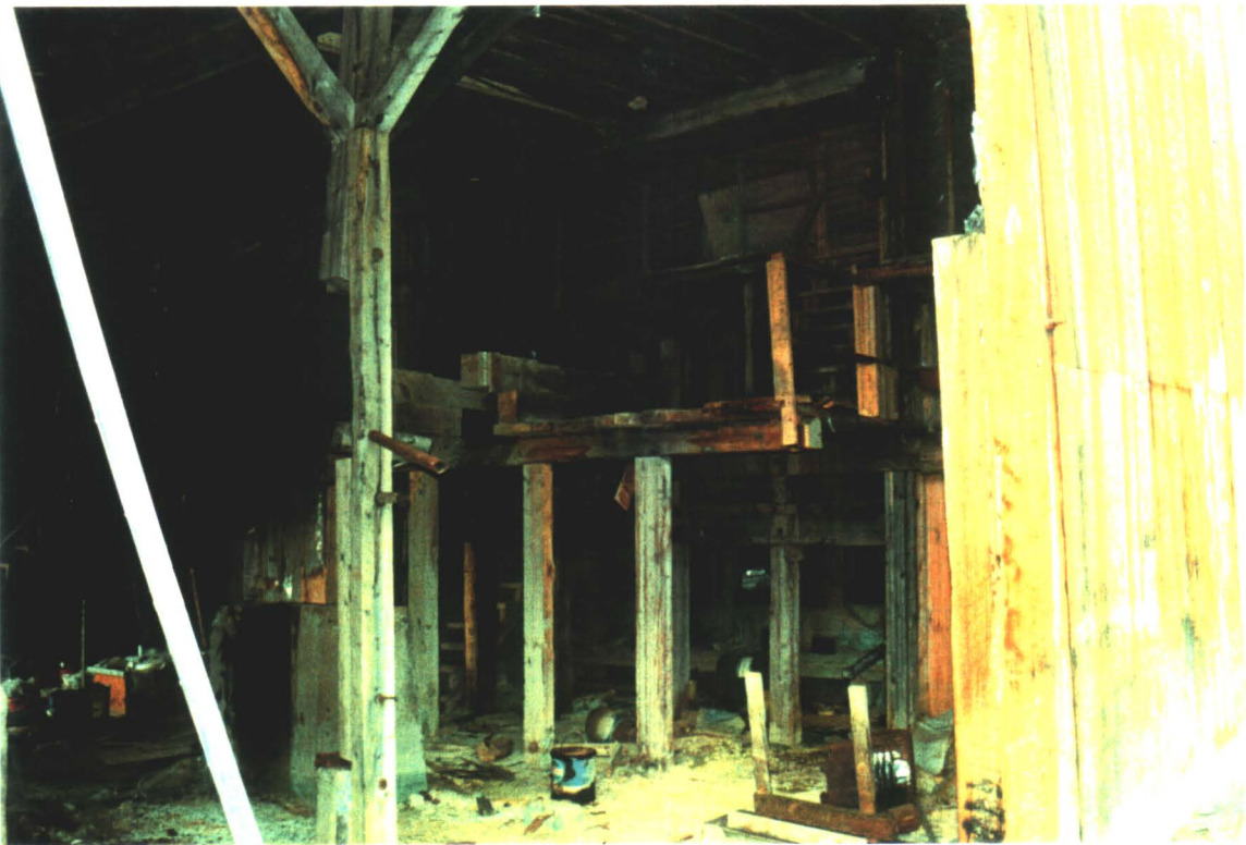
INTERIOR OF MILL BUILDING