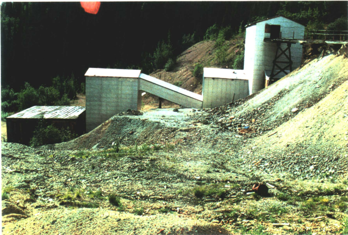
LOWER MILL SITE