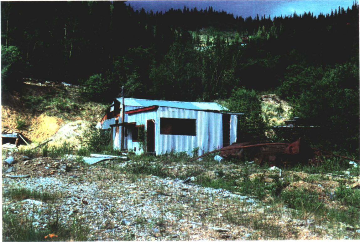
STORAGE SHEDS, ORE CARS, AND ROCK CORE