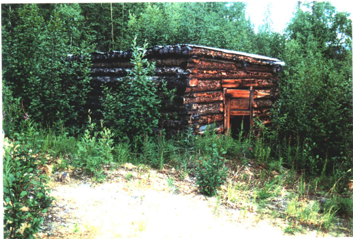
LOG STORAGE SHED