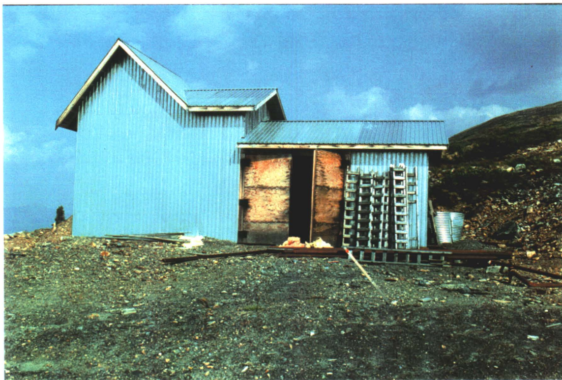
BUILDING OVER SHAFT