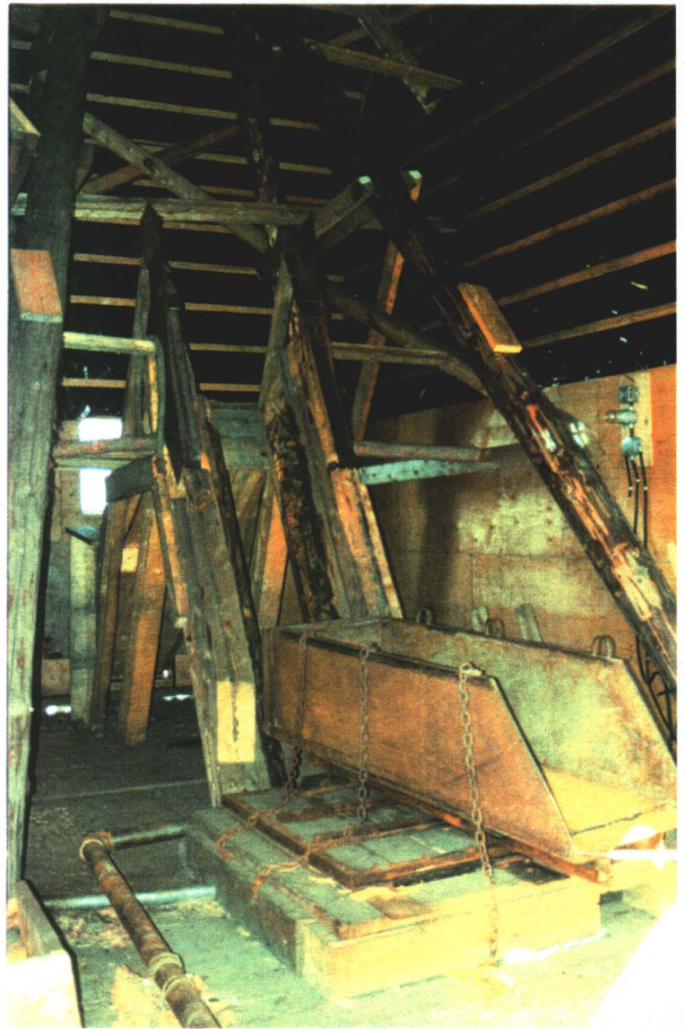
INTERIOR OF BUILDING