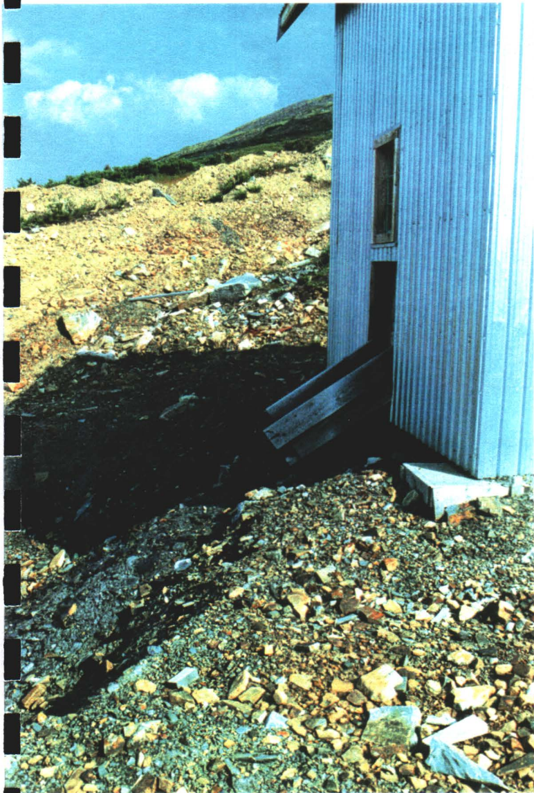
ORE CHUTE FROM BUILDING