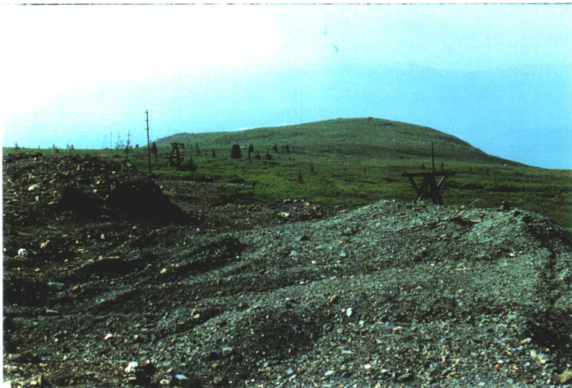
WASTE ROCK DUMP, TRAMWAY TOWERS, AND POWER LINE