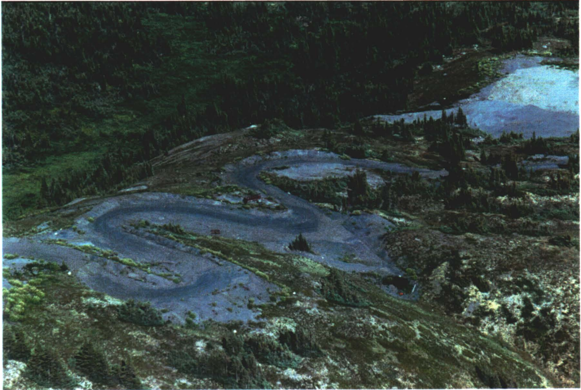
ROAD BETWEEN CAMP AND EXPLORATION AREA