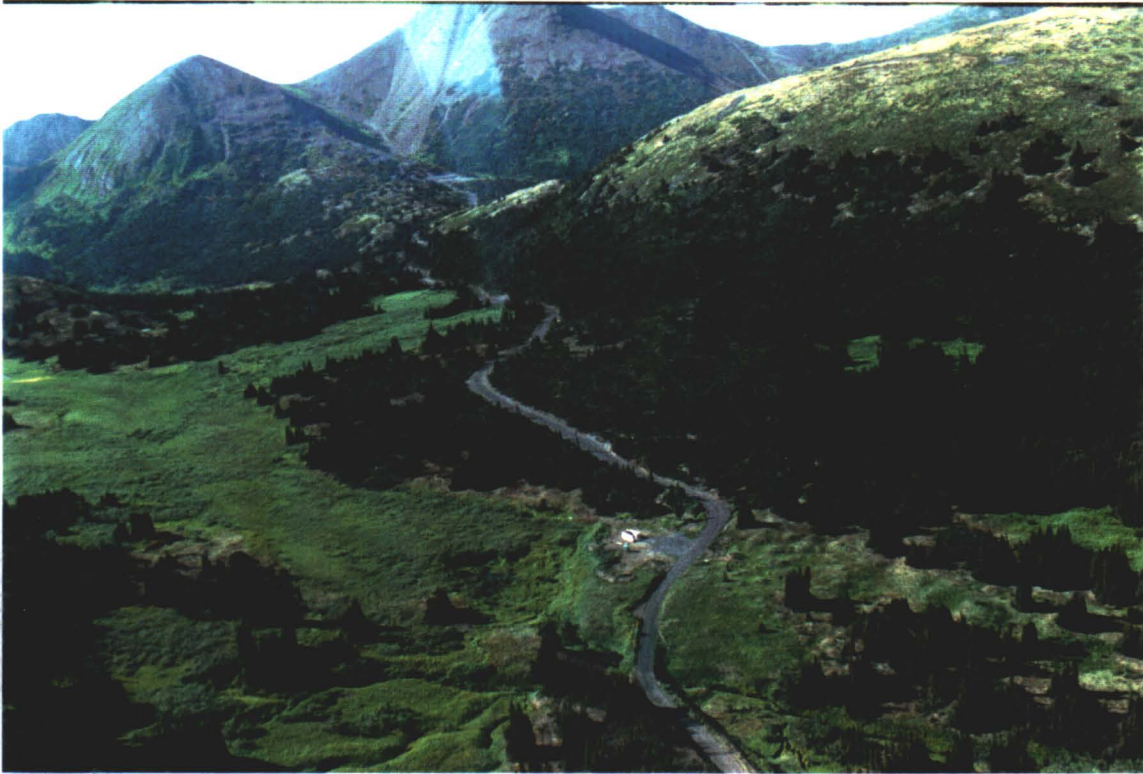
ACCESS ROAD AND EXPLORATION SITE ON MOUNTAIN (LEFT)