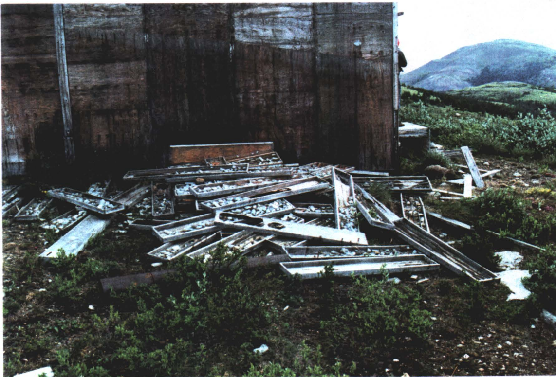
7. SPILLED ROCK CORE