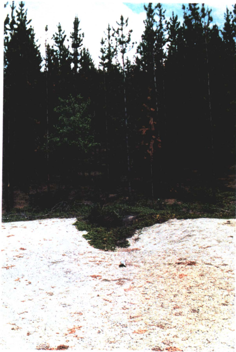
14. INLET TO TAILINGS POND