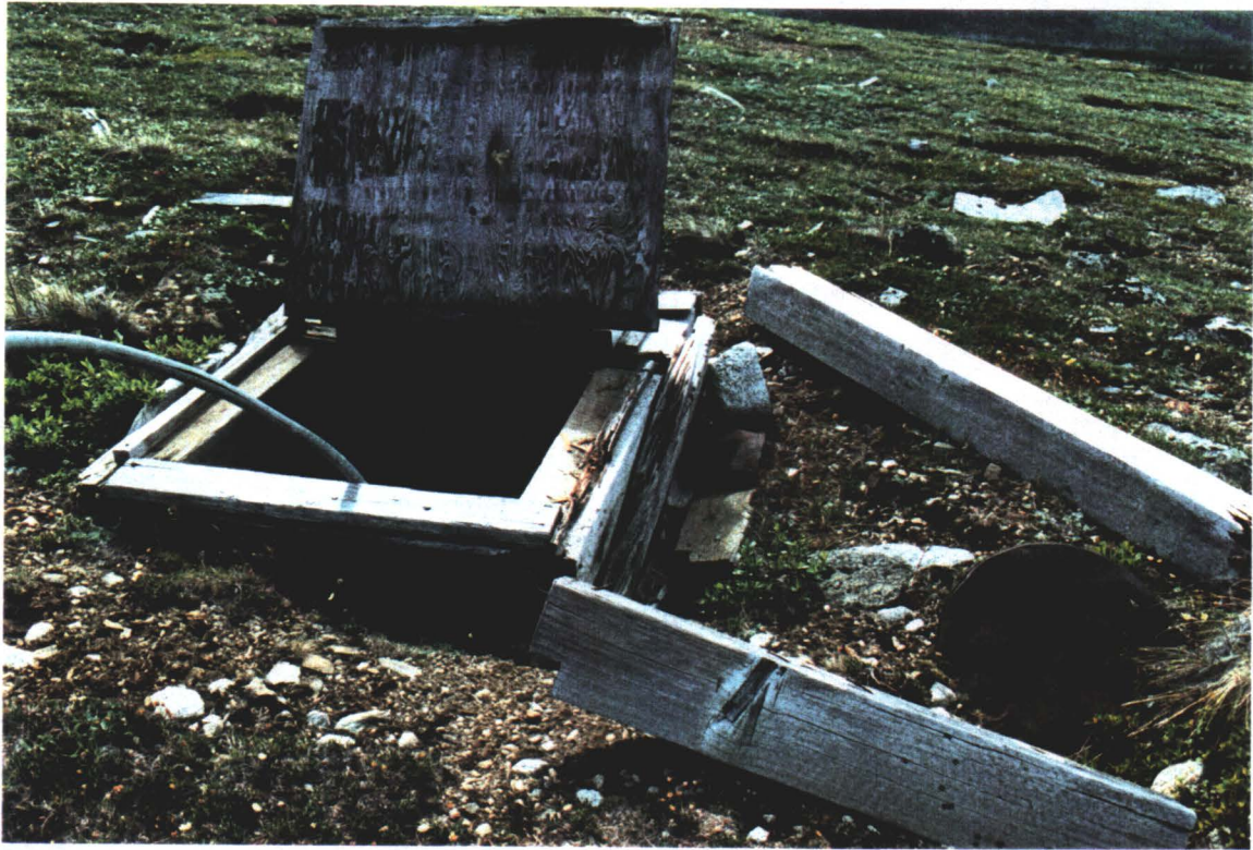
8. OPEN SHAFT WITH PLYWOOD COVER