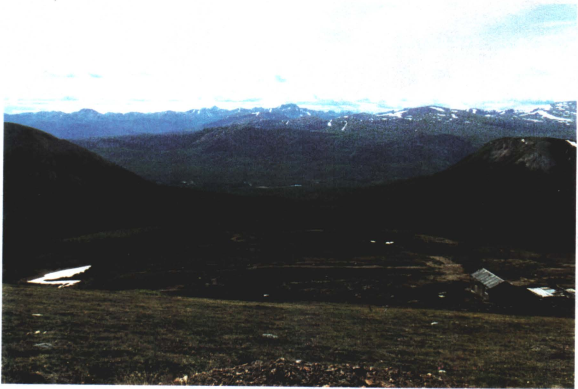
1. OVERLOOKING MINE SITE