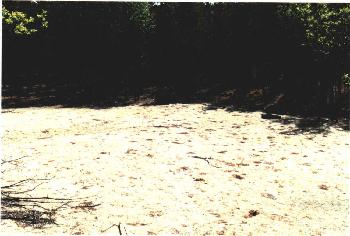
13. TAILINGS POND