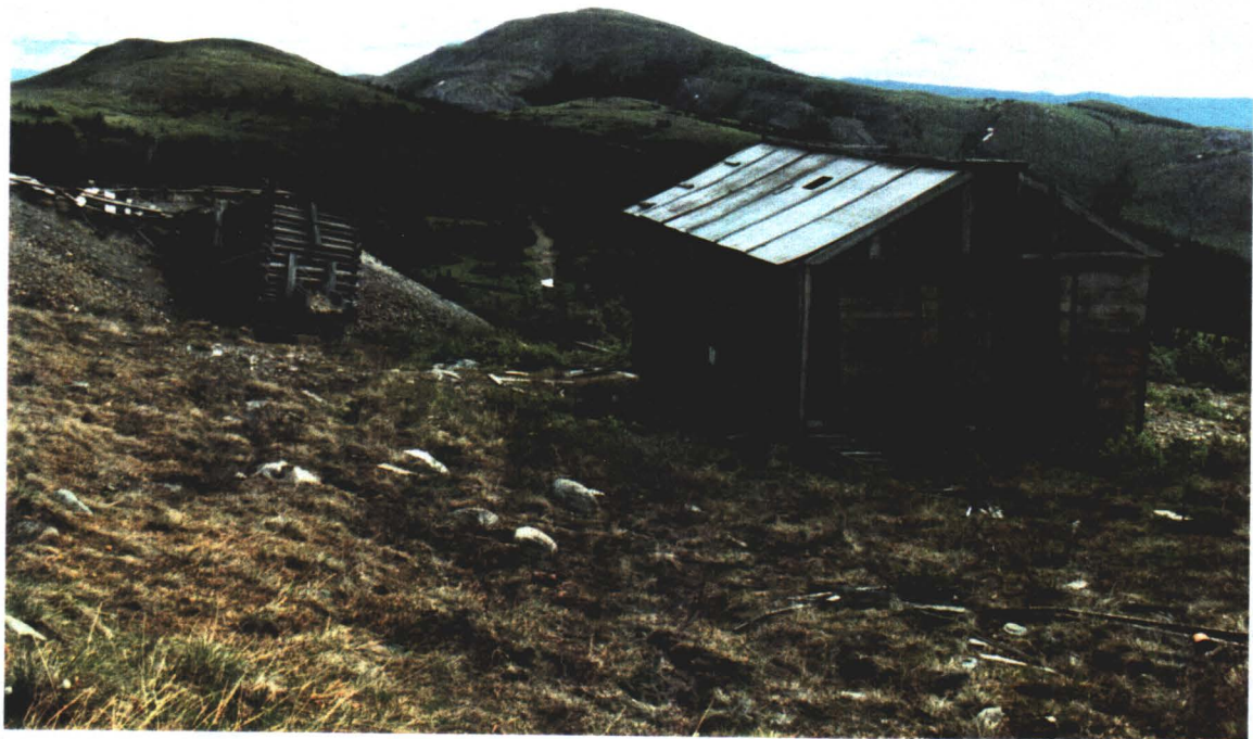
5. TOOL SHED AND LOADOUT