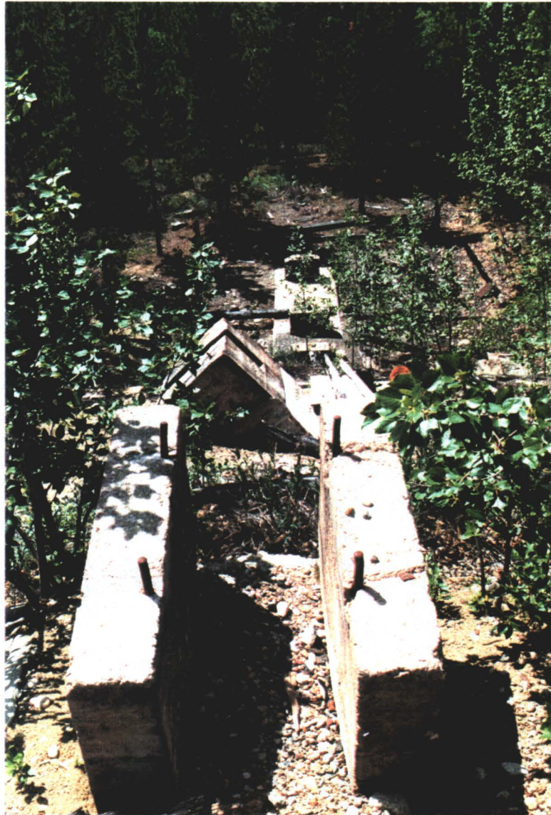
12. MILL FOUNDATIONS