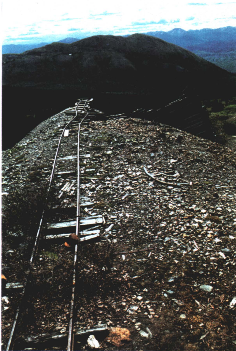
3. WASTE DUMP AND LOADOUT