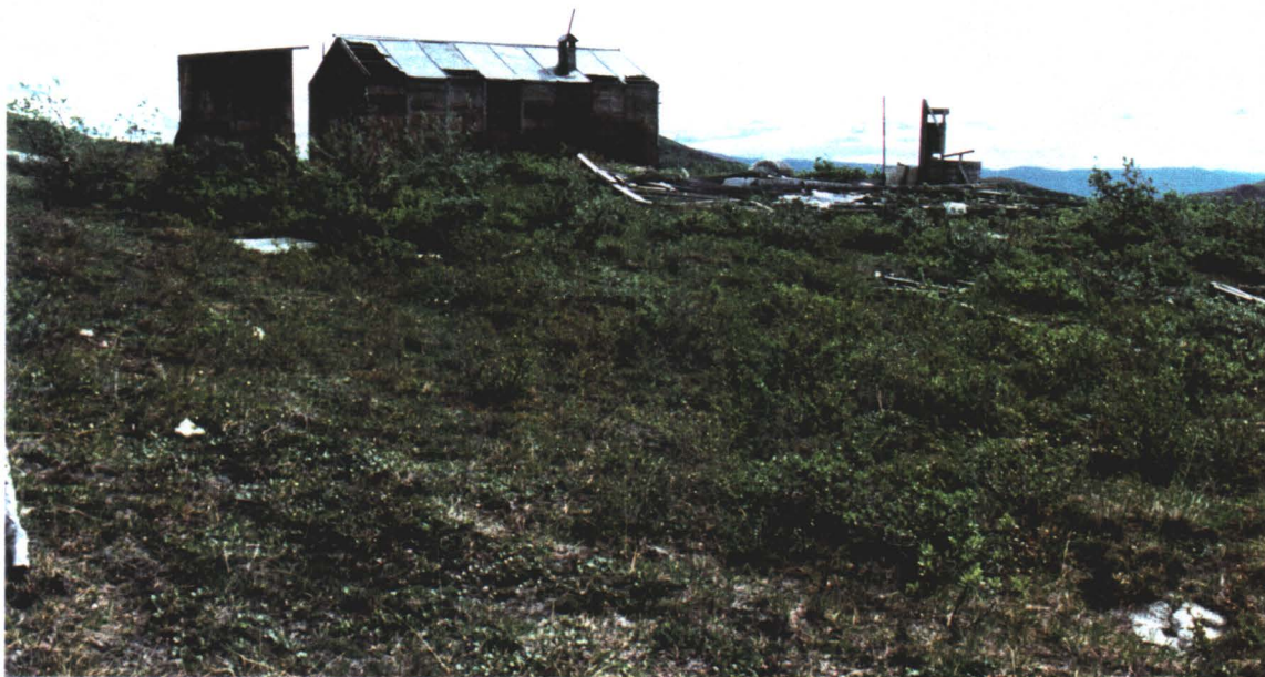
6. COLLAPSED STORAGE BUILDING AND PLYWOOD CLAD BUILDING