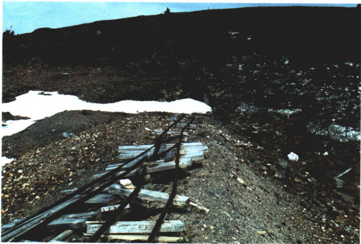
2. MINE ADIT AND RAIL