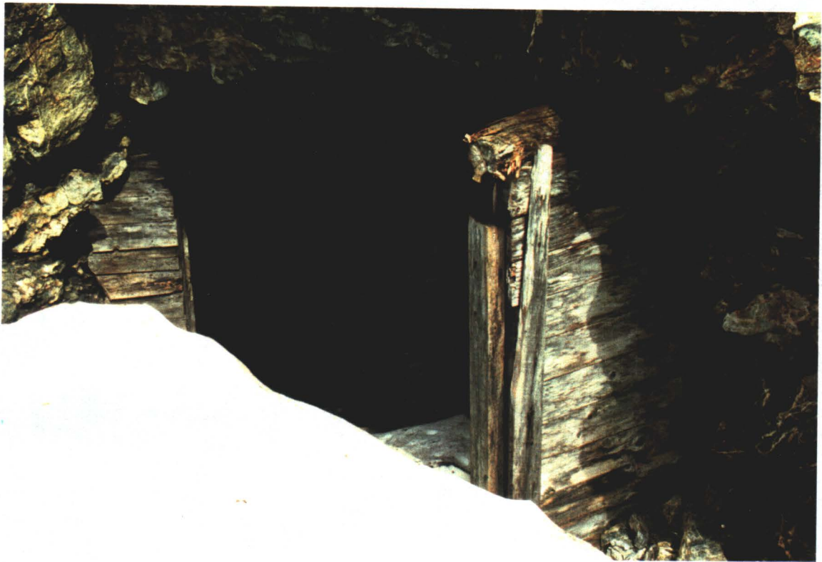
4. OPEN ADIT