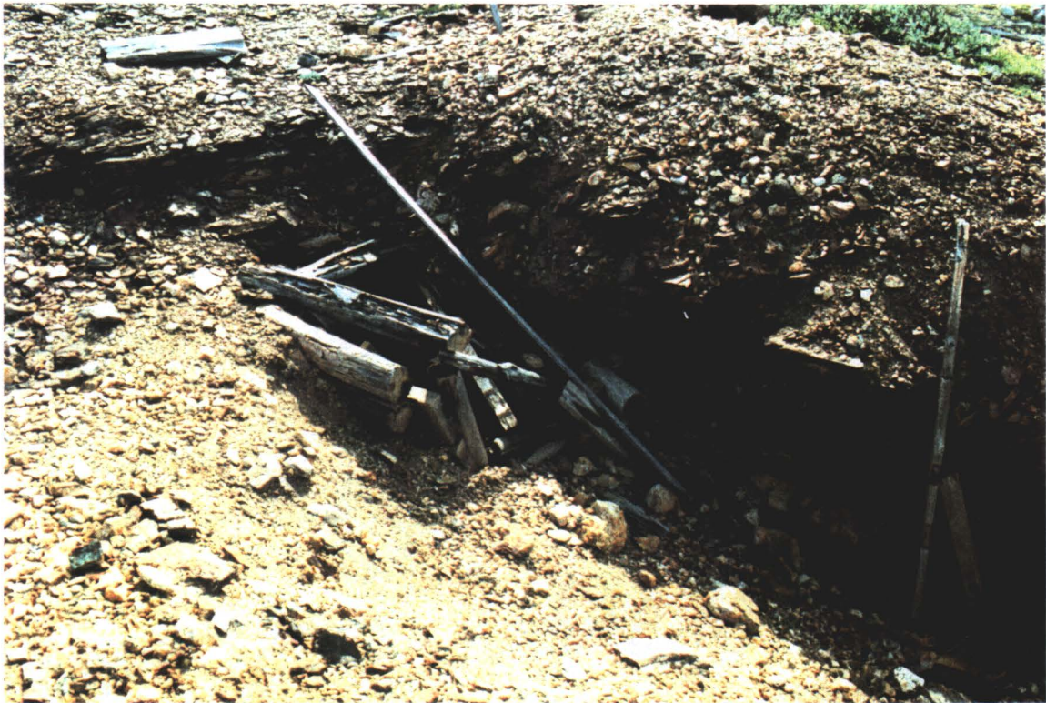
9. OPEN RAISE ABOVE ADIT