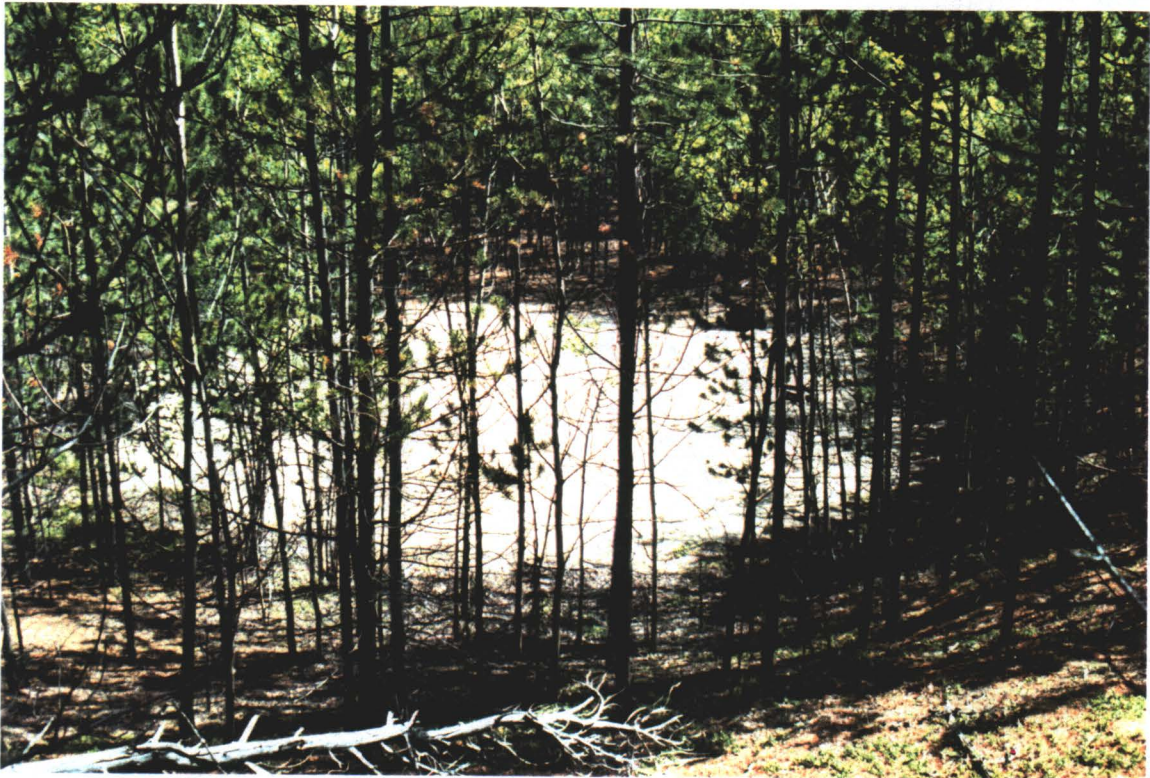
11. TAILINGS POND AND SURROUNDING VEGETATION