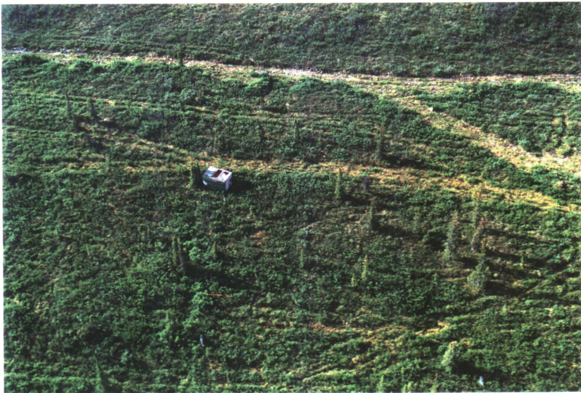
TRAIL ABANDONED ON-SITE