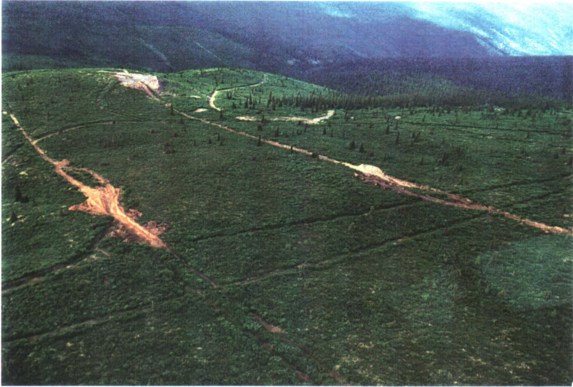
OLD AND NEWER EXPLORATION TRAILS