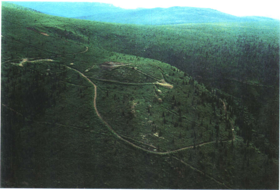
ROAD INTO TINTA HILL SITE