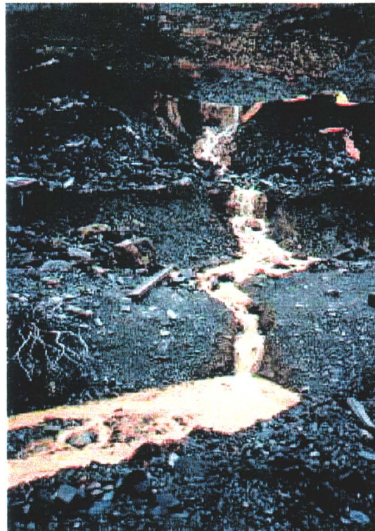
Figure 3 Flow 30 meters below adit, September 1998.