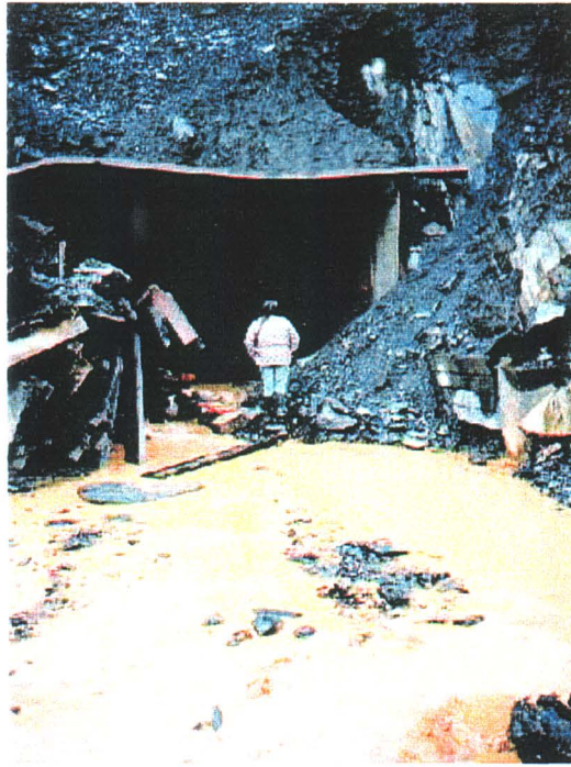
Figure 2 Discharge of adit, September 1998.