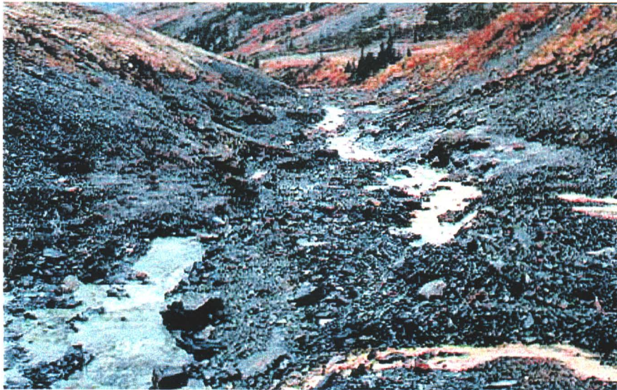
Figure 5 Lower reach of Sekie Creek #2 showing absence of riparian vegetation in September, 1998.