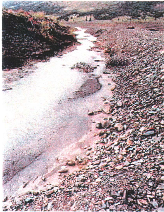
Figure 4 Active erosion and sediment of Rust (Sekie Creek #2) due to upstream road construction (Monenco, 1982).