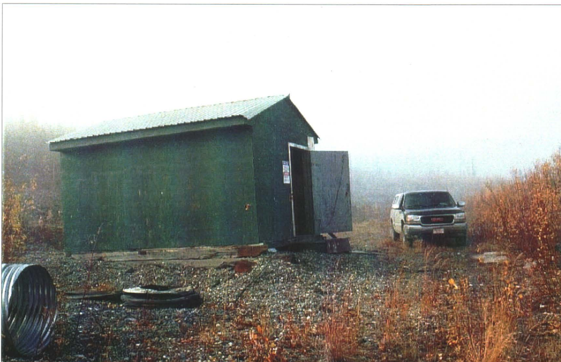
Photo 1-2 : Silver King. Ventilation Raise Building. Looking west, about 100m southeast of the open pit.