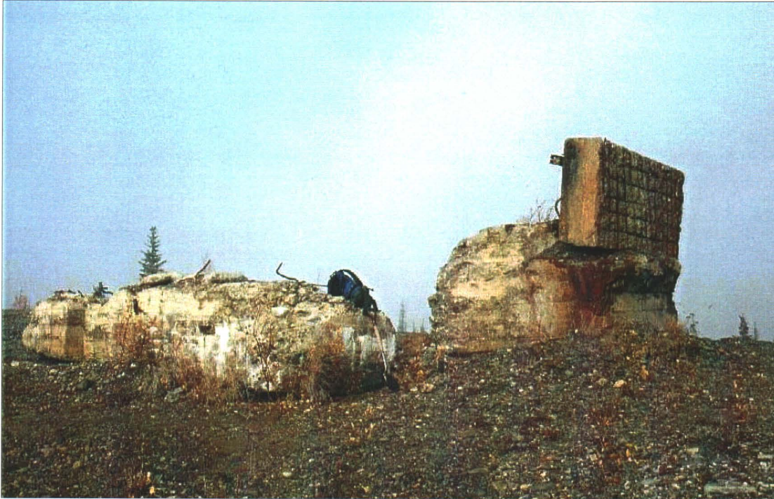
Photo 1-6 : Silver King. Concrete shaft hoist foundations. Looking northwest, northwest of the open pit.