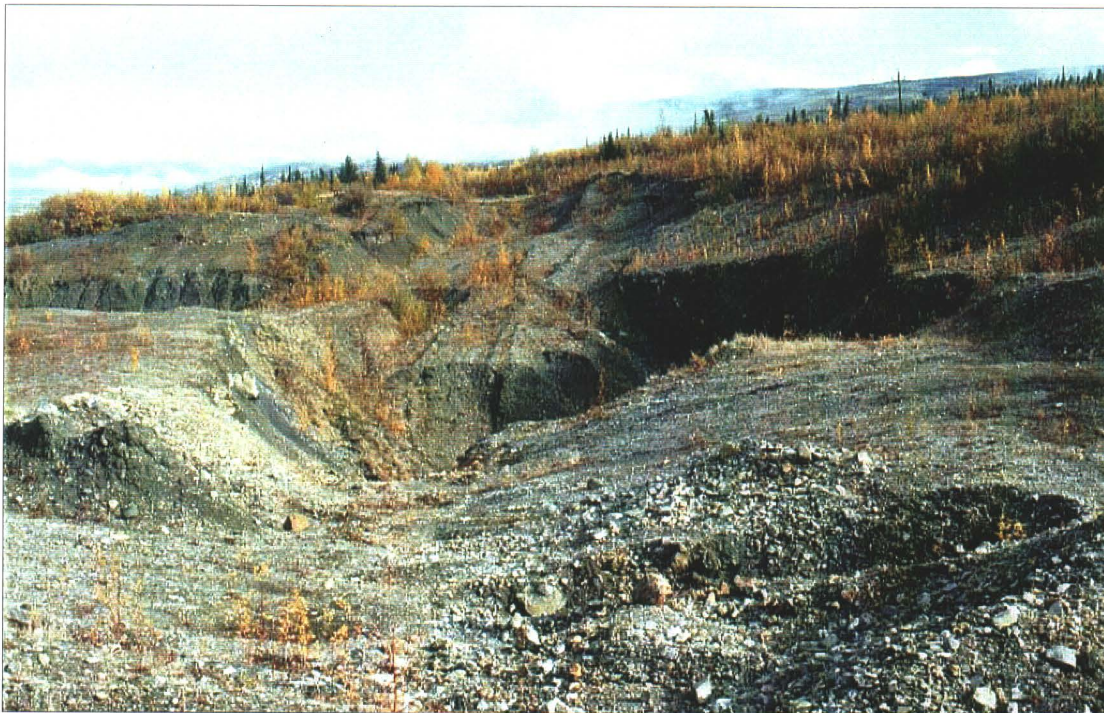
Photo 1-5 : Silver King. Silver King Pit, looking east-northeast. Note moderate pit wall slope, abundance of overburden versus outcrop, and natural revegetation.