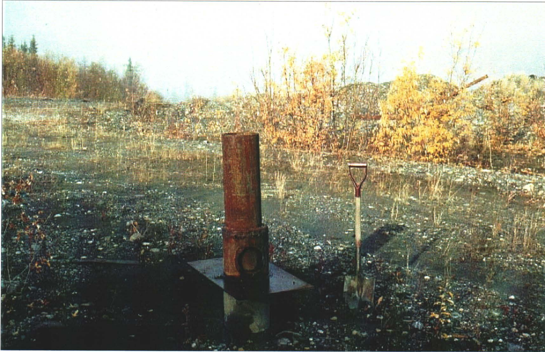
Photo 1-4 : Silver King. Backfill pipe, 100m south of the open pit. Looking northwest. Note hydrocarbon stain at base of pipe (likely drill lubricant or hydraulic fluid).