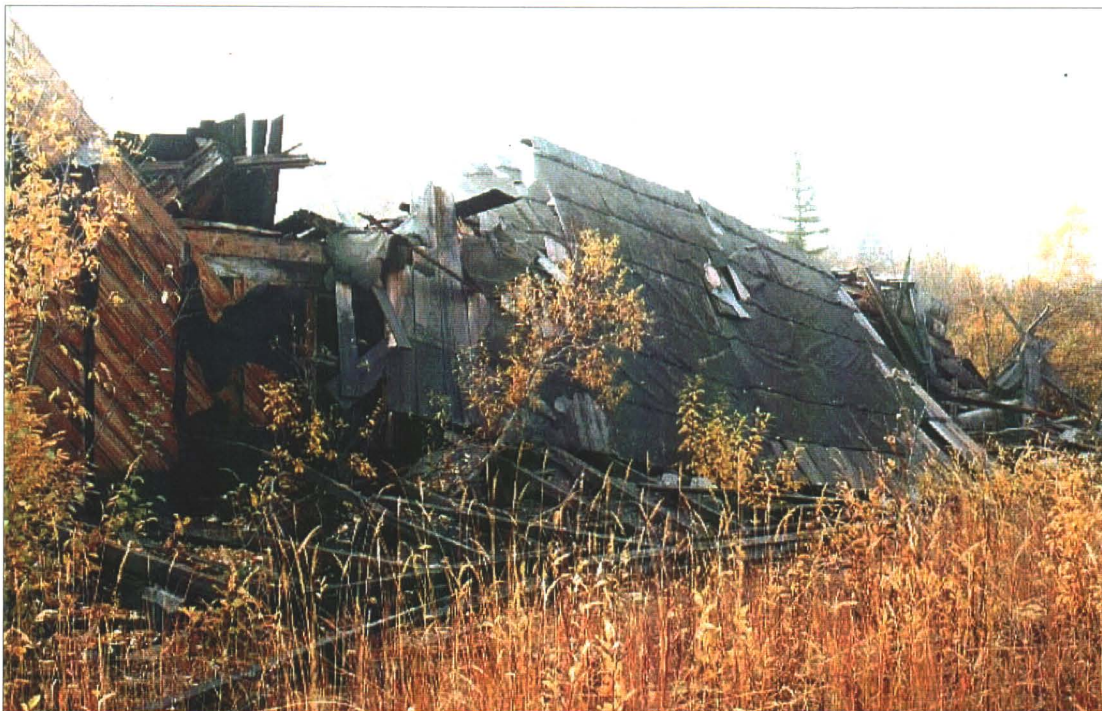
Photo 1-7 : Silver King. Large, collapsed storage shed. Looking south, near transformer station south of highway, west of Galena Creek.