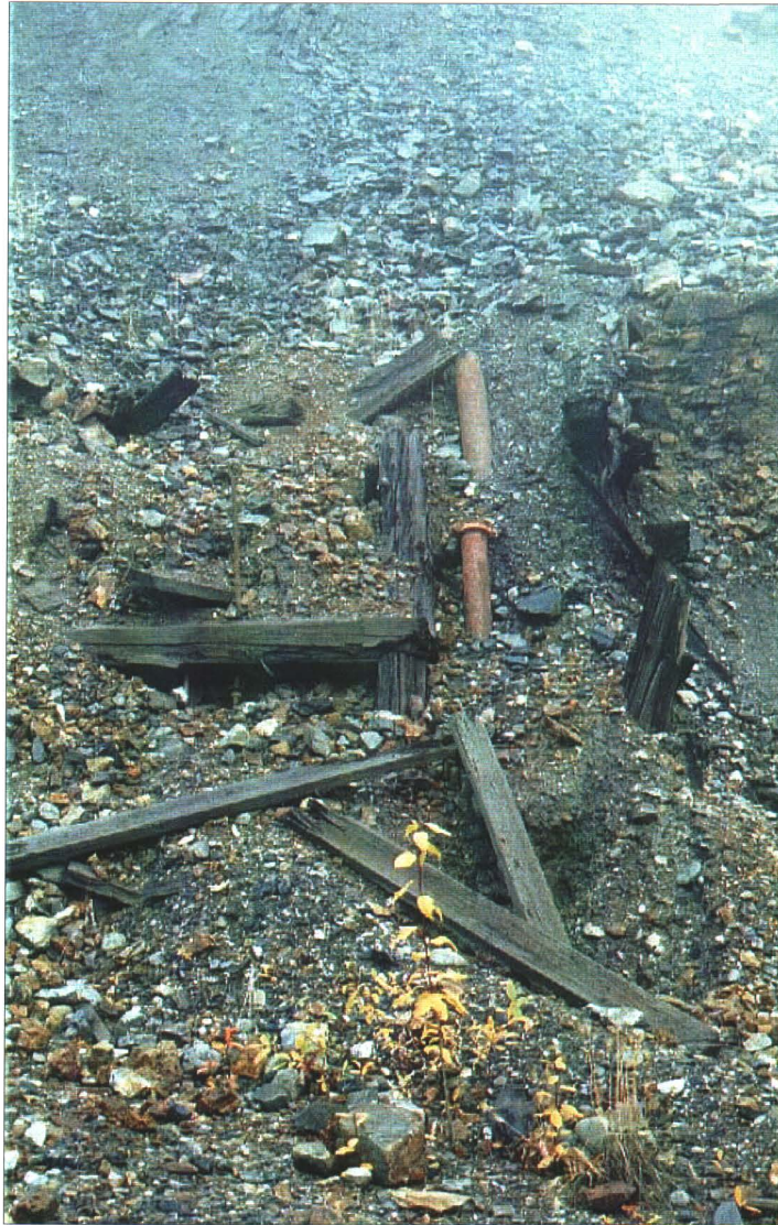
Photo 1-3 : Silver King. Timbers and pipe identify a filled-in raise or shaft (Shaft 1). Looking northwest at the bottom northwest corner of the Silver King pit.