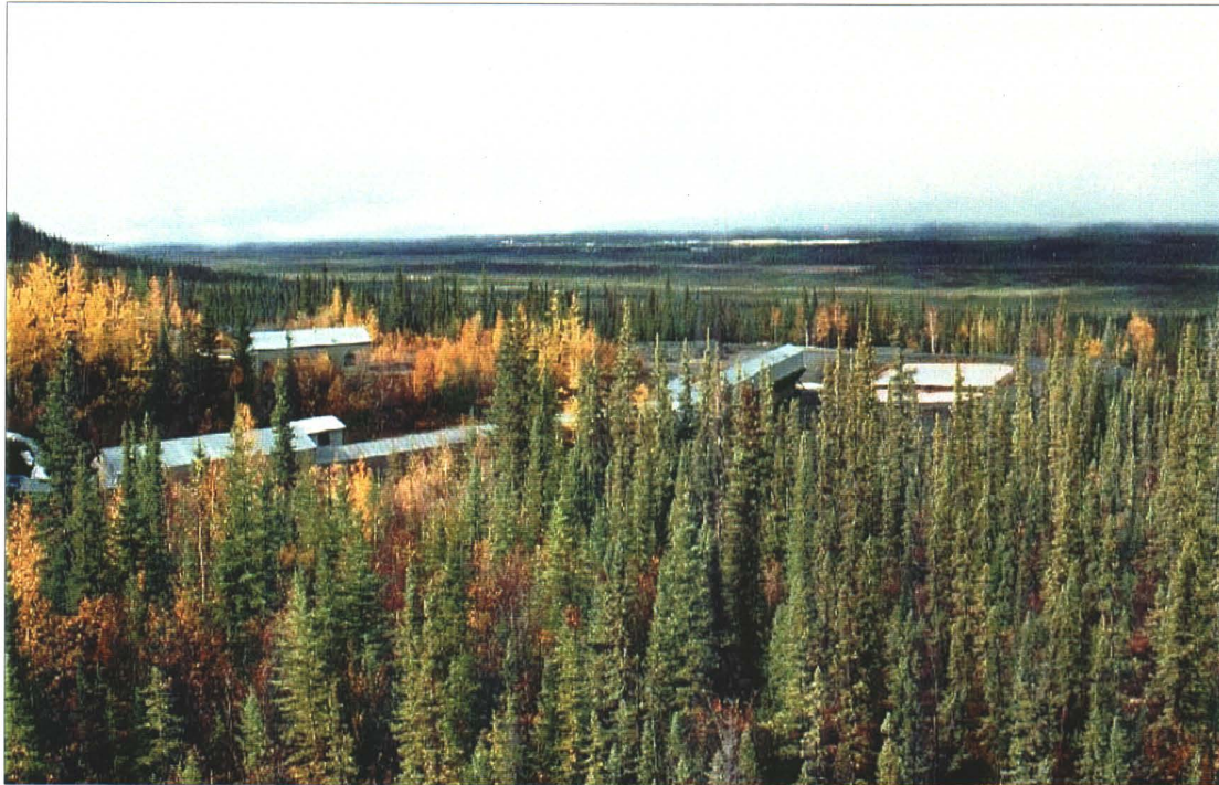
Photo 1-1 : Silver King. Silver King 100 Level Portal site, showing buildings (1A, 1B & 1C) and settling ponds. Looking northwest from the open pit waste dump across Galena Creek.