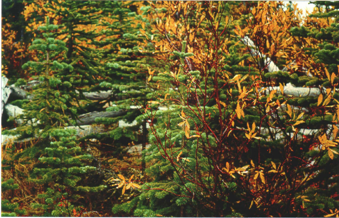
Photo 5-1: Building 5A - Building was of log construction has deteriorated and collapsed.