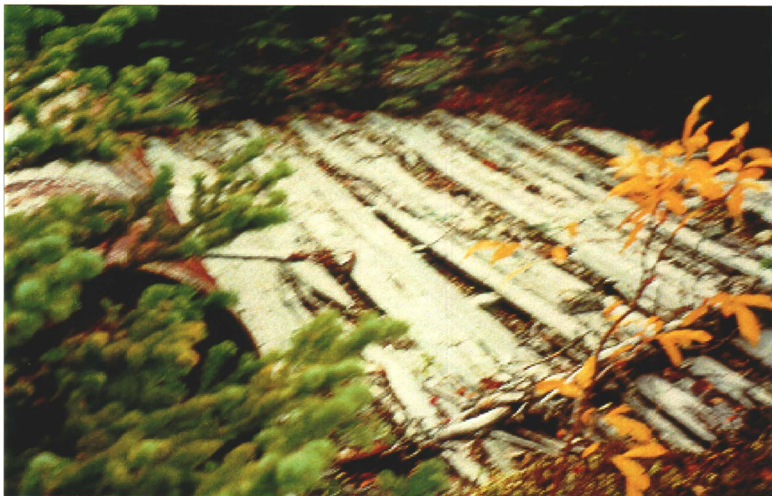
Photo 5-3: Building 5C - Building has collapsed and only plank flooring is evident.