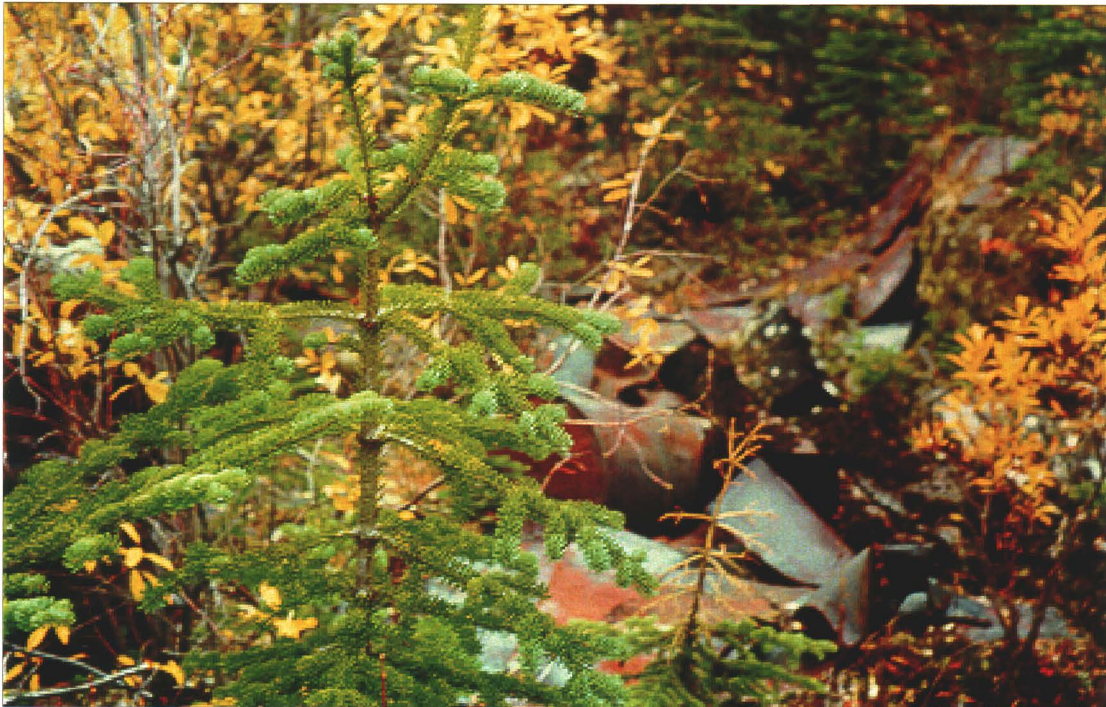
Photo 5-2: Building 5B - Building had collapsed and burnt - metal debris appeared to be burnt.