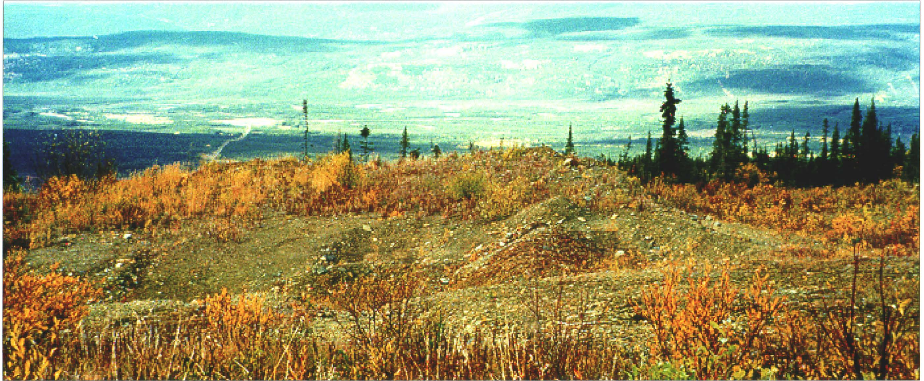
Photo 5-6: Trenched area is on the southwest portion of the Coral and Wigwam site.