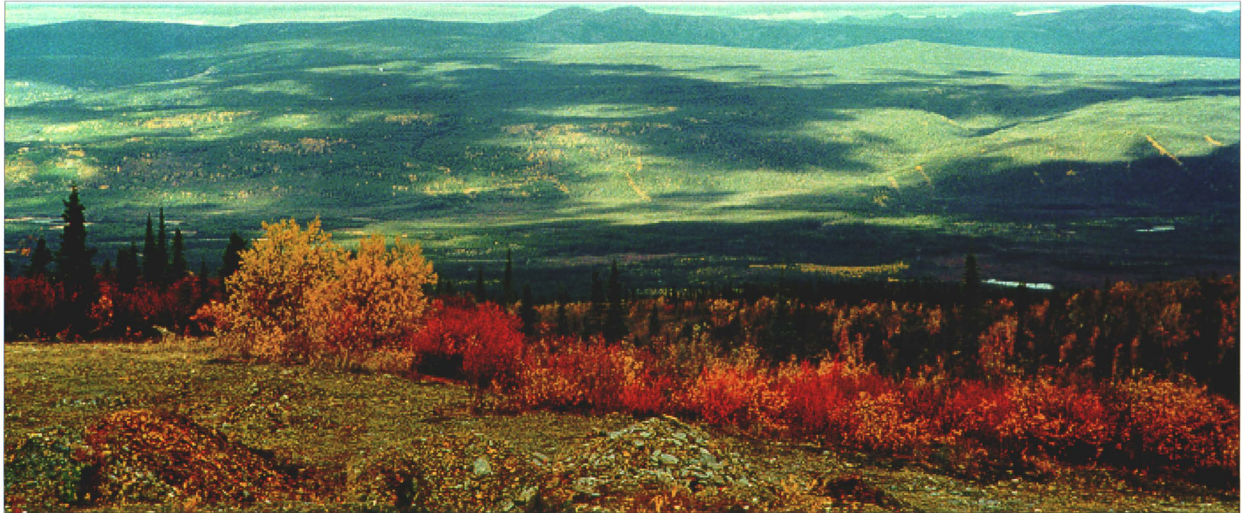
Photo 5-5: Small trenched areas can be noted in the foreground of the photo within the leveled area of the waste rock dump.