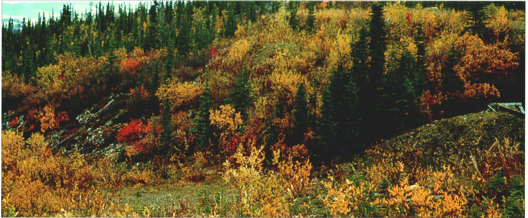
Photo 5-4: Trenched area below the collapsed shafthouse (shafthouse debris can be seen on the far right of photo).