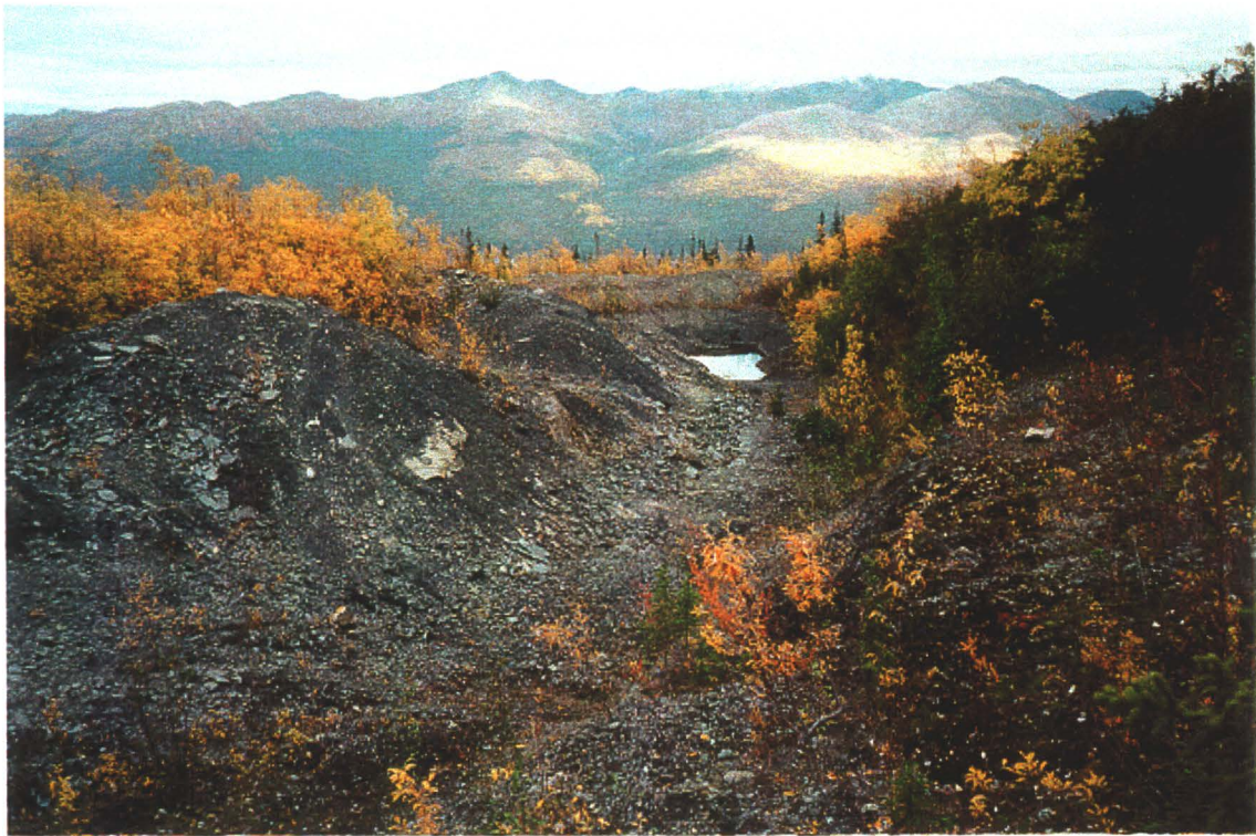
Photo 21-6: Pit #4 with ponded water from groundwater seeps. (Azimuth 030°)