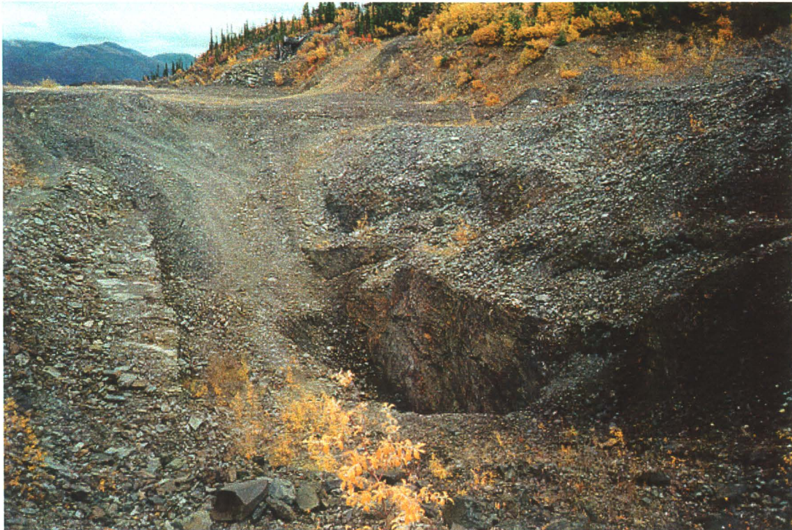
Photo 21-2: Overview of Pit#1 developed in the late 1980's. (Azimuth 060°)