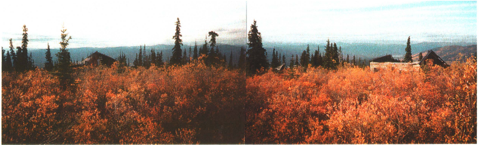
Photo 21-19: Partially collapsed buildings (Bldgs. 21-L). (Azimuth 280-340°)