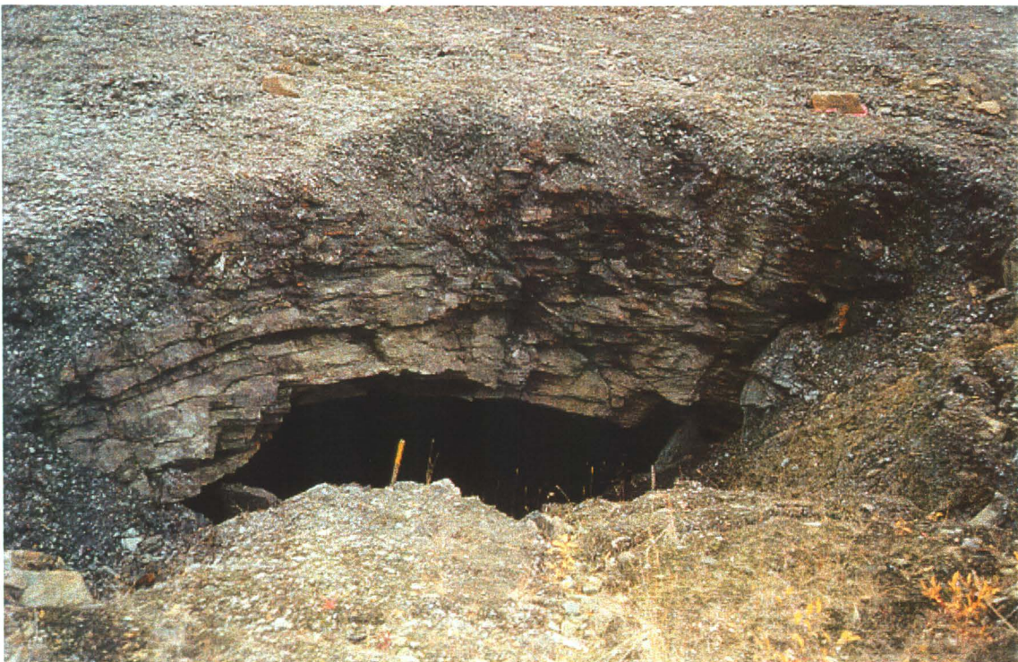
Photo 21-3: Open decline from recent (late 1980's) work. Note hazard from loose slabs in the roof resulting from horizontal foliation structures. (Azimuth 170°)