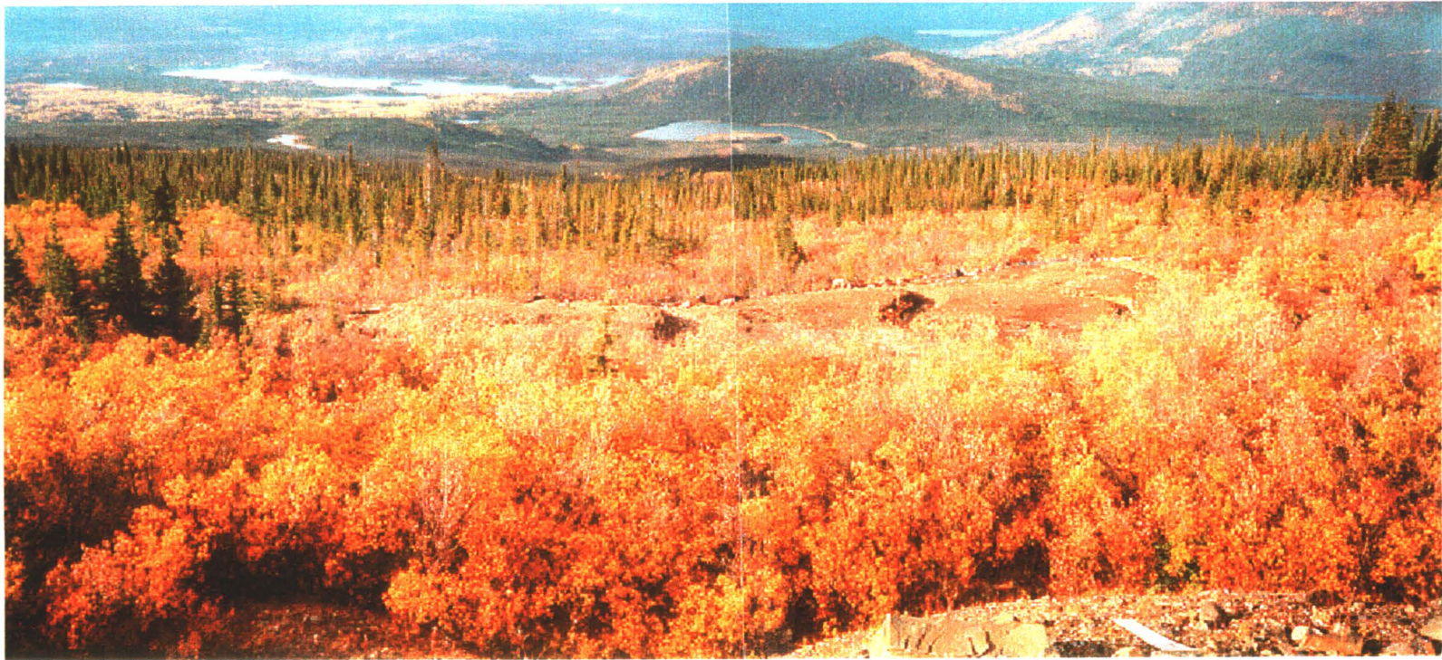
Photo 21-7: Mill tailings located below waste dumps. Note collapsed sheet metal impoundment structure and tailings delta in lake below at top-centre of photo. (Azimuth 335°)