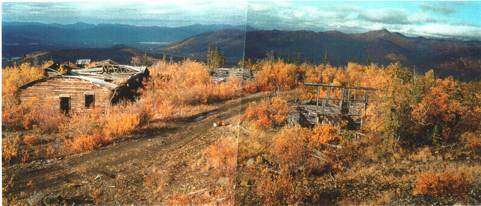
Photo 21-15: Mess hall, cookhouse and bunk houses (Bldgs. 21-G, H, I). Note lookout roof visible behind mess hall. (Azimuth 340-010°)