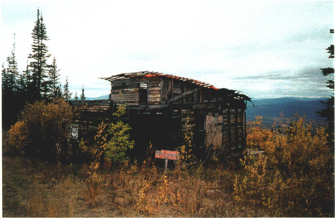
Photo 21-14: Dilapidated mine building (Bldg. 21-F). (Azimuth 260°)