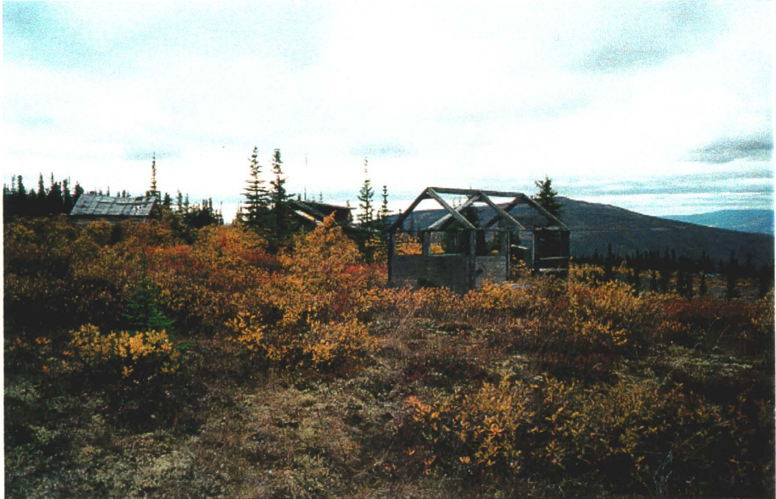
Photo 21-12: Tent frame structure (Bldg. 21-D). Note Bldgs. 21-A & C in background. (Azimuth 230°)