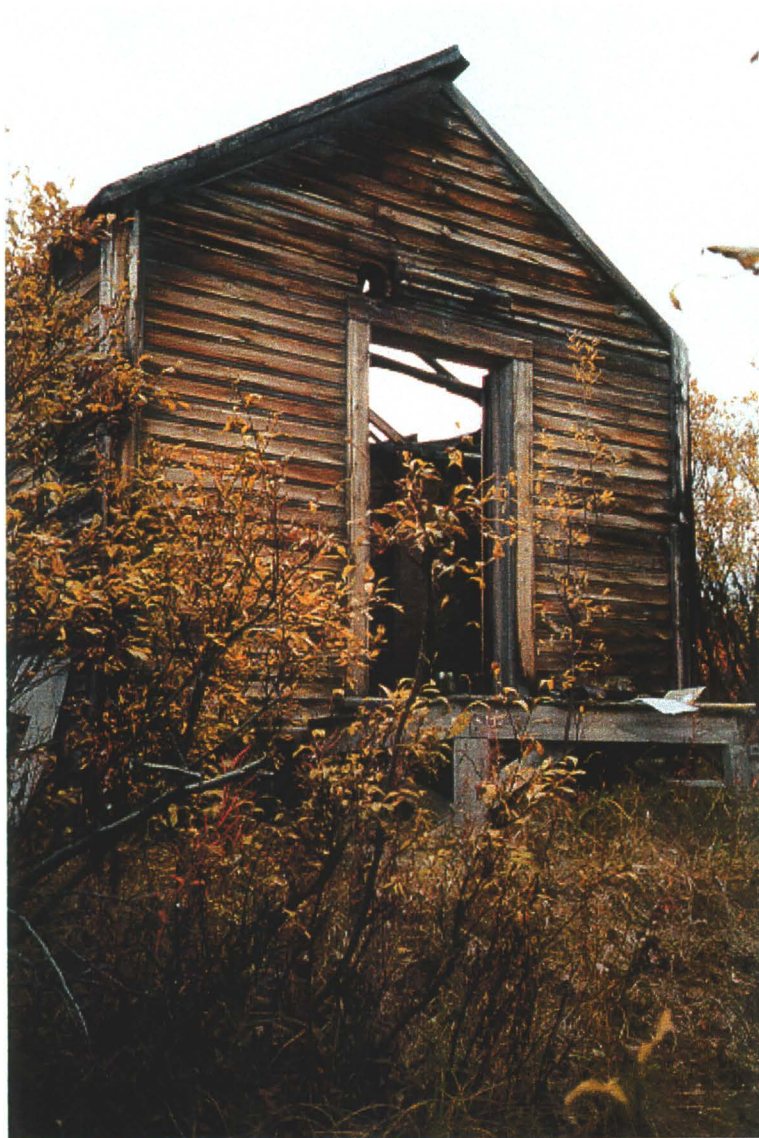
Photo 21-11: Partially collapsed building (Bldg. 21-C). (Azimuth 160°)