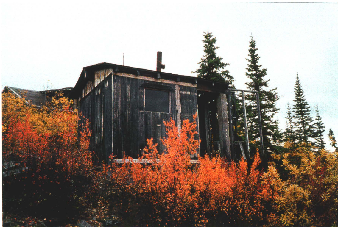
Photo 21-10: Sauna built in 1986 (Bldg. 21-B). Note sound condition. (Azimuth 180°)