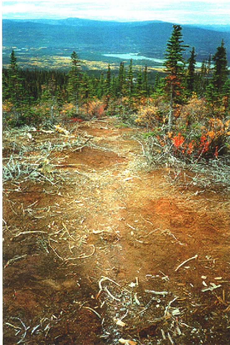
Photo 21-8: Tailings material 250m down slope of Wernecke Camp area (el. 1220m).