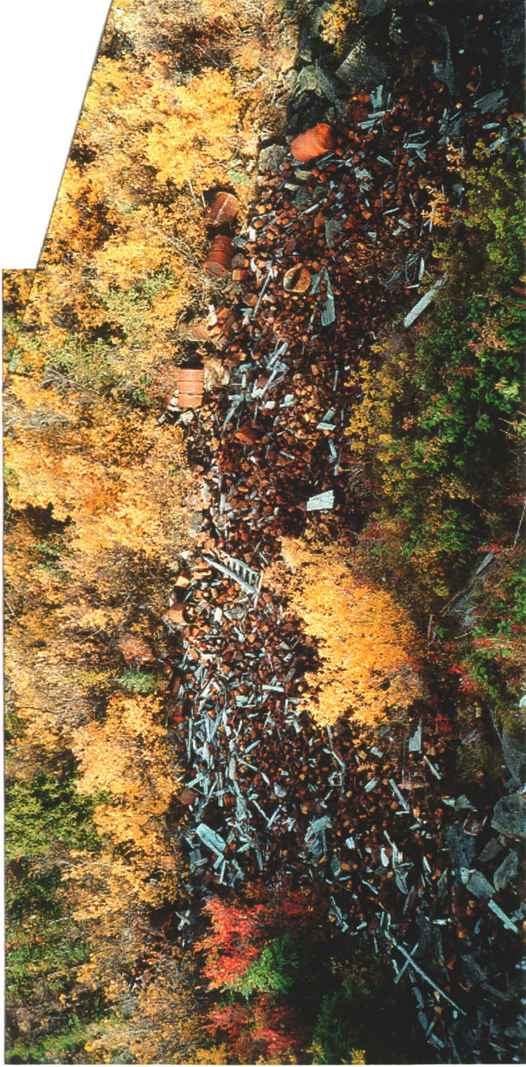
Photo 21-20: Dump site consisting primarily of cans and glass below cookhouse. (Azimuth 000°)