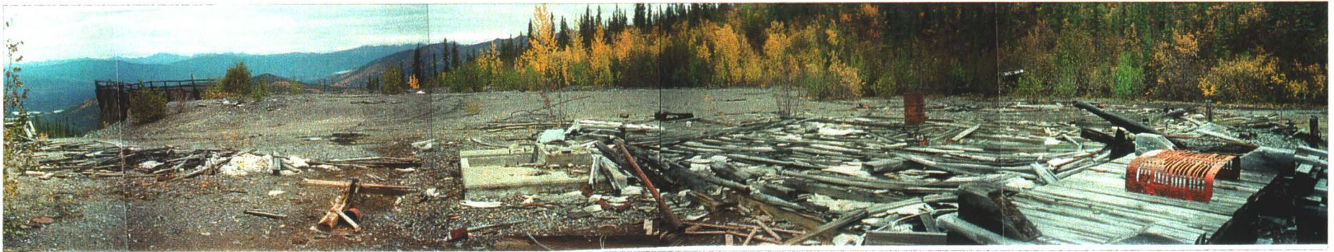
Photo 21-1: Panorama of main Werecke Camp and Sadie Ladue Mine area showing end dumped waste rock and overburden piles, Pitt#1 and decline hole to left, and partially collapsed shaft structures to far right.