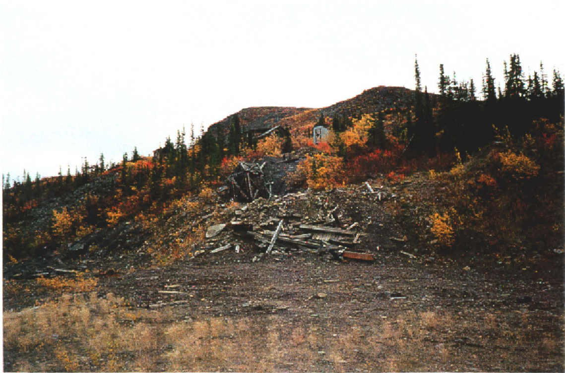
Photo 21-4: Sadie Ladue shaft area. Note dilapidated tressel, outhouse over callapsed manway and managers house in background. (Azimuth 080°)