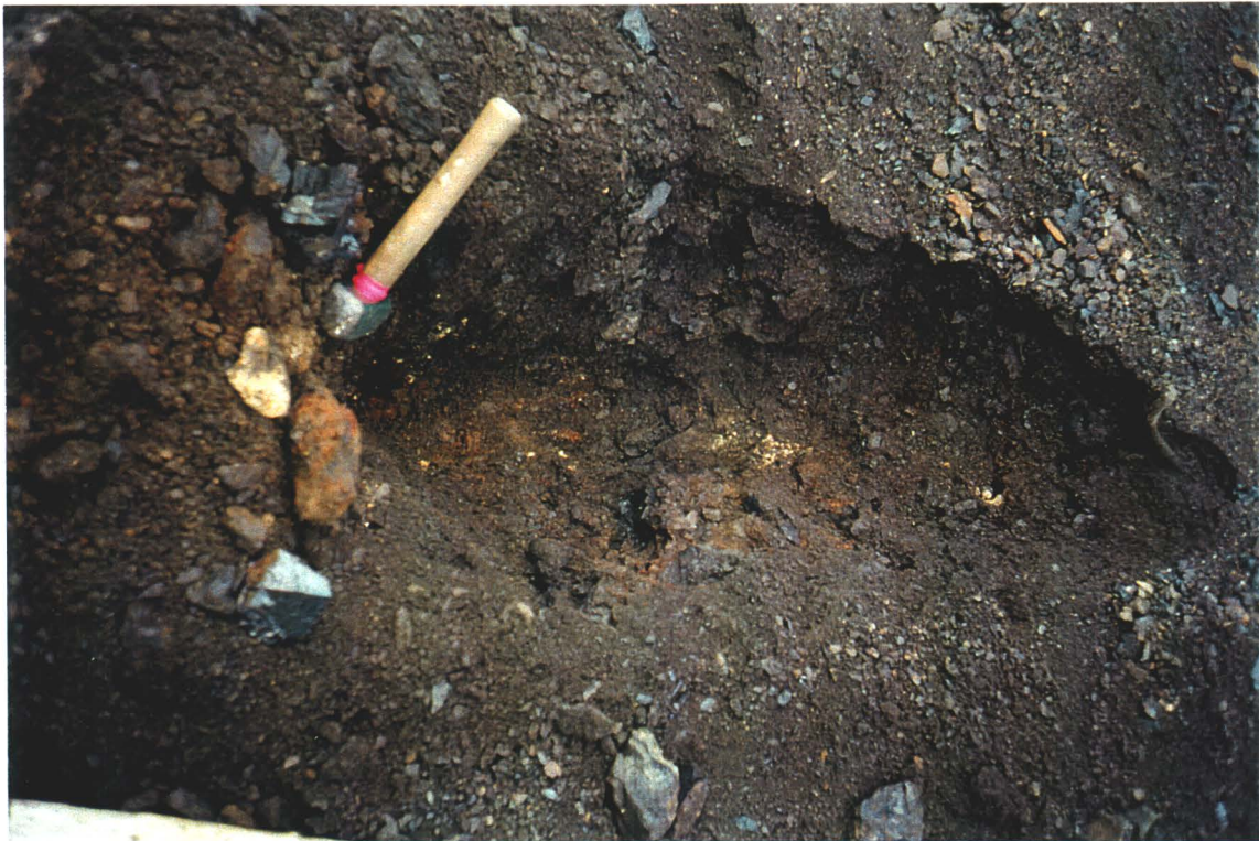
Photo 24-6: Waste rock dump WR-02 test pit (sample 24WR01-01) at Adit#2. Note strong oxidation at depth in pit and abundant siderite vein cobbles.