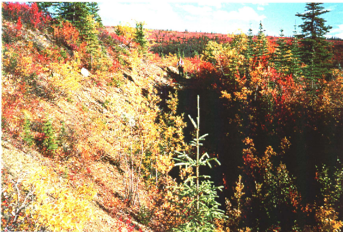
Photo 24-2: Upper Trench #1 into thick colluvial soils.(Azimuth 130°)