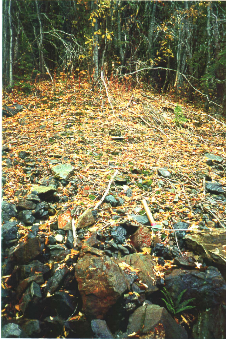
Photo 24-9: Rock dump WR-04. Note blocky greenstone and siderite vein material. (Azimuth 040°)