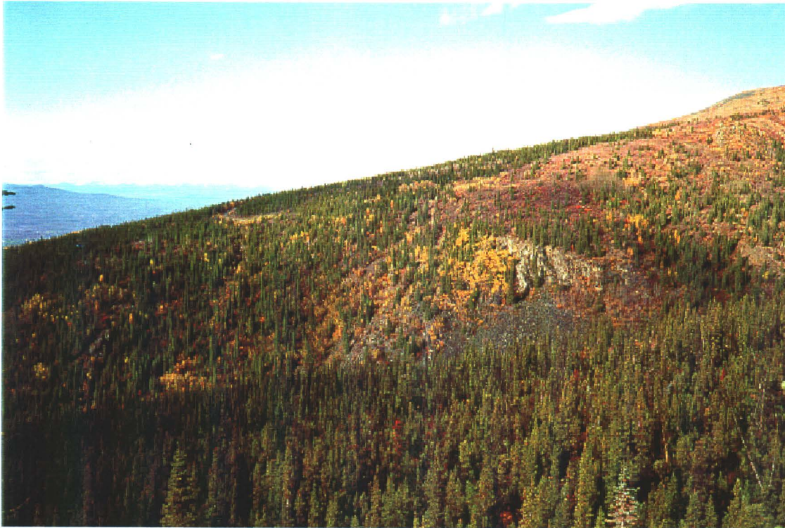
Photo 24-1: Overview of Croesus site. Note waste rock dump WR-02 from Adit #2 at phot centre; also Blackcap (Site #25) waste rock dumps at top right corner. (Azimuth 350°)