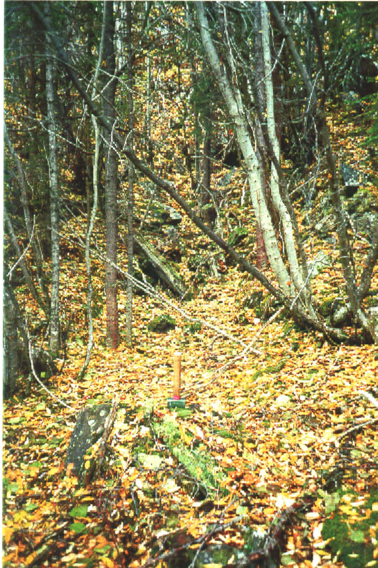
Photo 24-8: Collapsed portal at Adit #4. Note natural revegetation. (Azimuth 020°)