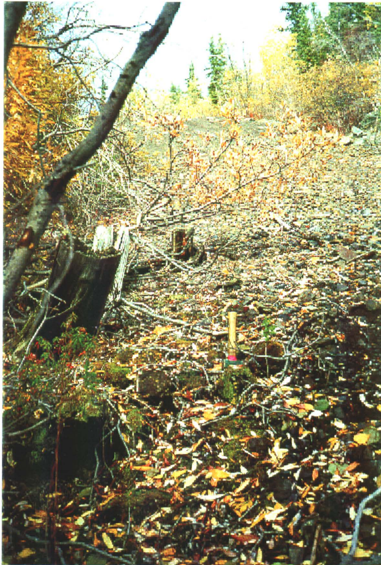
Photo 24-7: Adit #3 at base of rock dump WR-02. Note portal timbers to left of hammer. (Azimuth 000°)