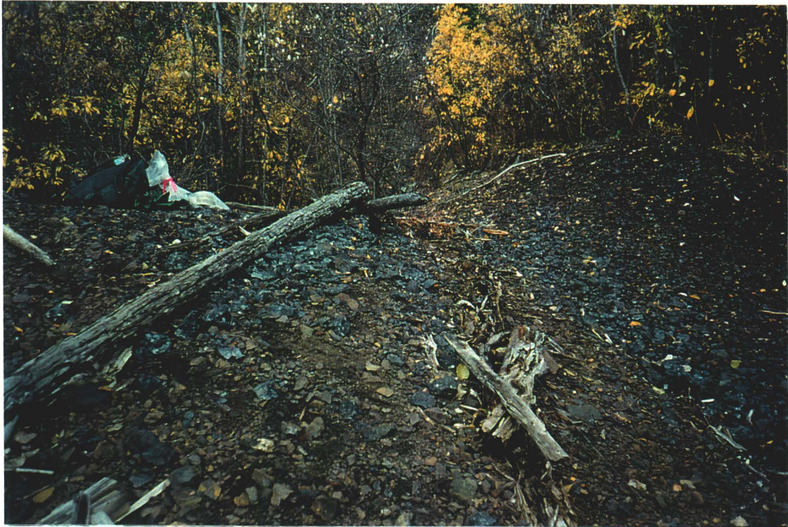
Photo 24-5: Top of waste rock dump WR-02. Note abundant manganese stained siderite vein material. (Azimuth 010°)