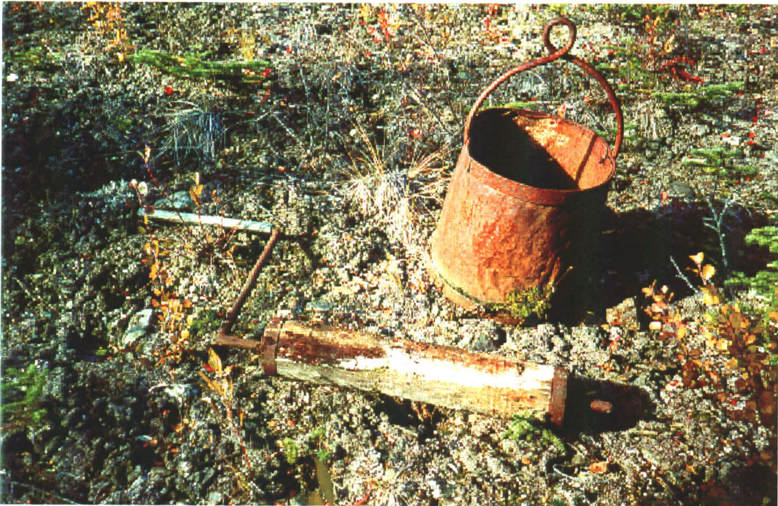
Photo 24-3: Windless and shaft bucket from backfilled shaft in area of upper trench (Shaft#1).