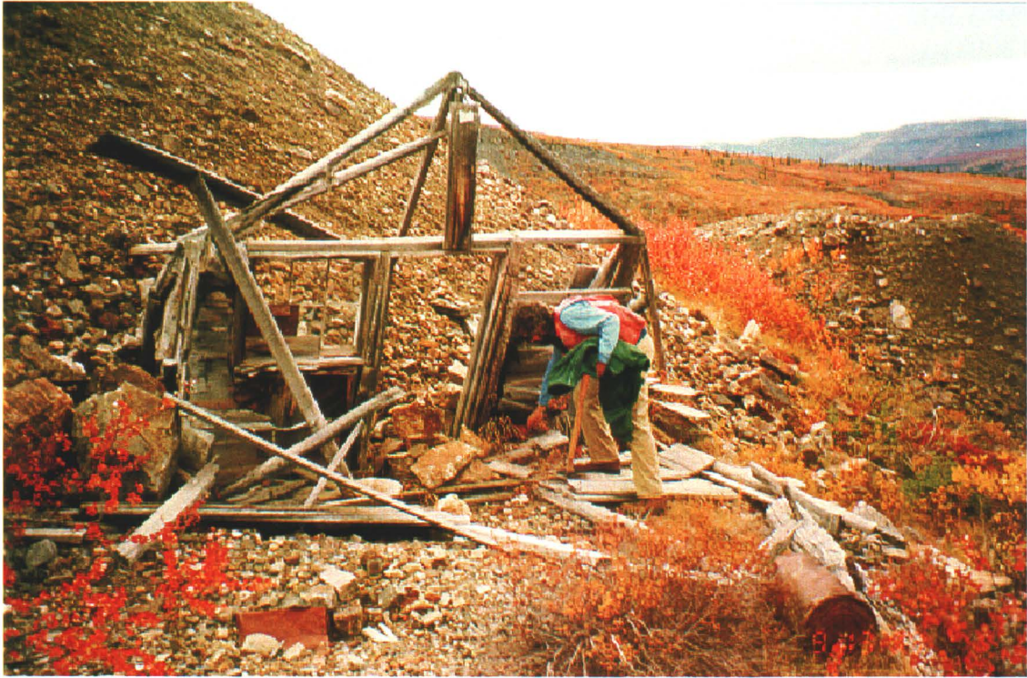
Photo 28-7: Remains of collapsed shed (building 28D) at old shaft.