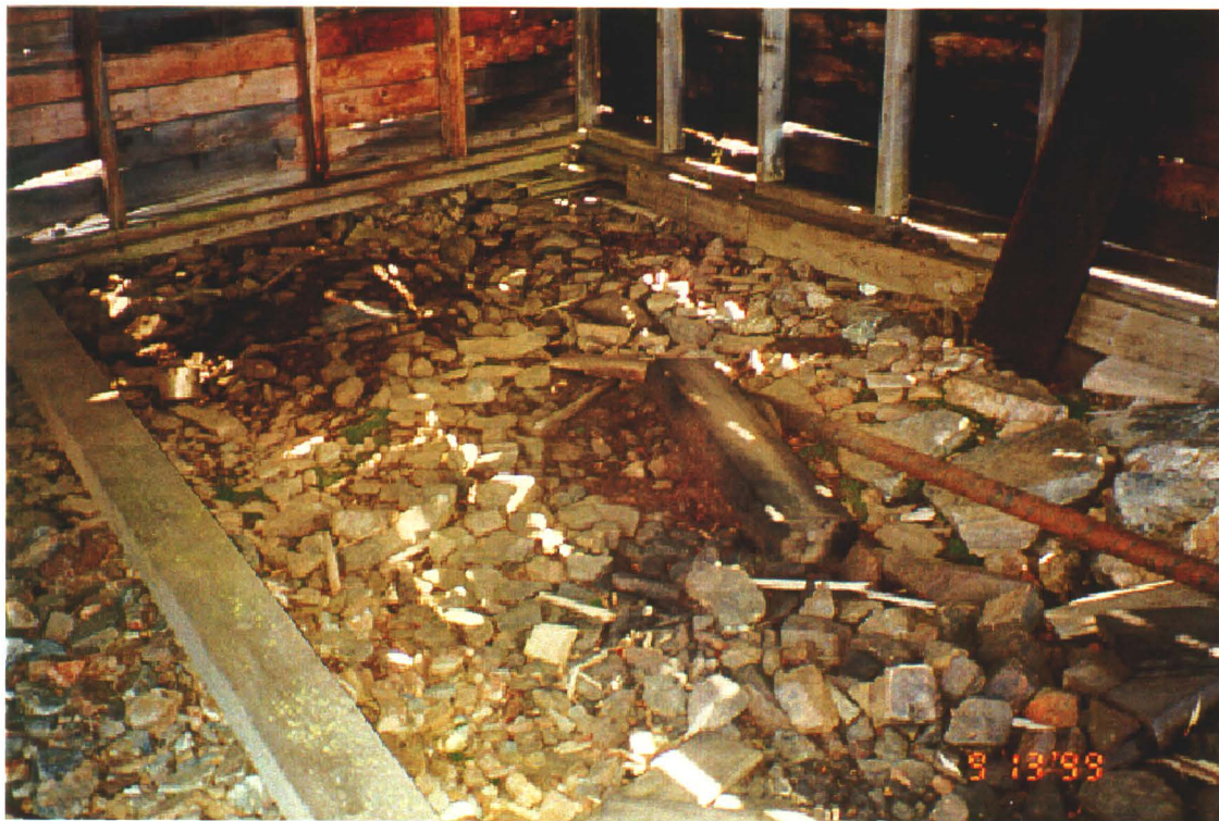
Photo 28-6: Interior of generator shed (building 28B). Note staining on rock.