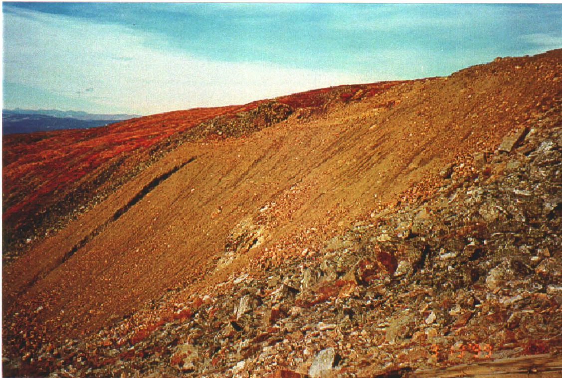
Photo 28-1: Waste rock below open cut at upper end of site. Note deep erosion path.