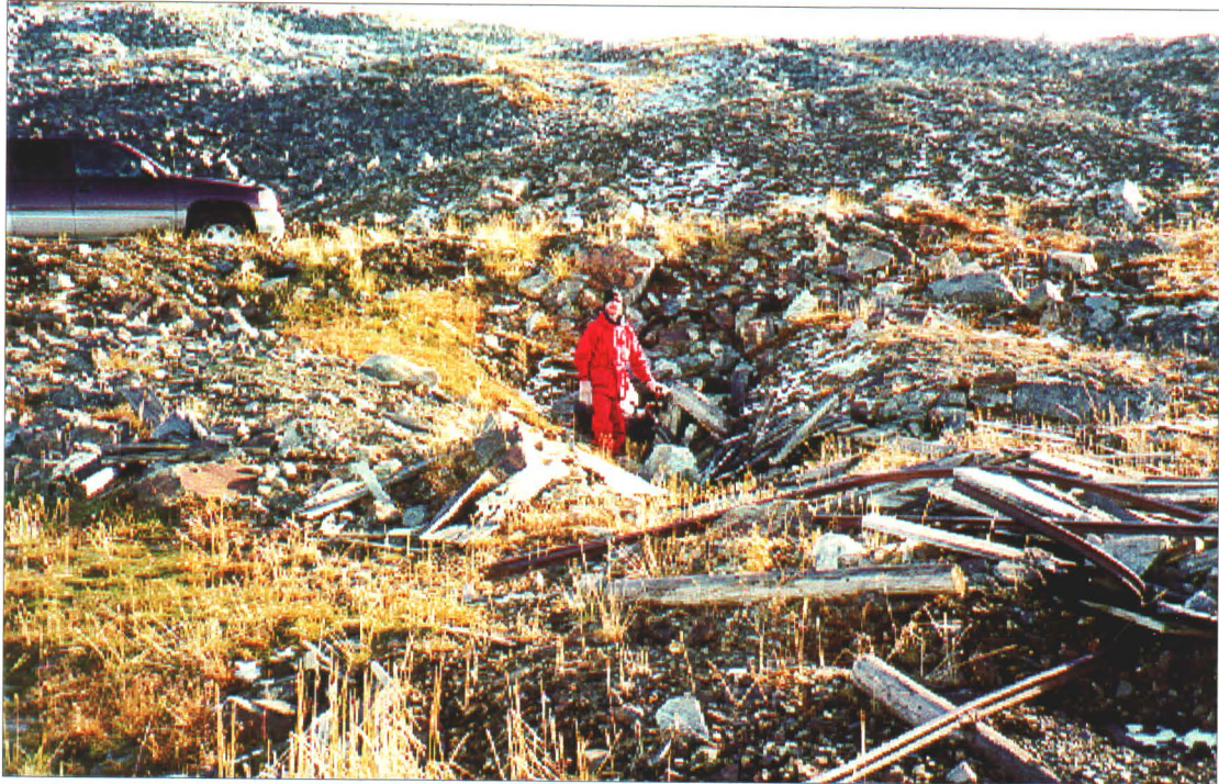
Photo 33-2 : Main Fault and Nabob. Collapsed Main Fault -Nabob Adit, truck is on Silver Basin Gulch Trail. (Azimuth150°)