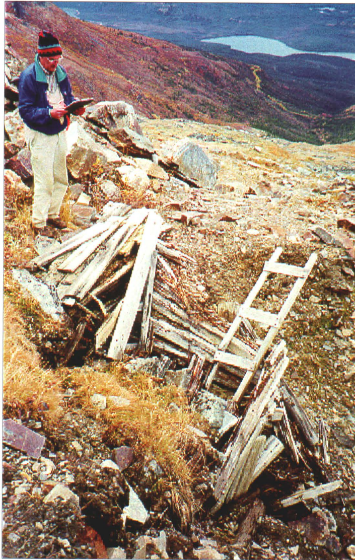
Photo 33-1 : Main Fault and Nabob. View of the Main Fault shaft, Gambler Lake is in the background. (Azimuth330°)