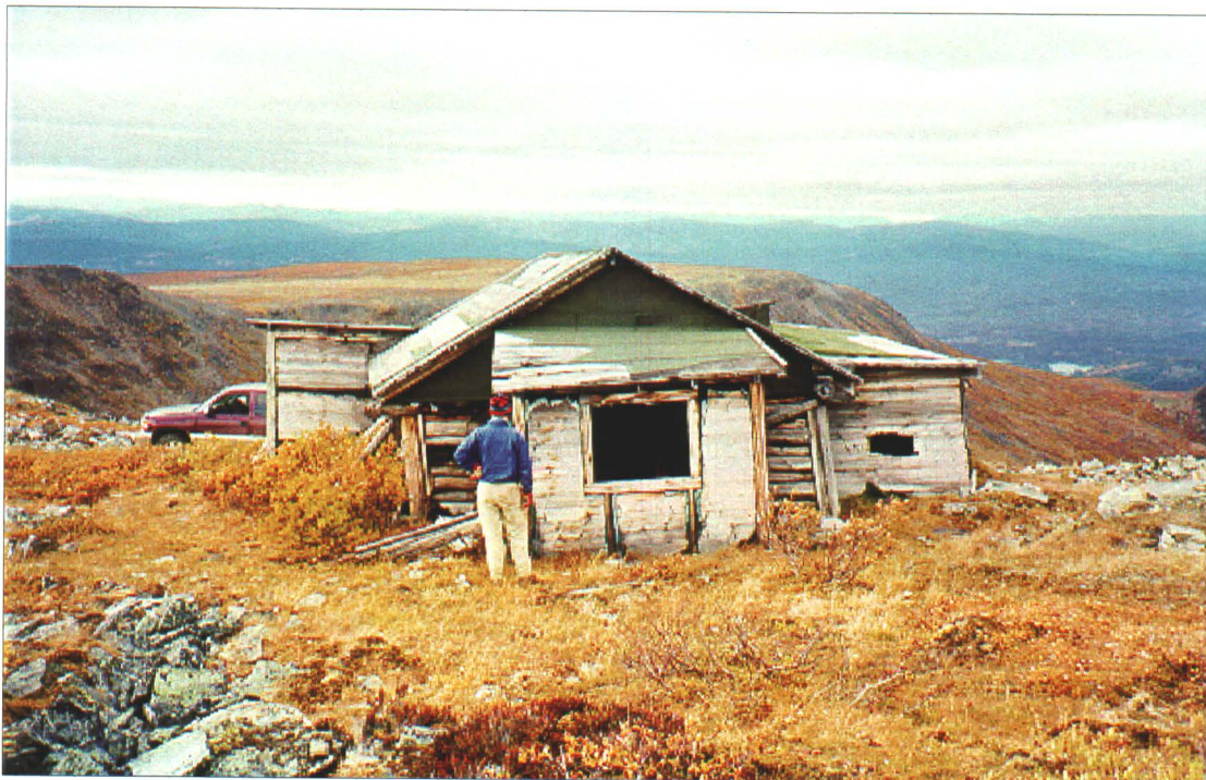
Photo 33-3 : Main Fault and Nabob Old log house on the south side of the Silver Basin Gulch Trail. (Azimuth335°)