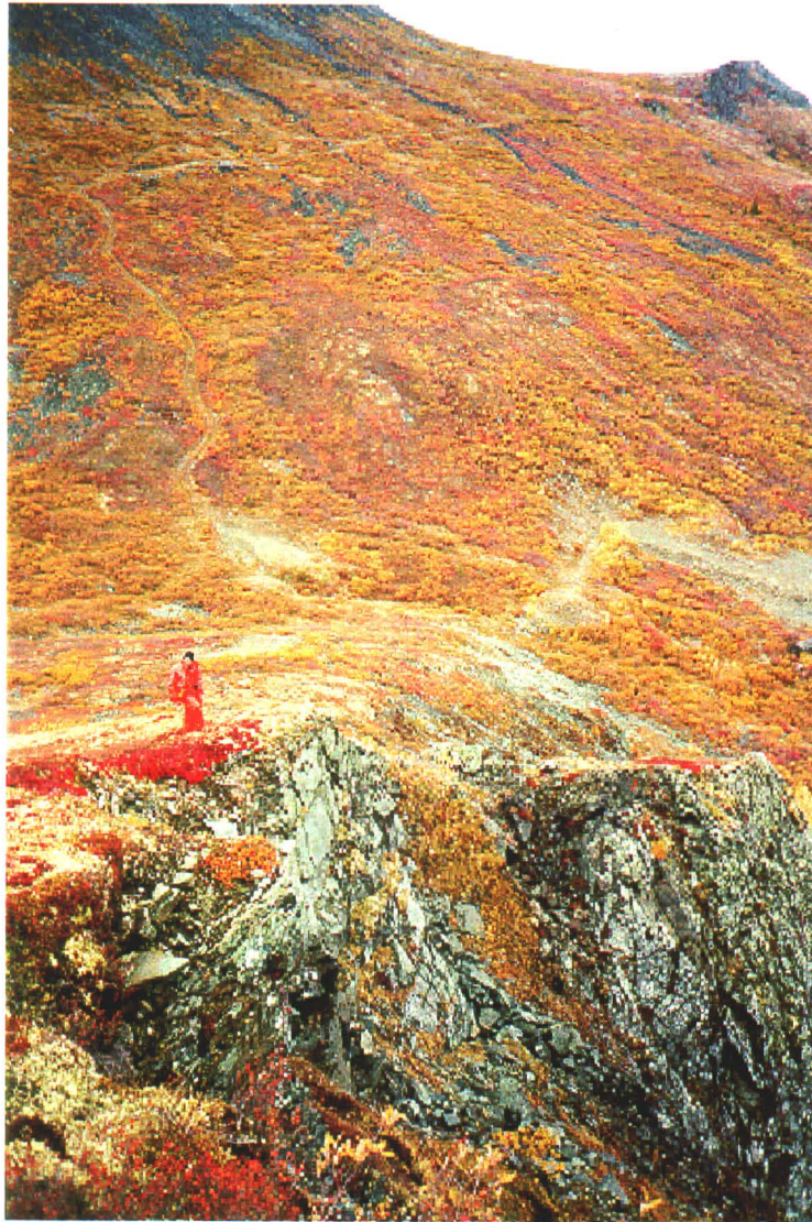
Photo 34-3: Lakeview trench cut located 10m right of sampler. (Azimuth 280°)