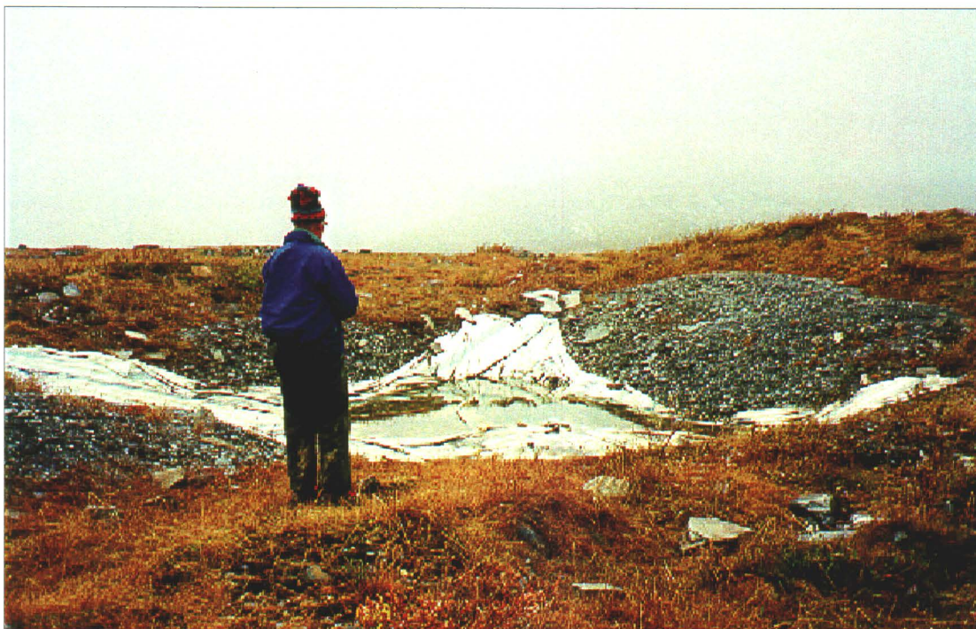
Photo 37-3 : Gold Hill No.2. Lined sump used for holding water for diamond drilling. (Azimuth 280^{\circ} )