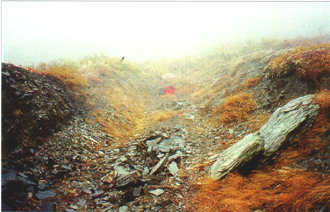
Photo 37-2 : Gold Hill No.2. View of Trench #5. (Azimuth 340^{\circ} )