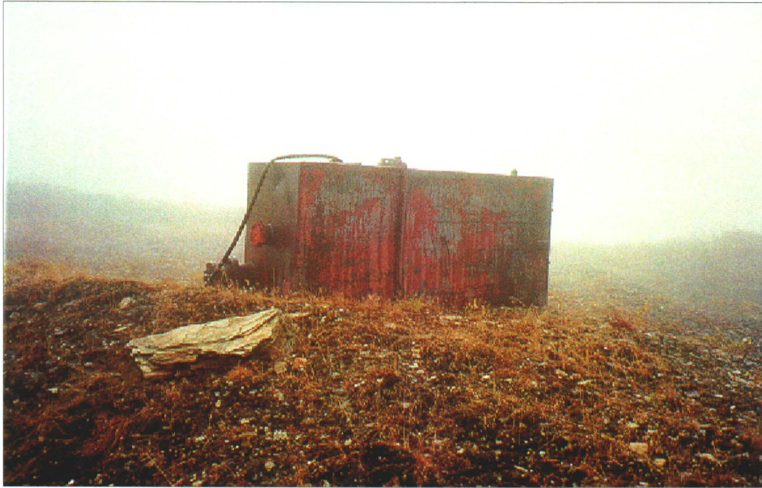
Photo 37-4 : Gold Hill No.2. Metal water tank near Trench #4. (Azimuth212°)