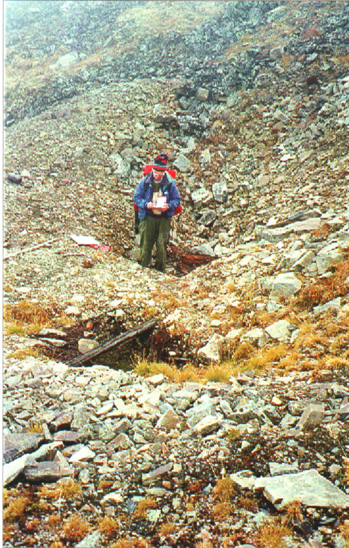
Photo 37-1 : Gold Hill No. 2. View of the Discovery shaft and showing. (Azimuth320°)