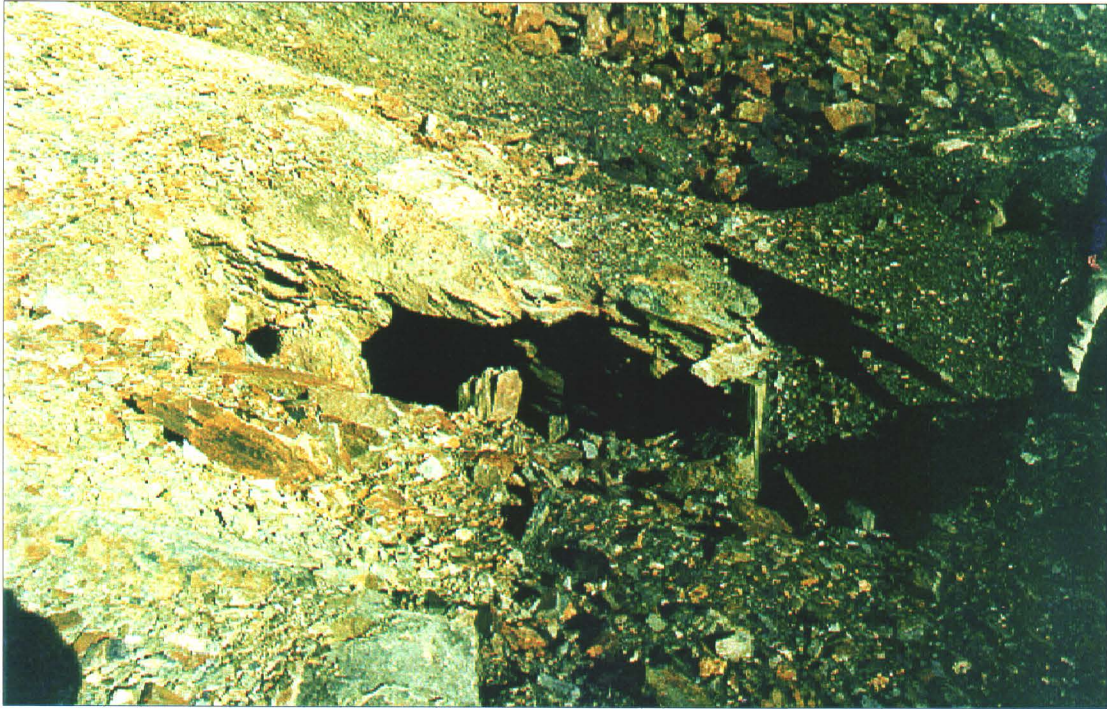
Photo 39-1 : Caribou. Caribou adit; portal exposed by bedrock striping. (Azimuth 080 °)