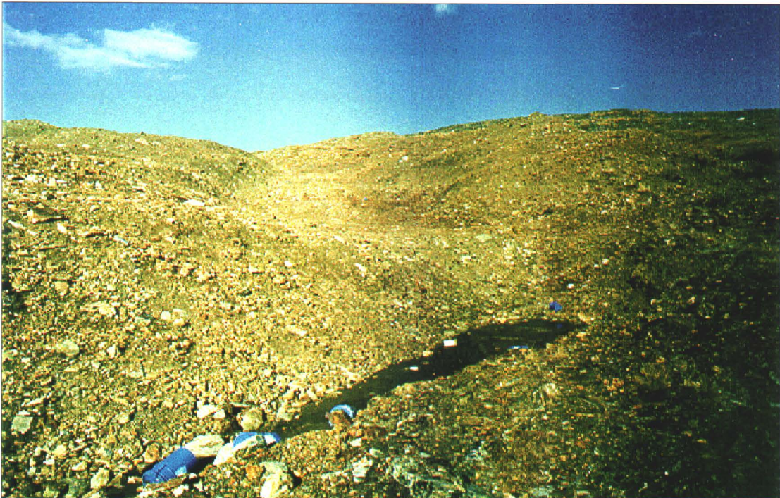
Photo 39-2 : Caribou. View of bedrock trench at Caribou. Note empty plastic pails and water sample site in foreground. (Azimuth ~000 °)