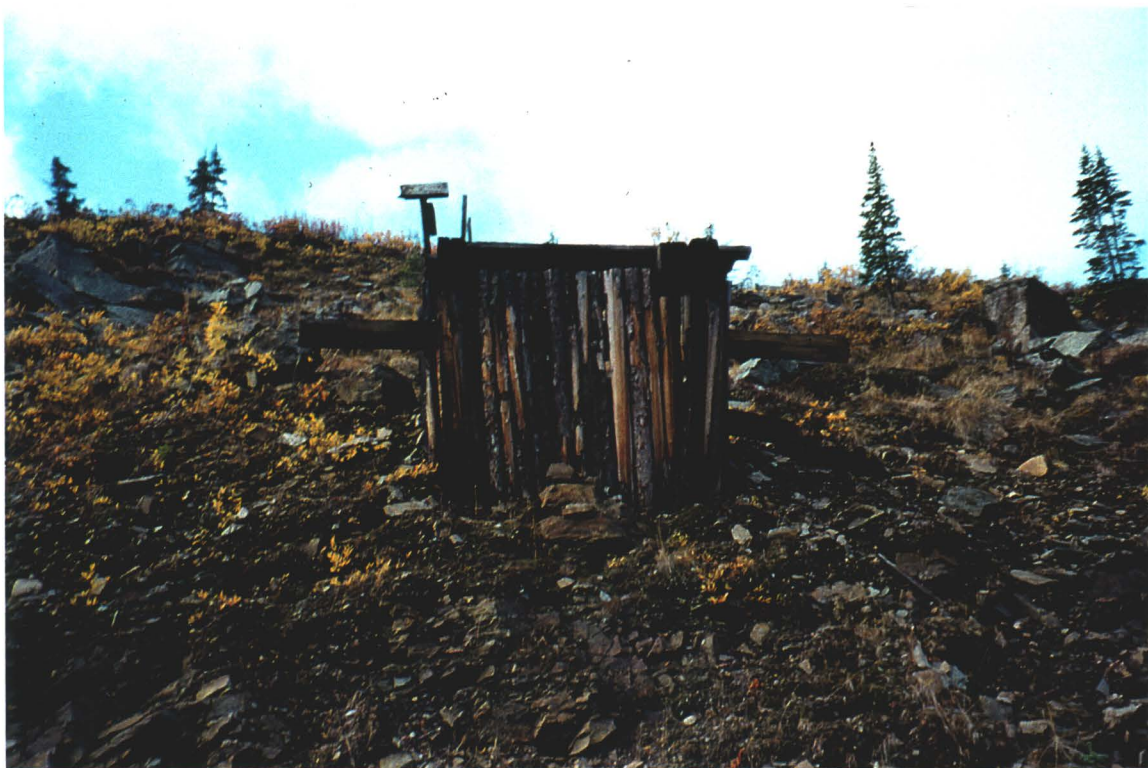
Photo 42-1 : Faith. Faith timber shaft cover building (Building 42-B). (Azimuth 200 o )