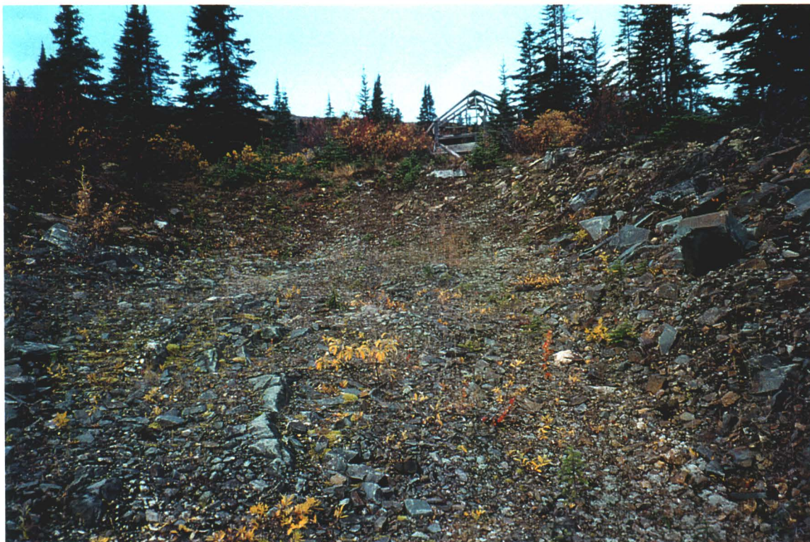
Photo 42-2 : Faith. View along trench (Trench #3) at tent brame (Building 42-A). (Azimuth 230 o )