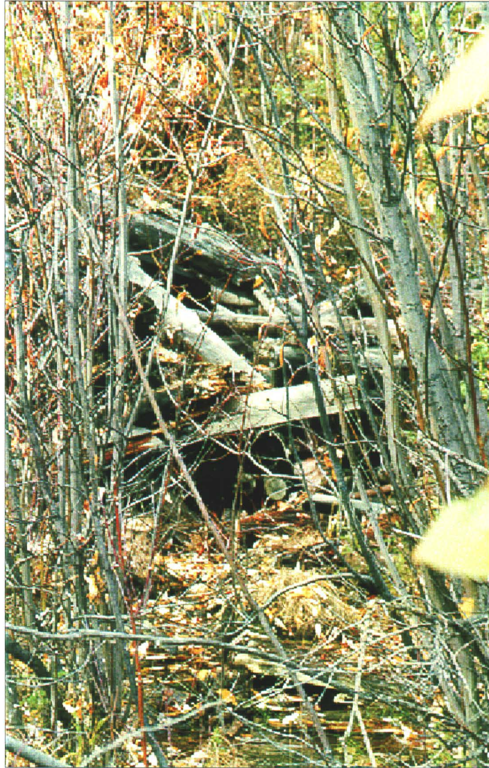
Photo 65-1 : Shanghai. Collapsed Main Adit with water flowing. (Azimuth 340°)