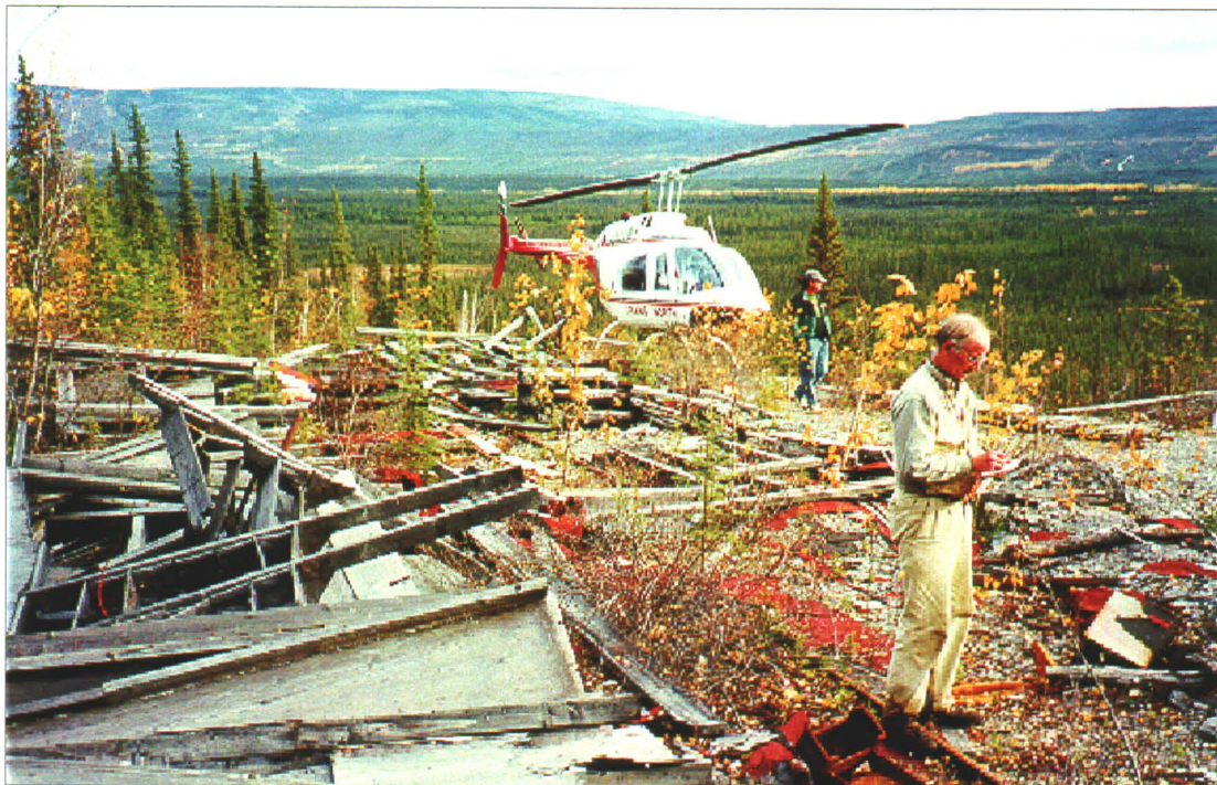
Photo 65-2 : Shanghai. Aerial view of waste rock pile and mine site debris. (Azimuth 120°)