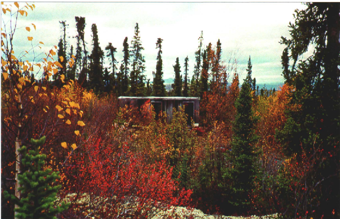
Photo 66-3 : Moon. Building 66A, most likely it was used as sleeping quarters. (Azimuth 315°)