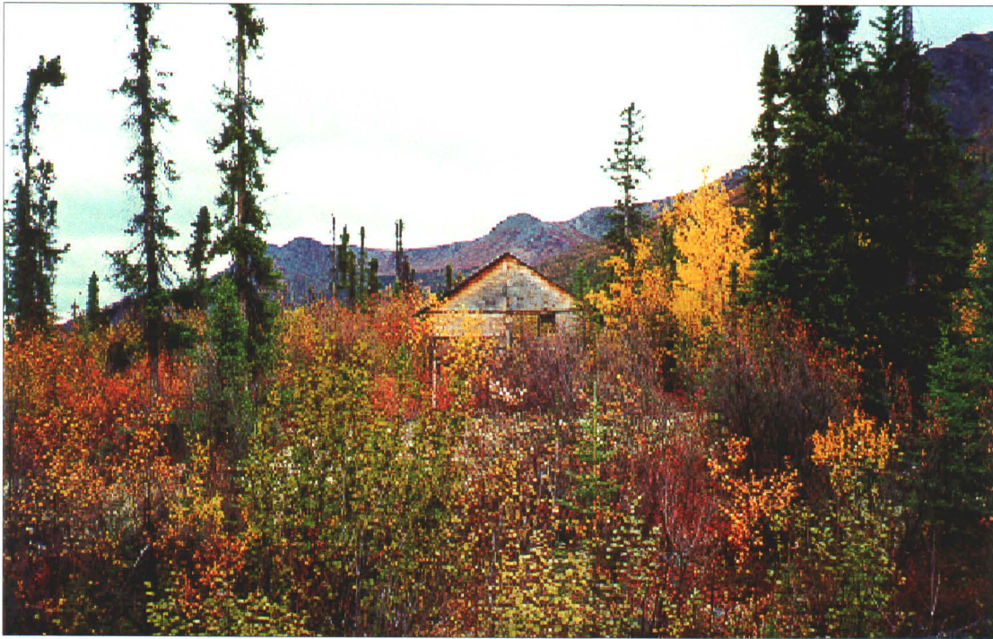
Photo 66-4 : Moon. Building 66B, possibly it was a workshop. (Azimuth 135°)