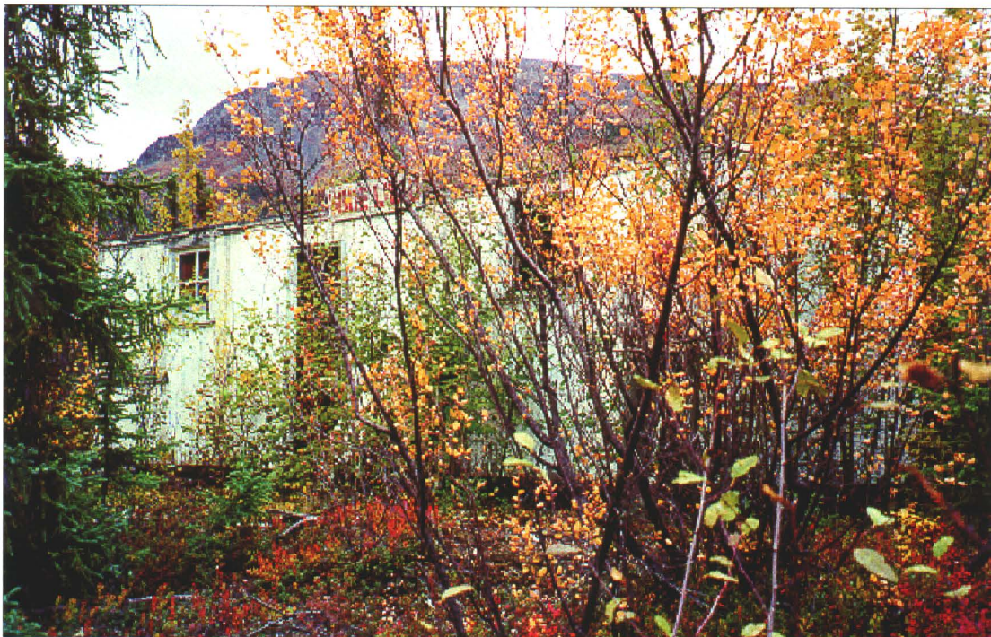
Photo 66-5 : Moon. Building 66C, the kitchen is on an iron skid. (Azimuth 180°)