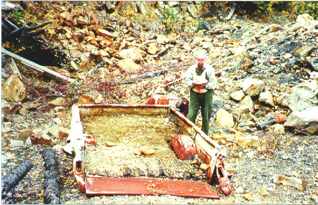
Photo 66-2 : Moon. Ore stockpiled in a truck box, portal structure in the background. (Azimuth 275°)