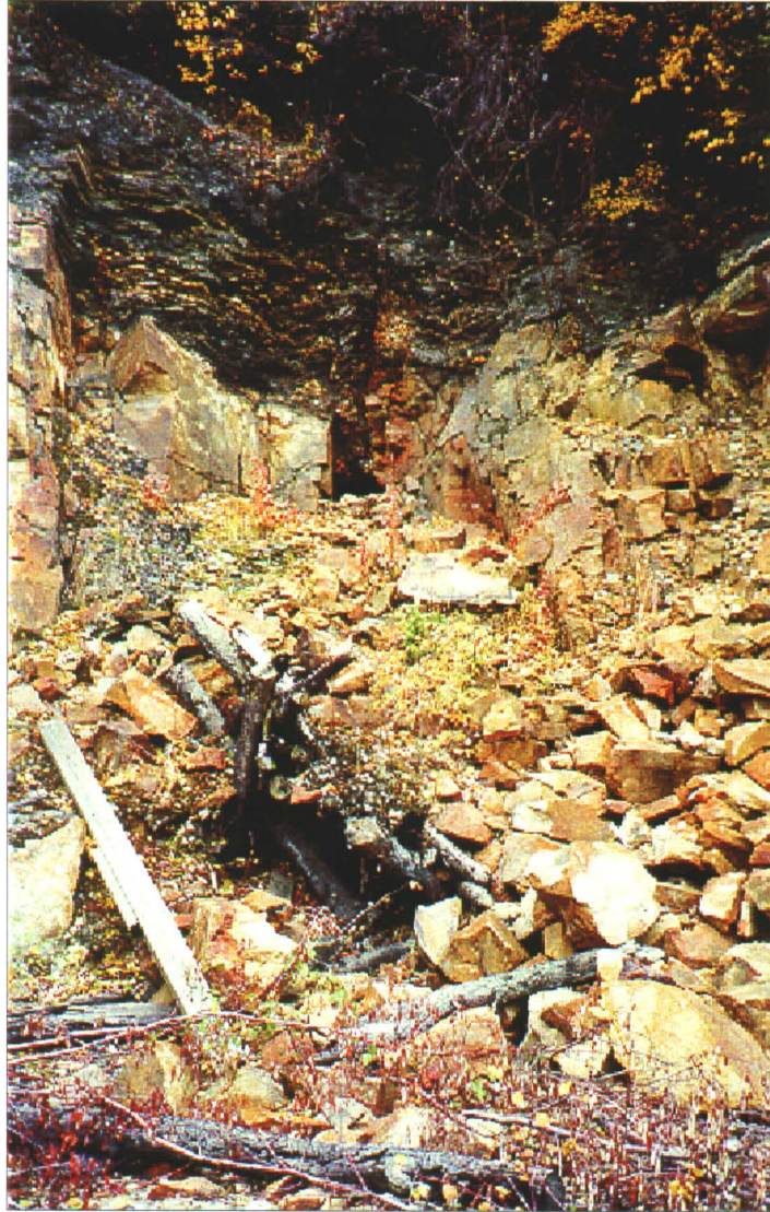
Photo 66-1 : Moon. The first 10m of the portal structure into the Moon adit has collapsed. (Azimuth 216°)