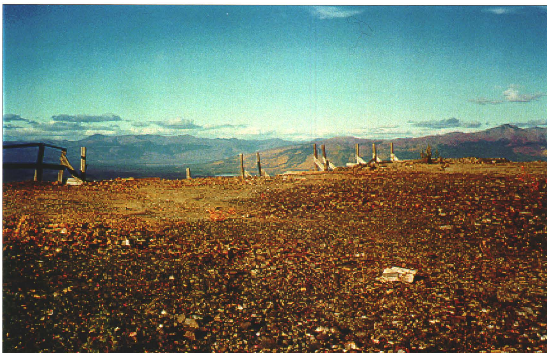
Photo 76-1: Facing north from the adit across loading area and dump site.