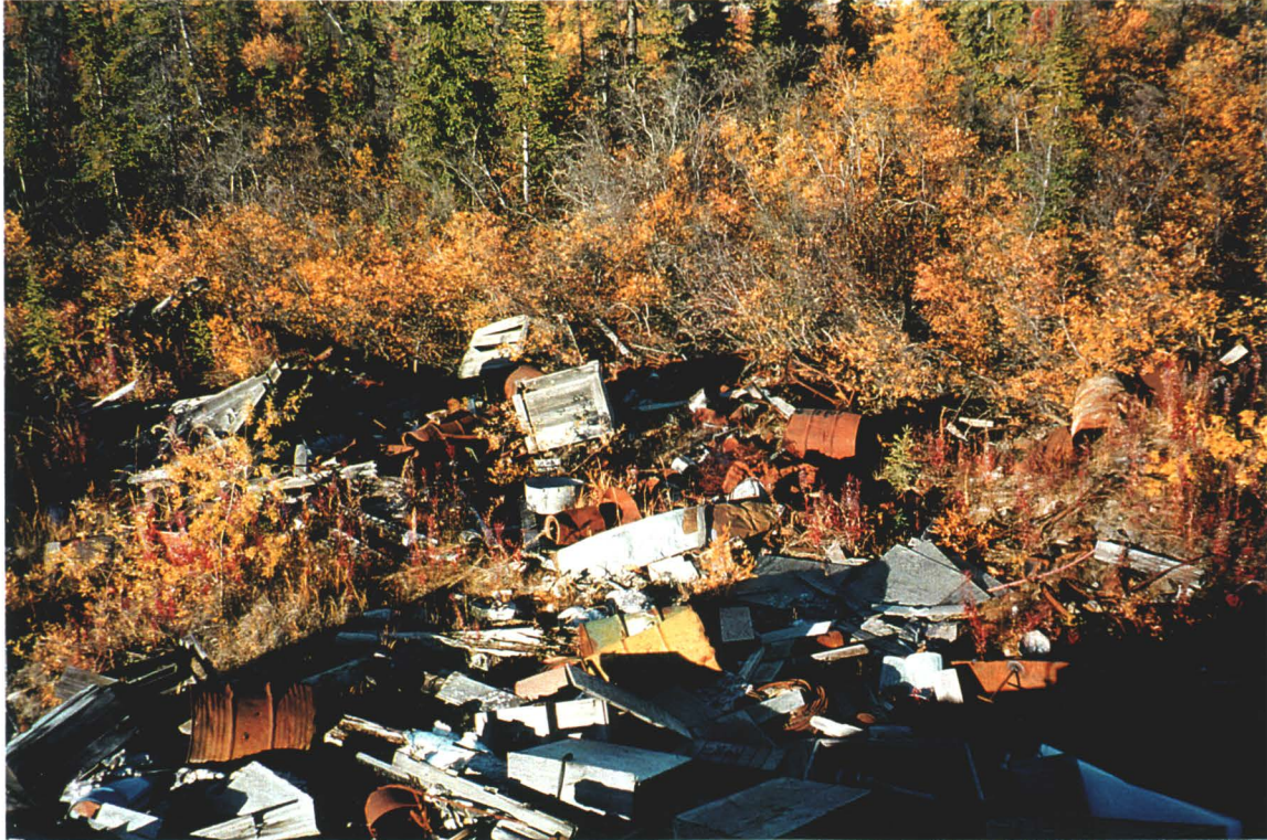
Photo 76-5: Photo taken 150m below the Townsite mine waste dump of the solid waste dump.